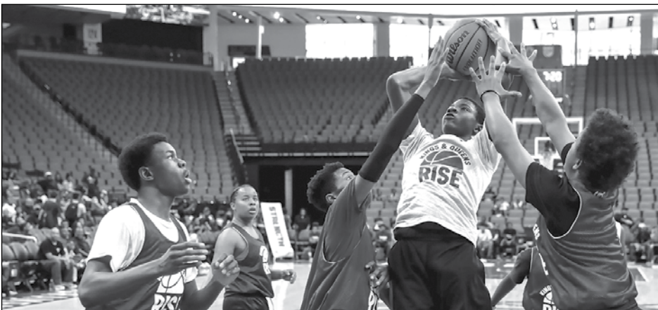
Kings and Queens Rise provides young people opportunities to engage in intercommunity activities, which help prevent and interrupt violence.