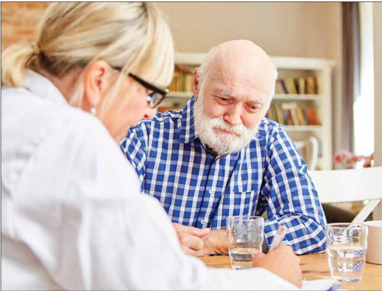
Thirty-year-old Medi-Cal income limit leaves some seniors without needed care.