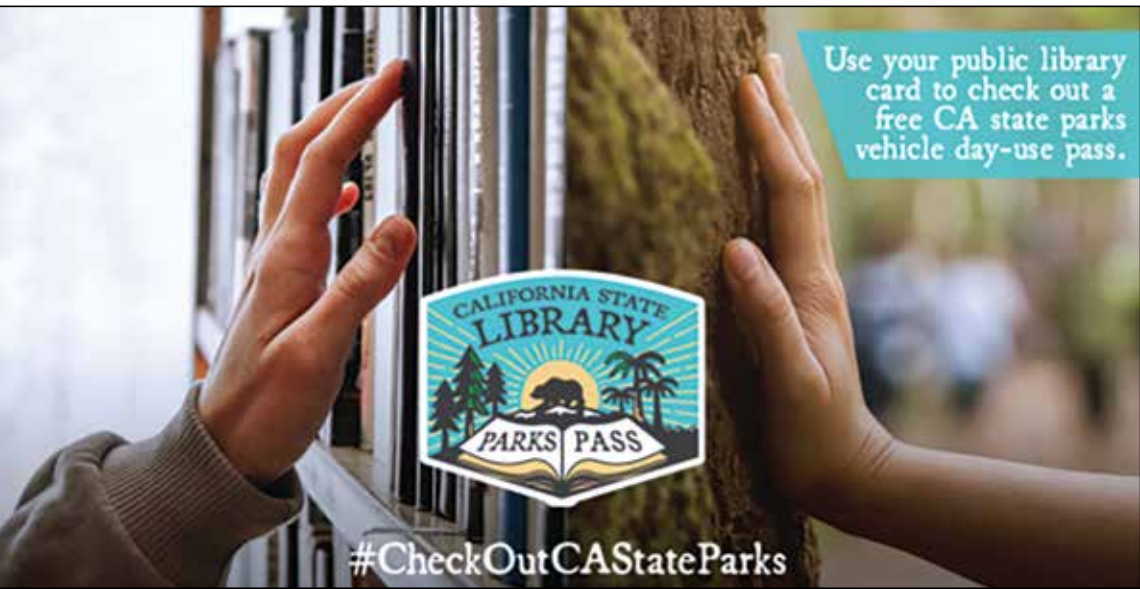
Visit your local public library and check out a California State Library Parks Pass.