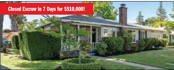
1118 Meadow Road, West Sacramento 95691 $484,900