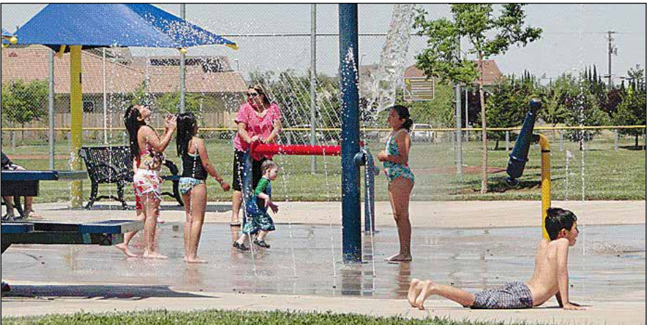
The Spray Ground facility is located at Bridgeway Lakes Community Park, 3650 Southport Pkwy, West Sacramento, and is free to the public.

WEST SACRAMENTO, CA (MPG) - Beat the heat and bring the whole family out to the Spray Ground! The facility is located at Bridgeway Lakes Community Park, 3650 Southport Pkwy, West Sacramento, and is free to the public. 2022 Season Hours of Operation: June 15th to August 31st: 1 p.m. - 7 p.m., Daily; September 1st to September 30th: 2 p.m. - 6 p.m., Daily. Please note: Water conservation measures, including the use of water conserving nozzles and adjusted spray sequencing, have been implemented to