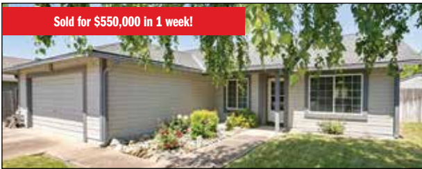
2881 Goldeneye Court, West Sac 95691 $549,900