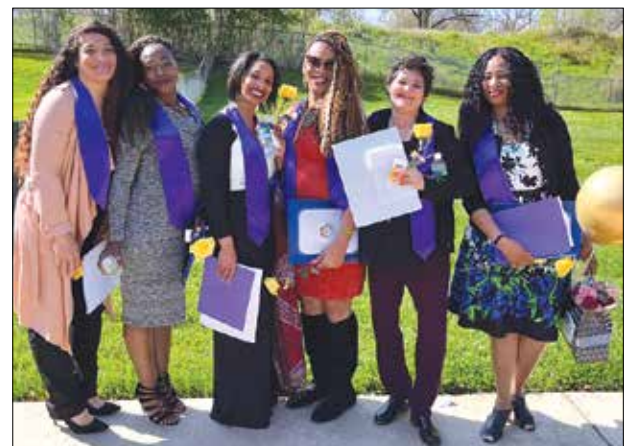
Six Sacramento women experiencing homelessness graduated from Women's Empowerment in March. The organization recently received funding from Kaiser Permanente Northern California Community Benefit Programs.

Women's Empowerment provides a two-month employment-readiness and empowerment program, paid job training, childcare and support services so all women and