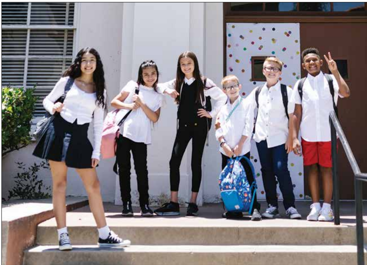
California backs away from COVID vaccine mandates for kids.