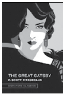
The Great Gatsby by F. Scott Fitzgerald

too blinded by her pride to see the man before her until she receives a letter that changes everything. Elizabeth quickly realizes her pride and prejudice were almost her fall preventing her to see her true affections for Mr. Darcy.