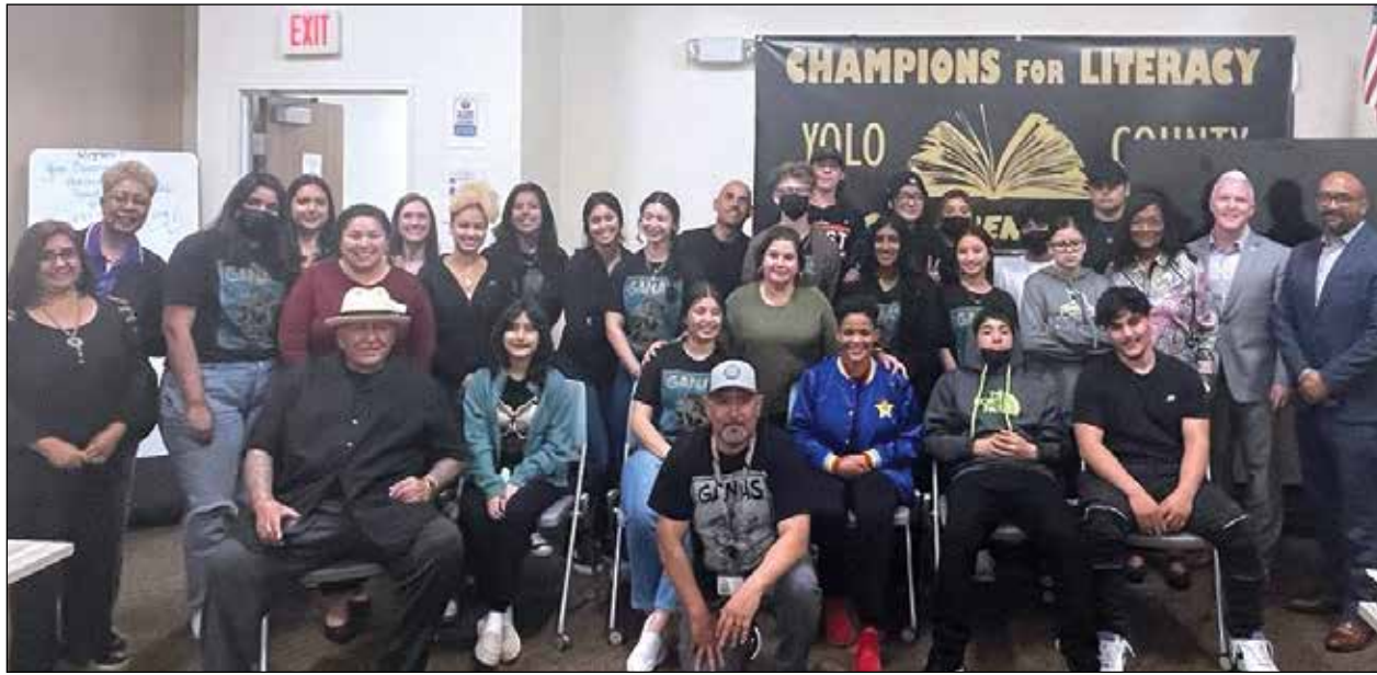
23 high school students completed the program offered by the Yolo County DA's Multi-Cultural Community Council and the Yolo County Office of Education.