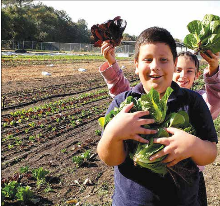
Students help harvest lettuce greens while on a farm field trip.