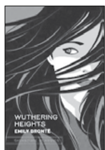
Wuthering Heights Emily Bronte

While Regency Era fandom is reaching new heights in the media with Netflix's Bridgerton series, based on the bestselling series by Julia Quinn; this is the perfect time to dive into two notable classics that will deliver all the angst, drama, and desire of the time era.