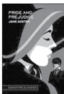
Pride And Prejudice by Jane Austen

A Gothic, atmospheric, and tragic tale that will take readers into the throes of jealousy, obsession, and vengeance. Thirty years ago, the master of Wuthering Heights returned home with an orphan boy. While his daughter quickly formed an unyielding bond, his son instantly harbored hostility and resentment for the boy quickly taking his place. As adults, the story of what truly happened, as a result, unfolds into a tale of jealousy, unrelenting desires, lost love, and a hatred so strong the aftermath echoes throughout the next generation. Follow the story of Catherine, Heathcliff, and Hindley in a story that scholars have revered as one of the most popular novels in history.