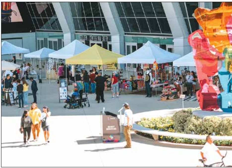
Up to 50 local vendors and artisans are to be set up to offer an ever-changing and diverse assortment of handmade specialty items.

By Traci Rockefeller Cusack, TRock Communications