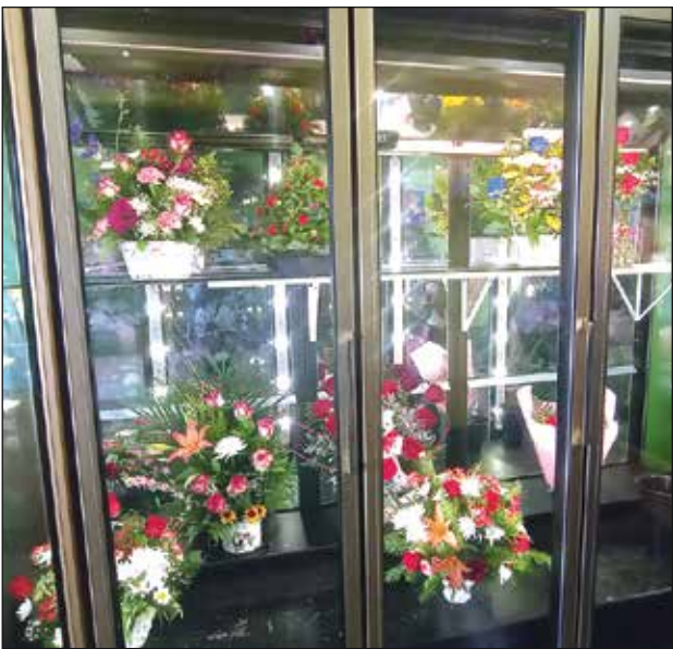
A few examples of floral arrangements for sale at Campos Florist.

This florist can make gorgeous arrangements to fit your needs and they are available for pick-up or delivery only. Campos Florist is a bilingual (Spanish/English) business. Though you cannot order online, they do have a website where you can view some of the extraordinary work they’ve done. Visit campos-flowers-gifts.business.site/?utm_source=gmb&utm_medium=referral . In