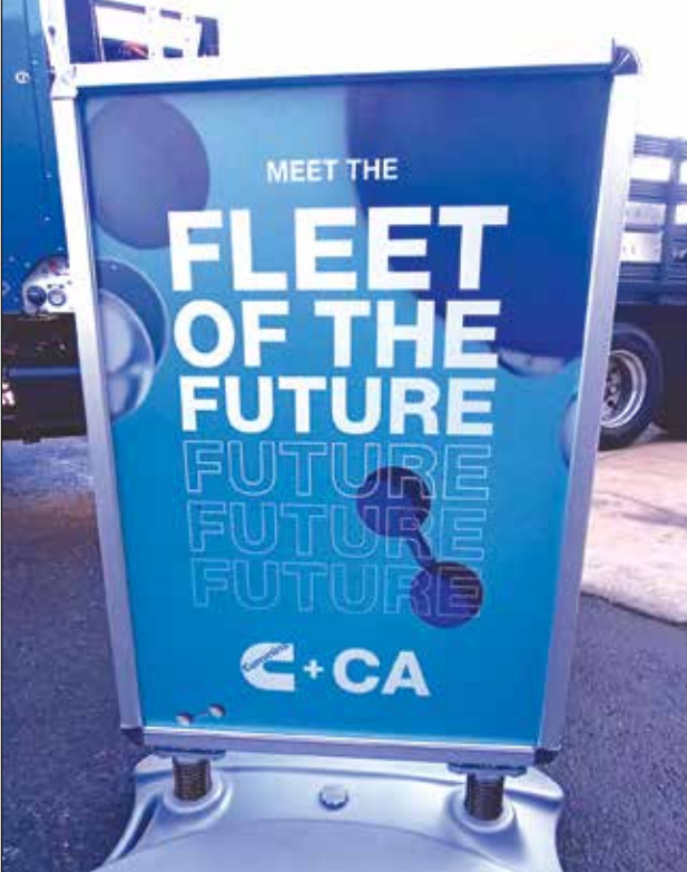
Working hard to help our future.

Cummins has been working on how to use Hydrogen as a power source. If you remember from science class, water is H2O. That