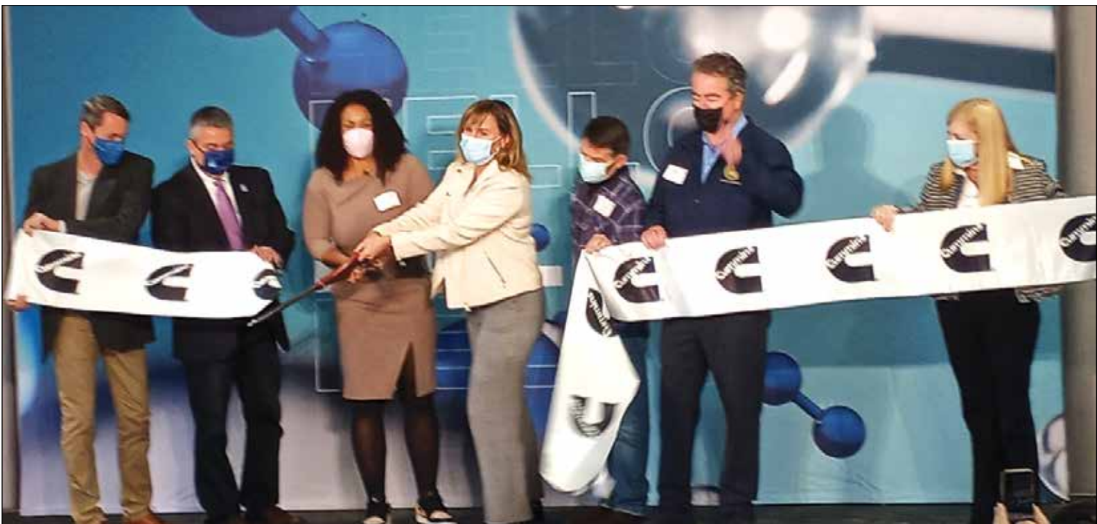
Cummins and West Sacramento City Officials cutting the grand opening ribbon on December 1st at Industrial Blvd.

In the new facility they will develop and test heavy duty hydrogen fuel cells. They will develop powertrains for original equipment and work on converting existing commercial fleets with fuel cell powertrains, in order to reduce the emissions the trucks are currently releasing. ★