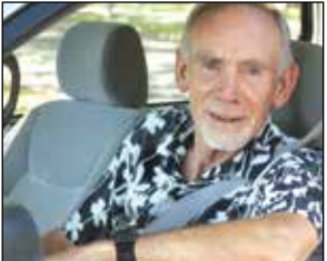
The Age Well, Drive Smart class is an education program specifically designed to help seniors.

CHP Helps Prepare Senior Drivers for Years to Come