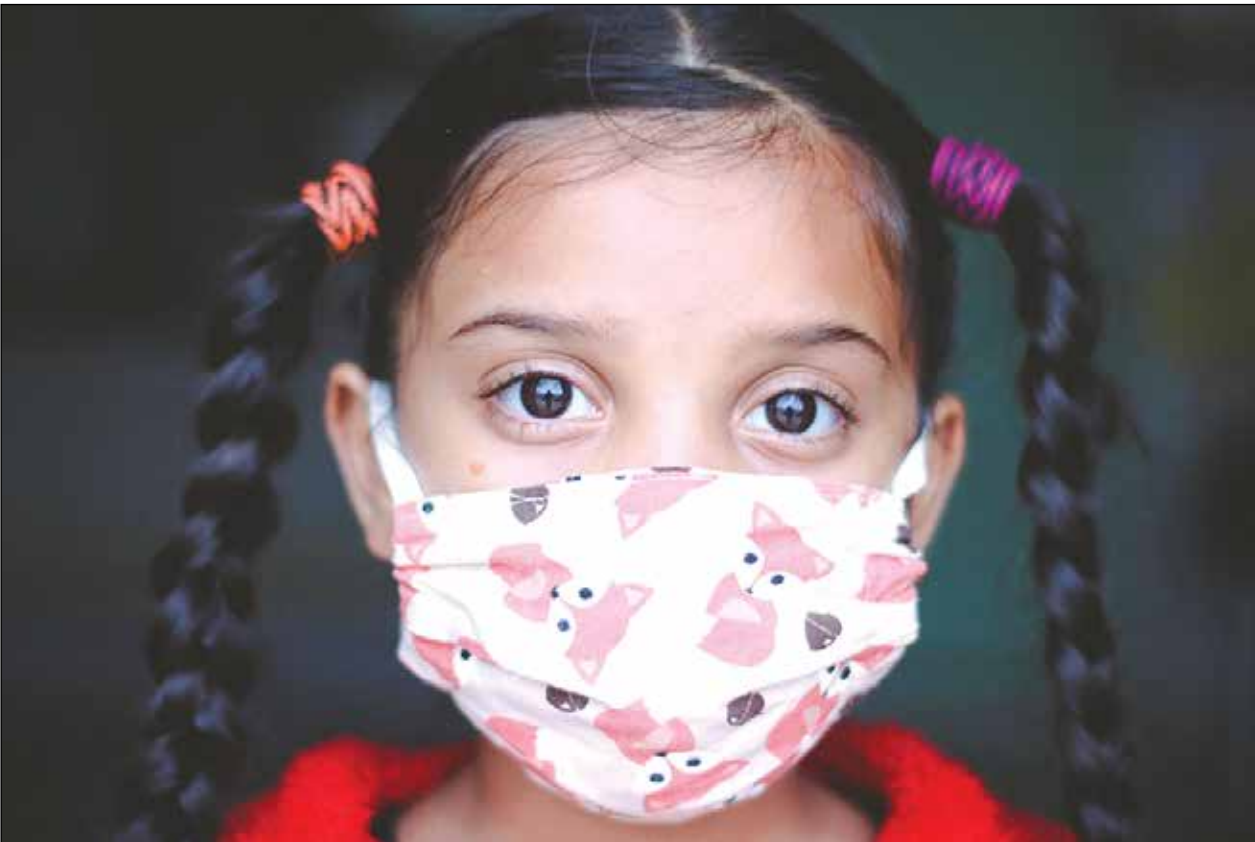
The first statewide mandate was imposed in 2020 and lifted last June.