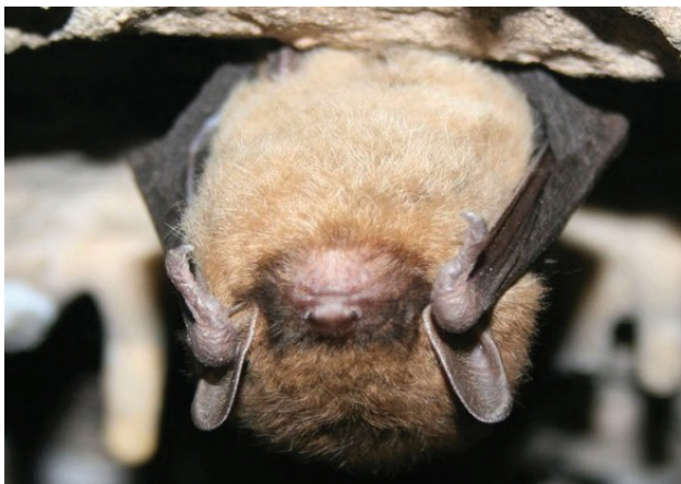
The ‘little brown bat’ is also common to our area. Full grown, its body is about as big as your thumb. This tiny creature can eat up to 1,200 insects, such as mosquitoes, in an hour. ( https://www.doi.gov/blog/9-coolest-bat-species-united-states )

When I turned 16, dad said I could date. My favorite date? A horror movie at the drive in. Back then there were no ‘slice and dice’ flicks. I don’t like them and wouldn’t have then, either. But eerie gothic castles? A count named Dracula? Unwary damsels bitten on the neck and, voila! new vampires! The count had mas- See This ‘n’ That, page 10