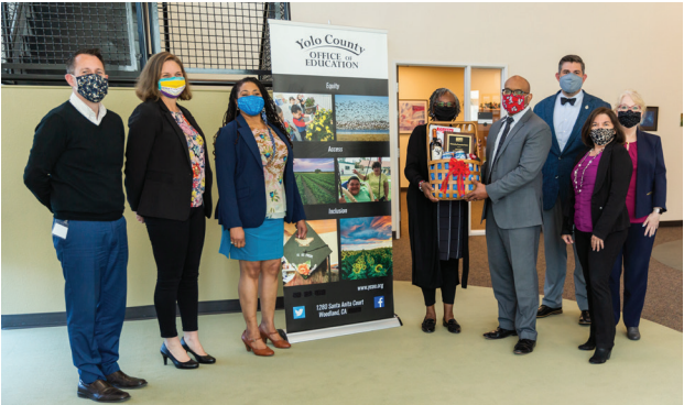
Yolo County Office of Education staff members accept the Outstanding Community Partner award from United Way California Capital Region.