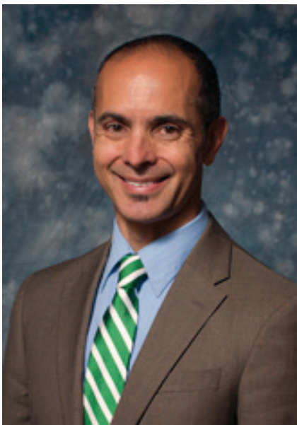
Mayor Christopher Cabaldon