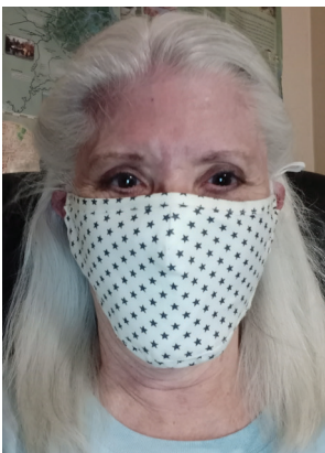
Doing my best to keep it cheerful.

Limited motivation is a symptom of depression. But getting two free aging Bearded Dragons to replace the two that died