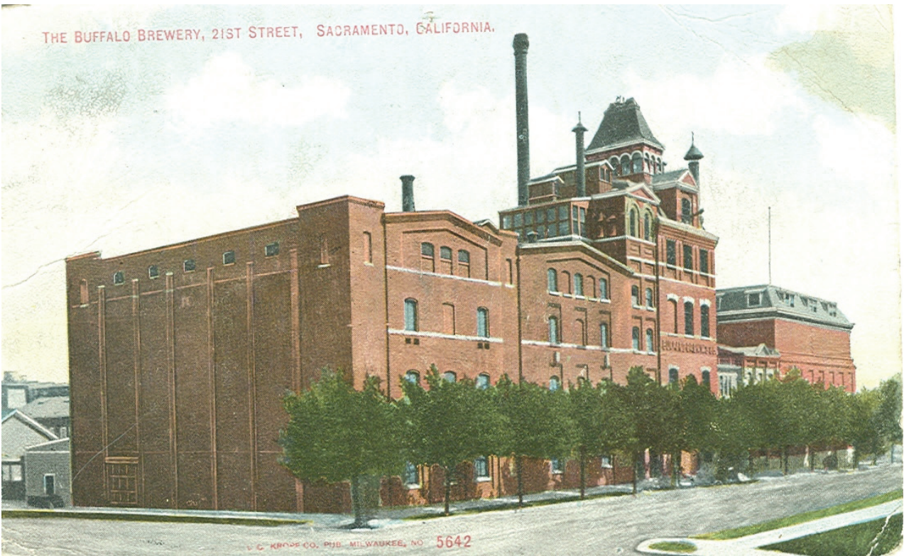
The Buffalo Brewing Company is featured on this 1909 postcard.

Brewery distributed its beer great distances. In addition to shipping this beverage to other states and many parts of Northern California, including San Francisco, the brewery also sent its beer to the Hawaiian Islands, Alaska, Central America, and along the Mediterranean, Russia, Japan and China. A summary about the brewery in an advertisement published in the Feb. 2, 1907 edition of The Sacramento Union includes the following words: “Sacramento boasts of many large manufacturing enterprises, but none are more in keeping with the general progress of this section than (the Buffalo Brewery). It is known by the excellence of its product. New Brew and Bohemian, its special brands, are known throughout the Pacific Coast.” The Buffalo Brewery was also among Sacramento’s major employers.