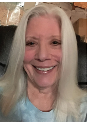
What if the 'new normal' means we'll ALWAYS have to wear a mask? I miss seeing people smile.

shows that I'm hanging in there. 'Where there's life, there's hope,' and I'm alive; the animals are alive; I still see my hummingbird. She's alive. People I love and care about. They're alive. So, for the most part, I'm still happy, plus, I pray a lot, which gives me comfort.