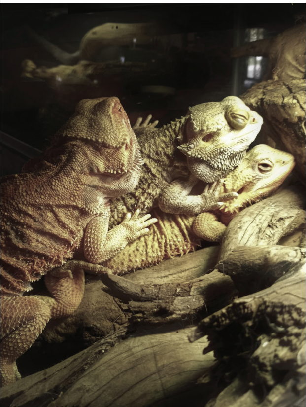
Two additions to the lizard collection make me happy.

Carol Bogart remains an eternal optimist. This too shall pass. But in the meantime, know your Yolo County evacuation zone. Go here to find it: https://www.yolocounty.org/general-government/general-government-departments/office-of-emergency-services/emergency-preparedness-resources/evacuation/-fsiteid-1 . Finally, if you're feeling suicidal, talk to someone or call this hotline: 1-800-273-TALK. On Oct. 8, the county will begin training local volunteers for a Yolo-specific hotline. Comments? Contact Carol at carol@bogartonline.com .