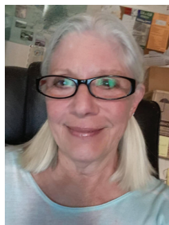
BY CAROL BOGART

Let's see. We've all heard 'trouble comes in threes' and, sure enough! Here's number three!