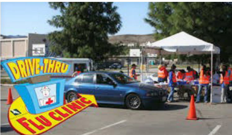
During the H1N1 Flu pandemic in 2009, people were lining up for flu shots at drive-throughs, in schools, and at West Sac’s city hall. Again in 2020, health officials urge everyone to get the flu shot and, if a safe, effective Covid 19 vaccine is approved, that, too. The fear is, without vaccination, hospitals will be overrun with people experiencing serious complications of the virus, the flu, or both, and ICUs will run out of beds.

‘group’ events haven’t prolonged our suffering with this virus? If you want to support law enforcement, write letters to the editors of papers large and small, and write your council, state and federal representatives. Tell them to give police MORE money to: • Add personnel – such as more K9 units • Provide all officers specific training in how to handle a ‘suicide by cop’ • Make PTSD screening mandatory for all officers, new recruits on up • Give paid medical leave for PTSD therapy, especially if an officer’s partner, including K9, dies in action. Most of all, when you see a paramedic, firefighter, health-care worker and, yes , police officer – thank them for their service. Could you do what they do? Could I? No. We couldn’t. Unless we want anarchy in our streets and neighborhoods, stop blaming the police for a criminal’s behavior.