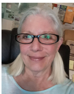
BY CAROL BOGART

So here's the thing about wind. On hot days, I'm grateful for the slightest breeze. When there's a high wind alert (40-60 mph gusts projected), I avoid trees when I walk the dog. Especially when the tree lawn by my complex is littered with already-downed branches of assorted sizes.