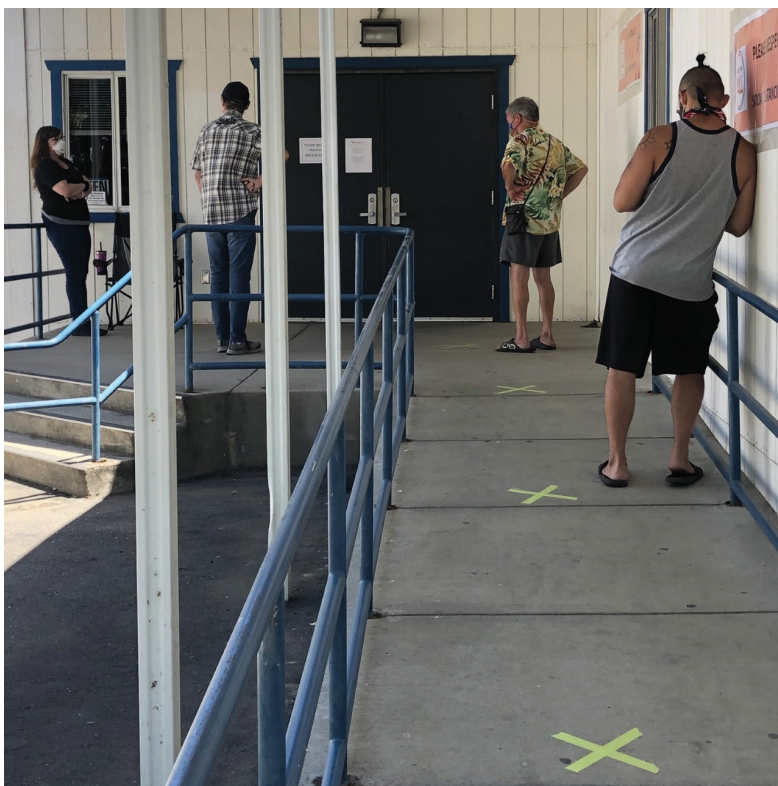
Covid testing in West Sacramento

Residents can also call Yolo 2-1-1 for resource information.