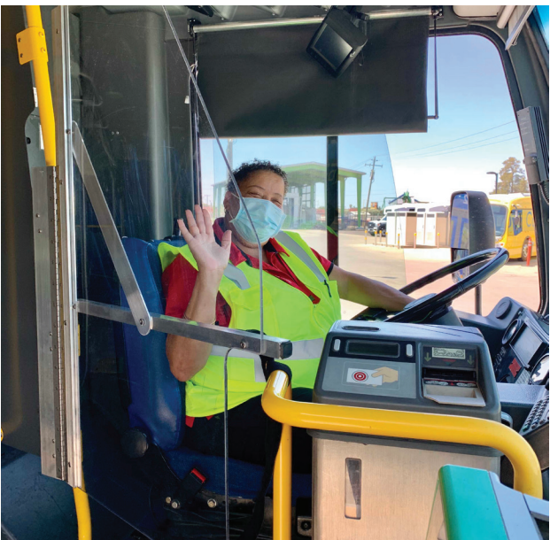
Yolo Bus is taking precautions with mandatory mask wearing.

Friday, July 31 at 10am Do you hear owls at night? Who are they hooting at? Swoop in for a bird's eye look into the incredible world of owls. This interactive program will be broadcast as a Zoom webinar. Registration is required. To register, visit www.tinyurl.com/SantaCruzJuniorRangers . Free event. Event made possible by Friends of Santa Cruz State Parks and California State Parks.