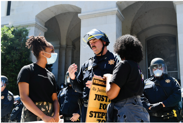
For more photos see Faces and Places, page 3

The State of California announced in a press release today additional activities and businesses that would be able to resume, either statewide or in variance-approved counties, as early as June 12th. Per the new Yolo County Health Order issued May 28, businesses and activities must wait for the County’s Public Health Officer to ‘green light’ activities before they can resume. The County is proceeding through the re-openings with a thoughtful and methodical approach to help maintain low cases of Coronavirus Disease (COVID-19) and ensure continued attestation approval by the State while keeping public health and safety a top priority. Yolo County will be assessing these activities and their supporting state guidance, in collaboration with city partners, and will be providing local updates and releases in the next week in accordance with the State’s June 12 date. For local businesses to reopen, the following must happen first: