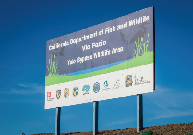
Next time you drive east on Interstate 80, before you cross the Yolo Causeway, be sure to look for the new Vic Fazio Yolo Bypass Wildlife Area sign that was installed on May 22, 2020.

ACOE did the initial planning and design of the wetlands. Ducks Unlimited was contracted for construction. In 1991, the original 3,700 acres was purchased for the California Department of Fish and Wildlife by the Wildlife Conservation Board. In 1995, construction began and in November of 1997, President Bill Clinton dedicated and transferred the management of the land from the Army Corps of Engineers to the California Department of Fish and Wildlife as the Yolo Bypass Wildlife Area. The project was hailed as a national model for meeting the challenge of "trying to improve our economy and lift our standard of living while improving, not diminishing, our environment." Since 1997, two additional units have been purchased which