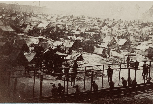
Partial view of Andersonville Prison at Camp Sumter, GA., 1864.