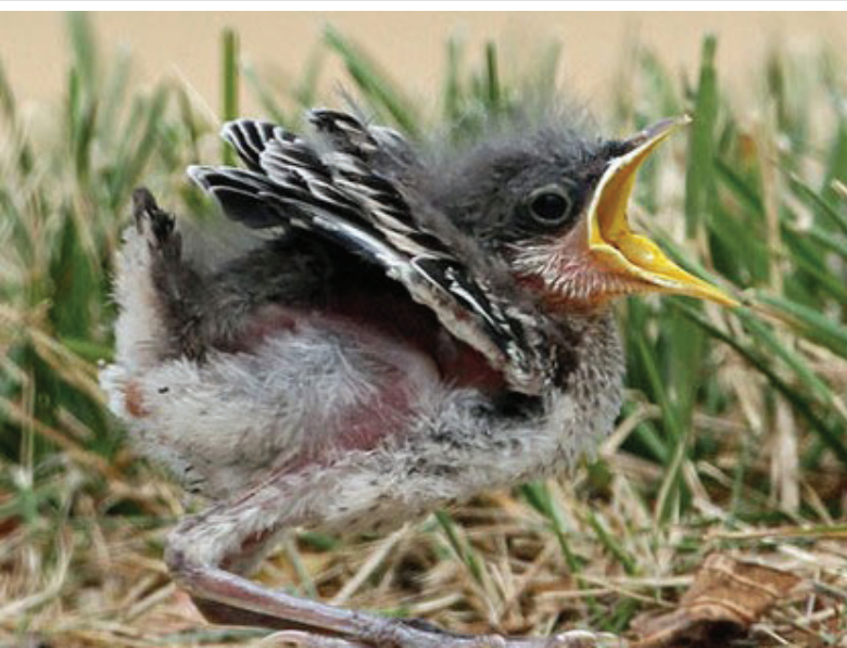
Go to https://www.fws.gov/midwest/news/foundbabybird.html for what to do if you find an infant bird or other baby wildlife.

And the air! Fewer planes flying. Fewer vehicles on the road. The air is measurably cleaner! With emissions down around the world, it will be interesting