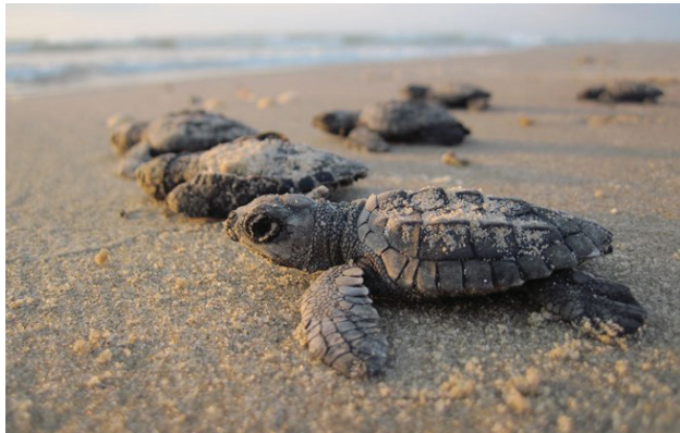
Kemp Ridley sea turtle hatchlings.

Could the finder put it back in the nest? No. No way to reach it. Could she put it close to the nest in hopes the parents still might feed it? No. At-large neighborhood cats or other predators, such as hawks, would likely get it. The suggestion made most often by the commenters: Contact Wildlife Care at McClellan (Wildlife Care Association, 5211 Park Rd., McClellan Park, CA 95652). The finder called and learned that the little bird could be dropped off