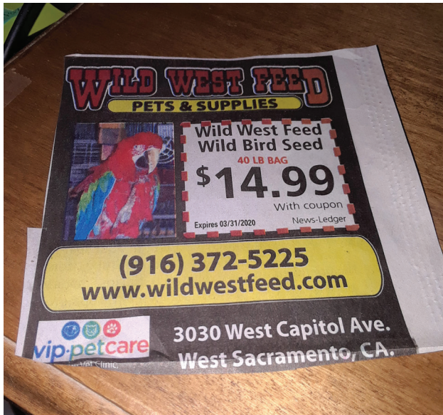
Gus the Macaw is the 'face' of Wild West Feed and figures prominently in its ad.

a better job of blocking virus particles. Cloth face coverings are better than nothing, we're told, and based on something I saw on Chris Cuomo's show, I think it's true. Researchers' experiment showed someone talking – with a cloth face covering and without. Otherwise invisible droplets flying out of the person's mouth showed up fluorescent green. With the cloth face covering, a few did still escape. But without it, the potentially infectious drops were a full on spray.