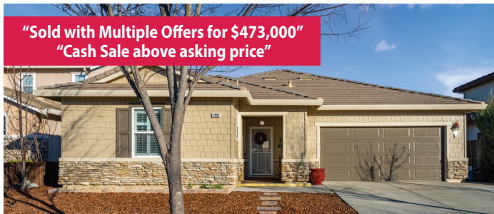
3800 Topaz Road $469,450