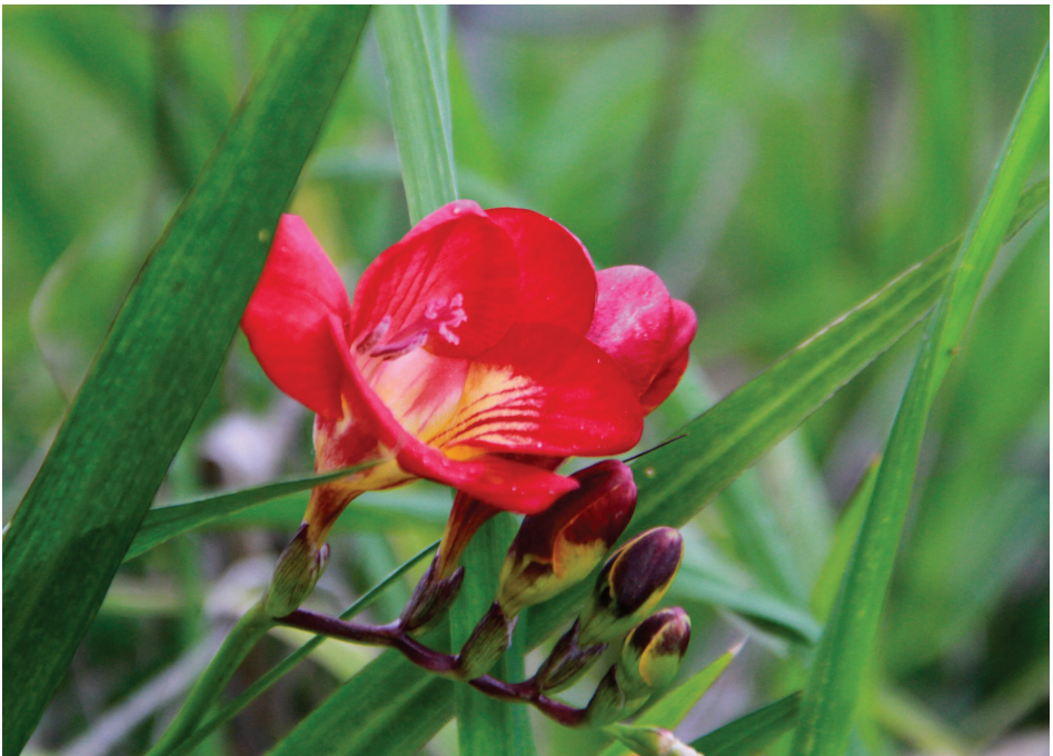
A beautiful flower

She said the requirements are pretty basic – that you be at least 18 years old, appear to have a lived experience of a mental health challenge, or are a caregiver with serious mental illness and be willing to share and participate in the group. “We’re not asking anyone to prove their