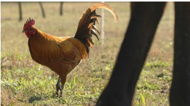
A rooster will happily buddy up with a horse. (Budweiser Clydesdales travel with 'their' rooster.) You can also turn a rooster loose in your yard to eat snails, slugs and bugs. Don't turn your back, though. Roosters can be mean.

copying World War II's Victory Gardens. Reports are, in some areas, you can't find seeds to plant, because seeds are being hoarded, too. This current war – against a potential lethal viral enemy we cannot see – does require us to think ahead as we endure more weeks of isolation. "Lay in enough food for two weeks' of meals," government officials are advising. Of course, if you can afford it, you can also order in. Maaaaaaany restaurants now deliver or at least do takeout. If you're thinking of laying in some backyard hens or a brand new gar-