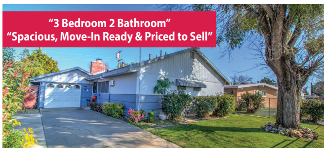
709 Todhunter Avenue $309,900