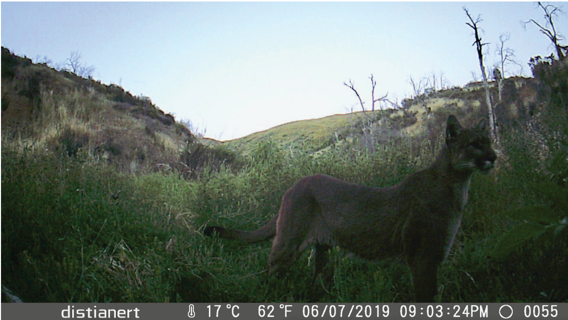
A healthy mountain lion on Tuleyome property, June 2019

Tuleyome, a non-profit conservation organization based in Woodland, purchased the Silver Spur Ranch in 2016, located immediately south of Indian Valley Reservoir along the North Fork of Cache Creek in Lake County. This 1280-acre property is in the heart of the Berryessa Snow Mountain National Monument and is home to oak woodlands, rare plants, and many animals. Mule deer ( Odocoileus hemionus ), California Quail ( Callipepla californica ), egrets ( Ardea alba , Egretta thula ), Great Blue Herons ( Ardea herodias ), and river otters ( Lontra canadensis ) have been seen on the property while mountain lions ( Puma concolor ), bears ( Ursus americanus ), bobcats ( Lynx rufus ), and tule elk ( Cervus canadensis nannodes ) have left evidence. Tuleyome purchased the property with an eye toward opening it up to limited public use including hiking, camping, horseback riding, mountain biking, and naturalist workshops. In June 2018, the Pawnee Fire burned more than 15,000 acres in Lake County, burning from Highway 20 to the west shore of Indian Valley Reservoir. The fire forced many people to evacuate and burned 22 structures. Included in the burned area was Silver Spur Ranch property. Tuleyome, like everyone else, was relieved