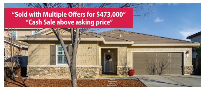
3800 Topaz Road $469,450

Virtual Tours: www.facebook.com/TheJerrettTeam/videos