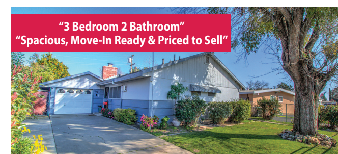
709 Todhunter Avenue $309,900

Virtual Tours: www.facebook.com/TheJerrettTeam/videos