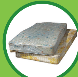
MATTRESSES & BOX SPRINGS

Customers can place three (3) large items (tv, furniture, appliance) and up to 4 cubic yards of bulky items curbside for pickup. Bulky items cannot exceed eight feet in length, four feet in width or weigh more than 150 pounds. Non-Acceptable Bulky Items: household hazardous waste (such as paint, oil and batteries), construction debris, spas, pianos, camper shells, cast iron bathtubs or items requiring more than two persons to safely handle.