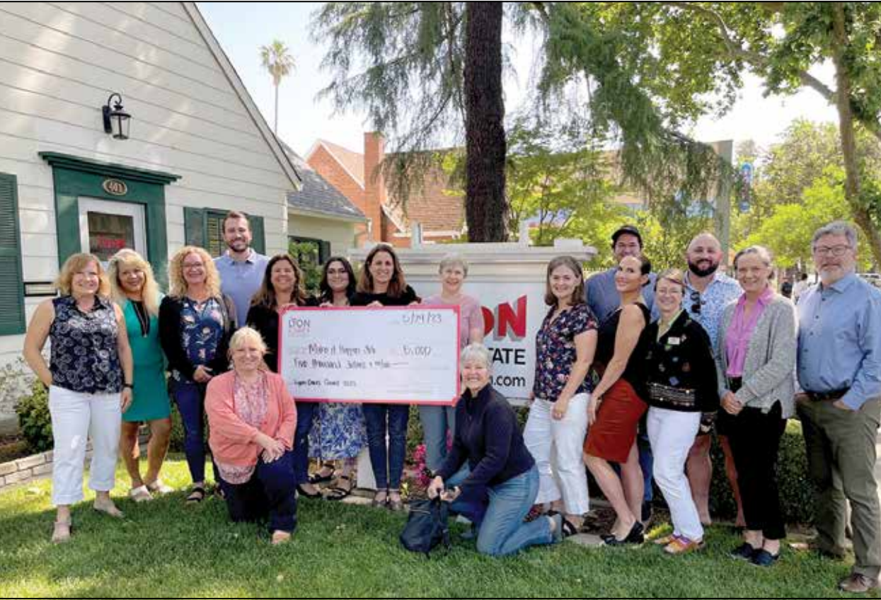
Make It Happen for Yolo County receives a check for $5,000 from Lyon Real Estate of Davis through the Lyon Cares Foundation.