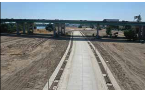
The Riverfront Street Extension will receive a full complement of trees during September.

Continued from page 1 shoulder work, installing landscaping and trees on Riverfront Street, constructing separated bike lanes on 5th Street and installing a concrete barrier. Then it will be the final paving and asphalt, installing signs and adding the striping. The planned schedule for the previously named stages are as follows: US-50 shoulder work – Early September, Installing trees on Riverfront Street – Mid September, Construction of Class IV bicycle lanes and concrete barrier – Mid-September to Early October, Road pavement, install signs and