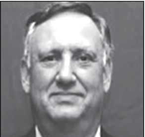
By Dan Walters, CALMatters.org

In some ways, the most interesting — and perhaps most significant — event of the 2023 legislative session’s closing days was a compromise agreement on state oversight of the fast food industry.