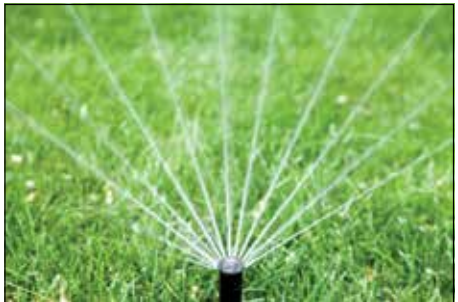
With carefully considered watering schedules, residents and businesses can save money and water, a precious natural resource.

WEST SACRAMENTO, CA (MPG) - In June of 2022, the City Council adopted a permanent watering schedule limited to three days per week. Since that time, residents and businesses have saved more than half a billion gallons of water, compared to 2020 usage. Currently, savings stand at 635 million gallons of water! "Outdoor irrigation can be intimidating and complicated," said Water Conservation Coordinator Ryan Burnett. "With the clarity and simplicity of the watering schedule, residents and businesses have reduced their water use without sacrificing their landscapes." Staff has provided extensive outreach and education on this new requirement. Postcards were sent to every property and targeted outreach was delivered to schools, HOAs, businesses and landscape professionals, in