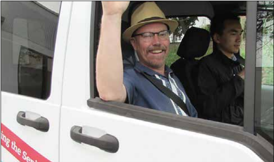
Volunteers heading out on a home meal delivery route.

plug people in where their heart is. "The initial onboarding is done online nowadays, and we meet up with a volunteer and find out what their availability is and what they would like to get out of volunteering." Volunteers are greatly needed at Meals on Wheels in Sacramento, and any adult with a passion to help can get involved. While help for the organization comes through various sources including Community Block Grants, city funding, private donors, and the Agency on Aging (Area 4), volunteers are still very difficult to find at times. Meals on Wheels currently has a waitlist for seniors needing services, and the more volunteers they can train and recruit, the smaller that waitlist gets. Those hoping to get involved can contact Michelle Bustamante at (916) 444-9533 or by emailing mbustamante@mowsac.org