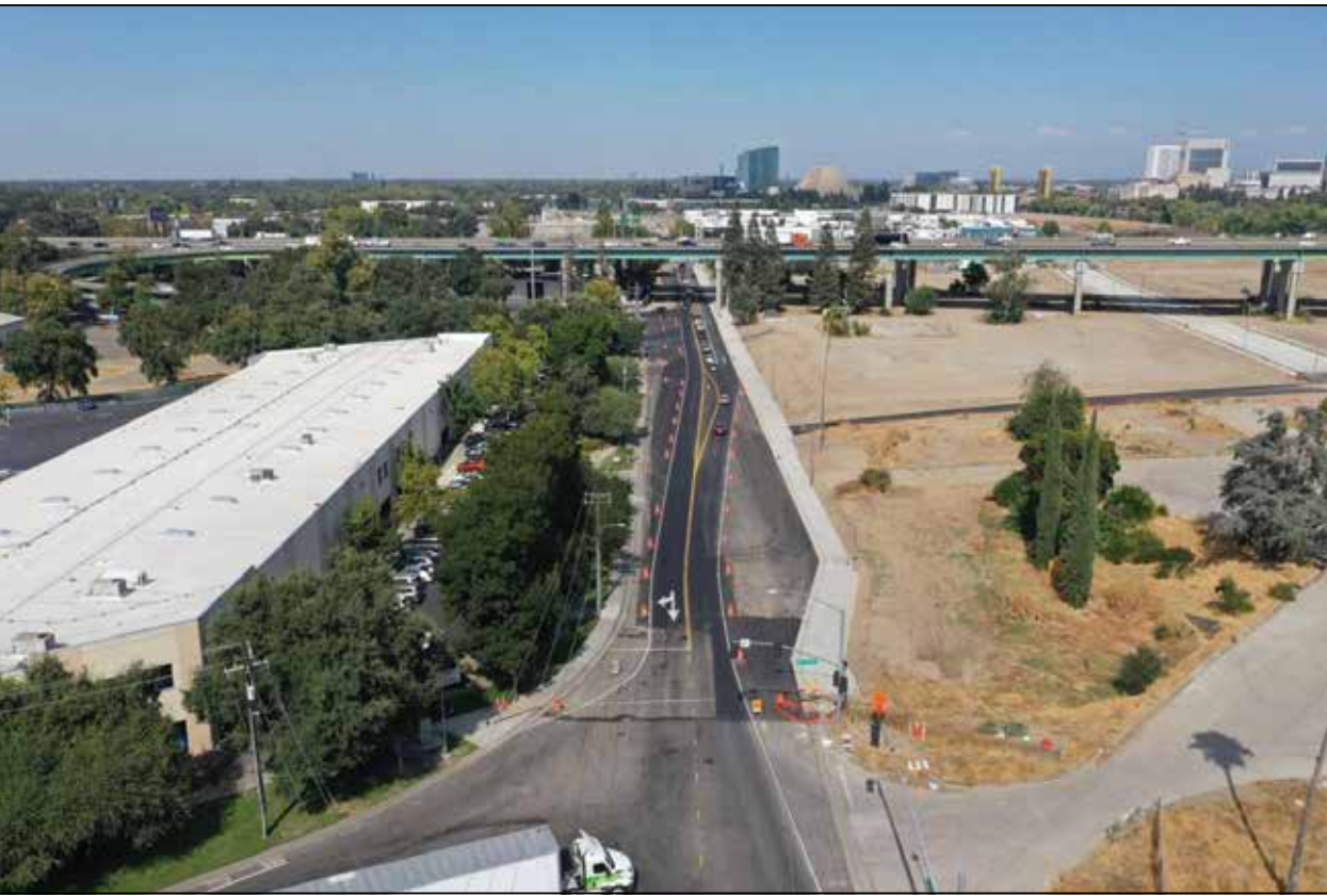
Aerial view of the road work performed on 5th Street in West Sacramento, Calif.