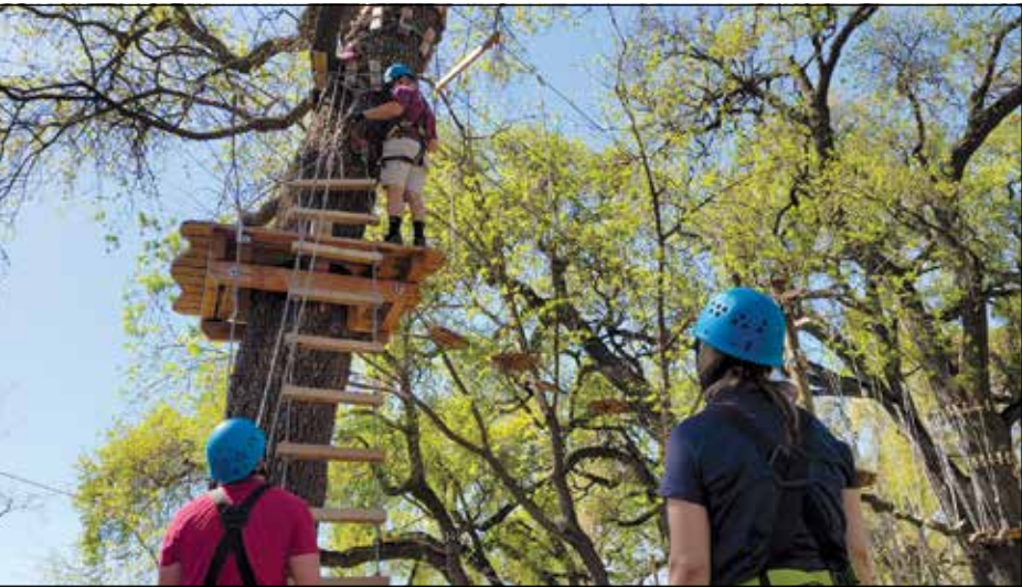
Residents have enjoyed the Tree Top Sac of Heritage Oaks Park ropes course.