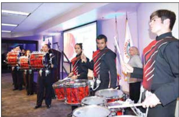
Cordova High School drumline opens the State of the City report at Rancho Cordova City Hall on Wednesday, November 1.