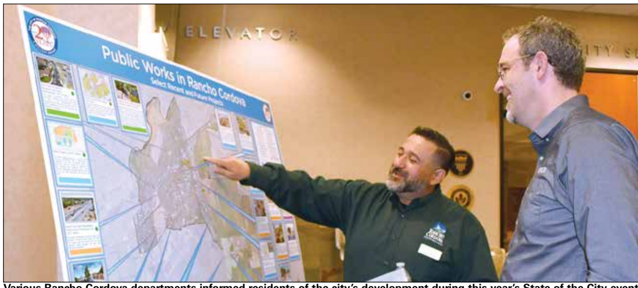
Various Rancho Cordova departments informed residents of the city's development during this year's State of the City event.