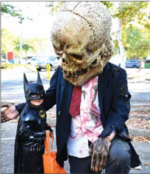
A well-dressed monster with a giant skull poses for a photo with Batman.

CRPD welcomed families to attend this engaging and community-oriented event. Community members attended the event and participated in an assortment of activities including carnival games, an inflatable slide and obstacle course and enjoyed music from Music & More DJ Entertainment. Families were captivated by demonstrations of scientific wonders orchestrated by The Science Wizard. Those brave enough to enter the Zombie Run were tasked with running, jumping and dodging through a zombie-infested obstacle course while hoping to make it to safety. CRPD introduced an unprecedented element of thrill and mystery with