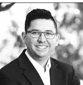
By Assemblyman Josh Hoover

The 2023 legislative session officially came to an end this month as the Governor's deadline to sign or veto bills passed on October 14, 2023. In total, this legislative year saw 1,046 bills land on Governor Newsom's desk and he signed 890 of them into law. Here is a summary of the good, bad, and ugly legislative outcomes in 2023 that will go into law in January: