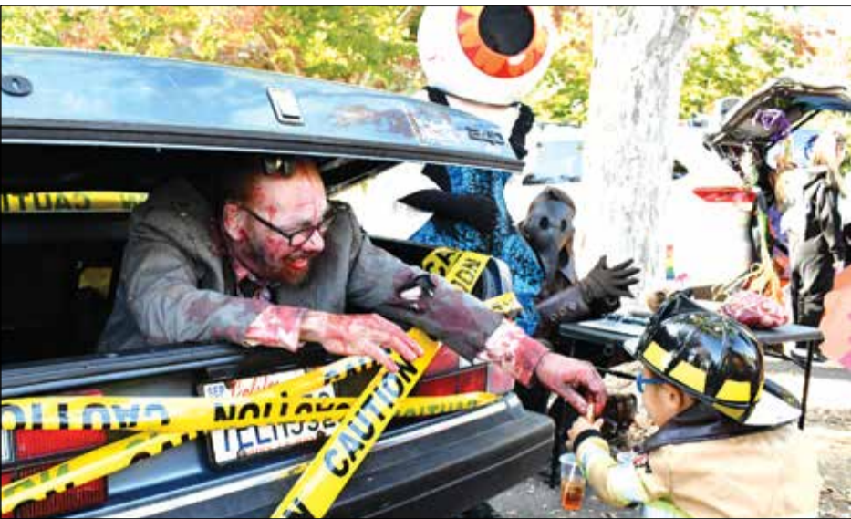
A cadaver in the back of a Volvo greets a little firefighter.