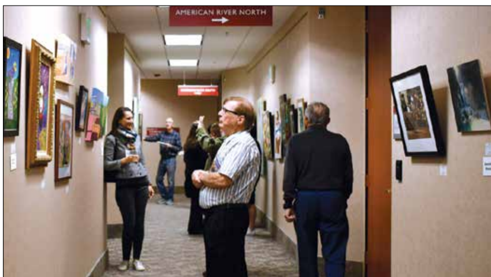
The annual State of the City address at City Hall was preceded by a reception for the Fall Fine Arts Show.