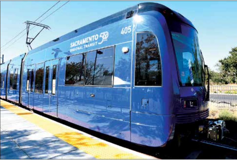
SacRT is testing 17 new low-floor trains built at Siemens Mobility in south Sacramento, modifying station platforms along the Gold Line to meet the height requirements.

For more information on the project and updates on service disruptions, please visit sacrt.com/modernization