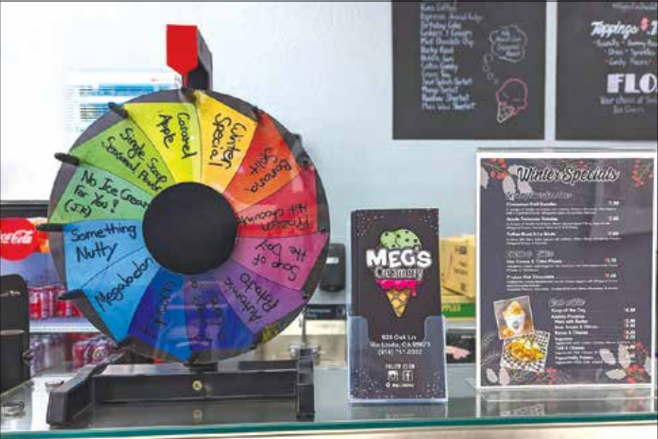
Undecided? Take the wheel for a spin and let fate decide your dessert of choice at Meg’s Creamery.