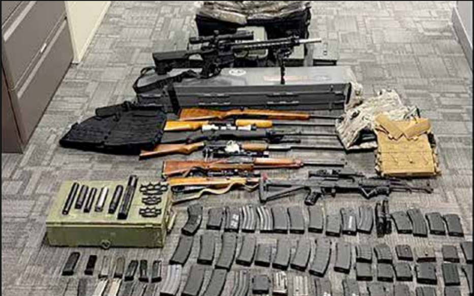
Detectives seized approximately ten rifles, three shotguns, one handgun, over 50 rifle magazines, and over 100 handgun magazines; all items Erik Kennard is legally prohibited from possessing.