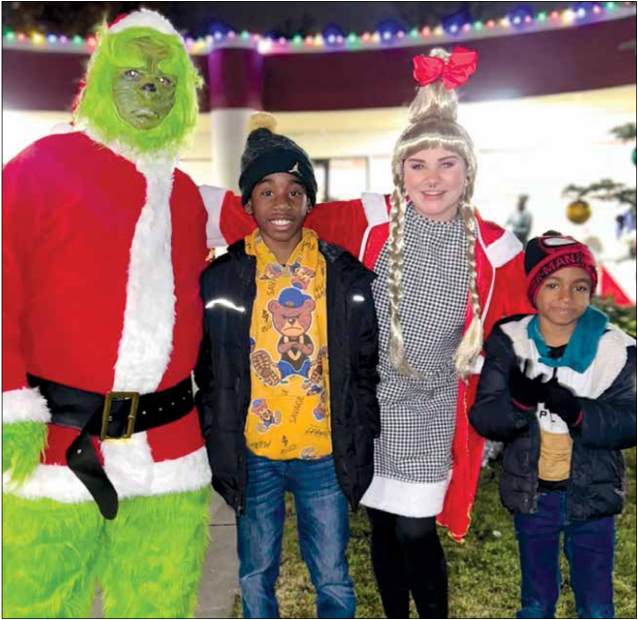
Guests take a picture with the Grinch and Cindy Lou Who at the 2022 North Highlands Park and Recreation District's Holiday Extravaganza and Tree Lighting.