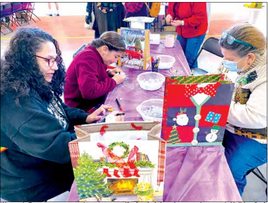
Women's Empowerment graduates create gifts for their loved ones at last year's Holiday Craft Party where they received gifts from the nonprofit's Holiday Gift Drive. Women's Empowerment is now seeking items for its 2023 Holiday Gift Drive.

SACRAMENTO, CA (MPG) - Local residents can provide joy and winter items to Sacramento women and children who have experienced homelessness by contributing to Women's Empowerment's annual Holiday Gift Drive. The nonprofit is seeking winter hats, socks and gloves for all ages from infant to adult, as well as teen gifts, $25 Target and Walmart gift cards, holiday candy, and empty medium and large gift bags. For those who prefer to make a financial donation, the average cost of a gift package is $40, but any amount is helpful. Women's Empowerment especially needs gift cards, gifts for teens, and winter hats for teens and adults. Items are needed at Women's Empowerment, 1590 North A Street in Sacramento, by Dec. 11.