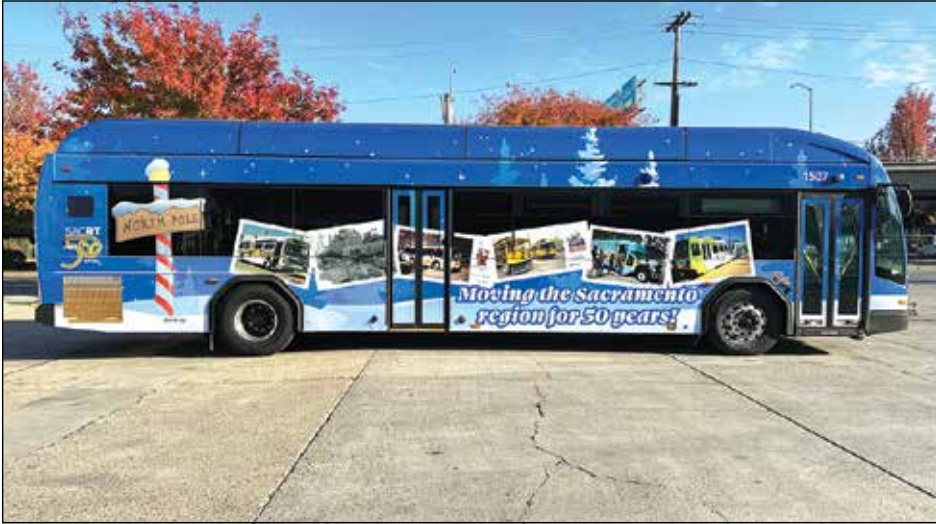
The 2023 Holiday Bus commemorating 50 years of SacRT service.