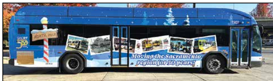
The 2023 Holiday Bus commemorating 50 years of SacRT service.