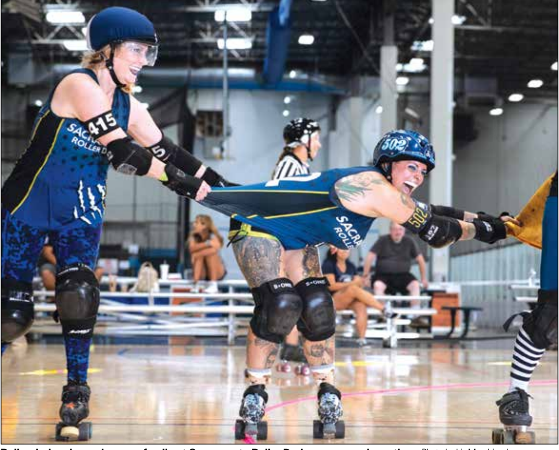
Roller derby players become family at Sacramento Roller Derby games and practices.

"It's been a struggle – Sacramento doesn't have a lot