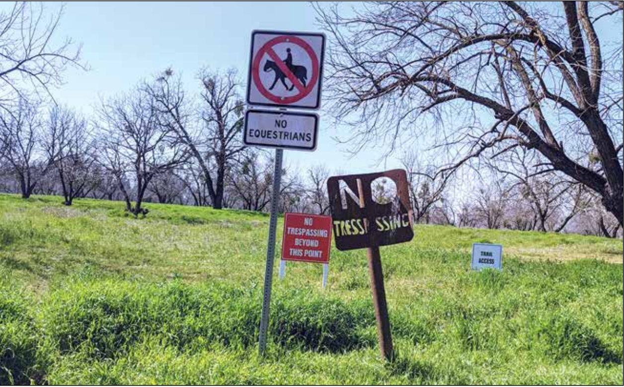
A confusing array of signs on the Kassis property proclaim no equestrians, no trespassing, and also designate the area as trail access.