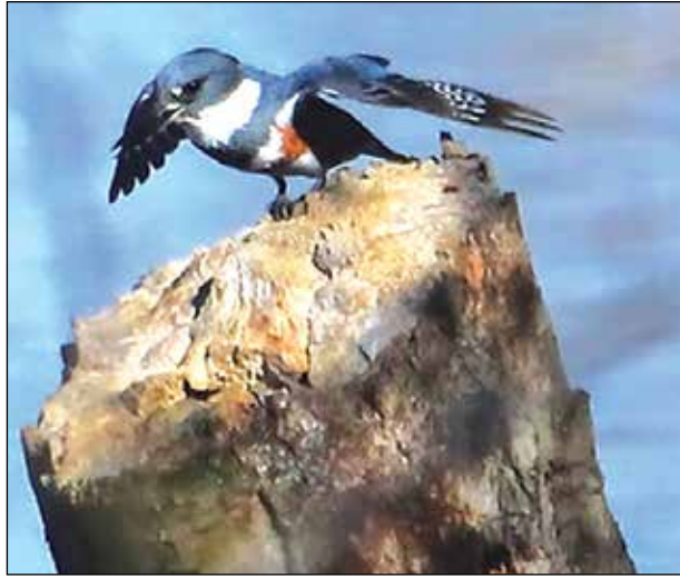
The lower basin provides important habitat for local wildlife along the American River.

- Trumark Homes has spent several years planning the development of the former Kassis property – 41 acres of undeveloped open space along the American River in Rancho Cordova. Their initial application was submitted in April 2019, proposing the development of 245 single-family homes. There was some opposition to the project because the property is beloved by many locals in the area, as public access easements traverse the site, and it provides habitat for