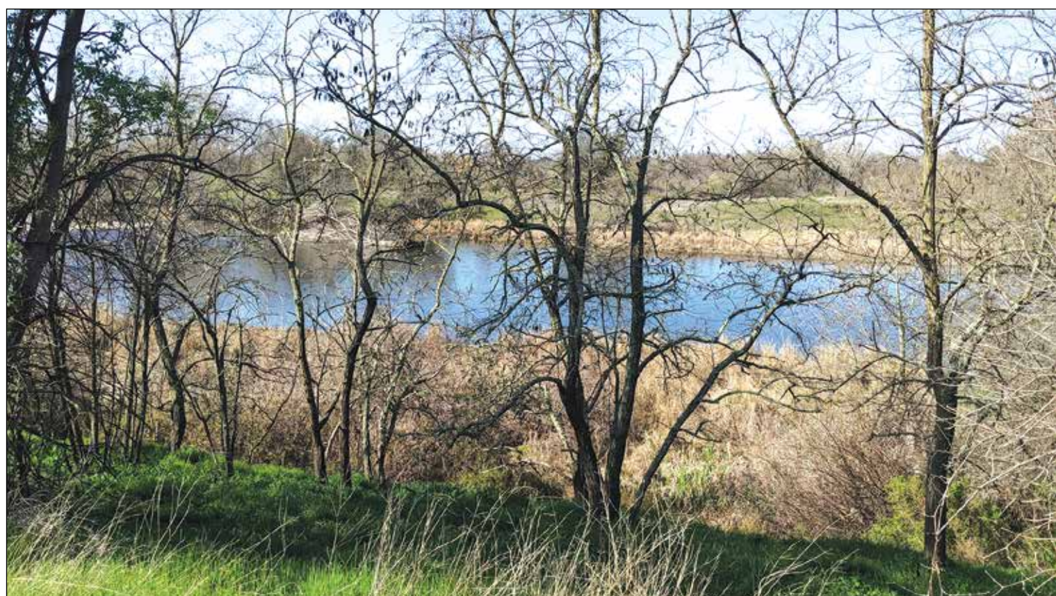
The 20-acre lower basin of the Kassis property is within the 100-year floodplain, and fishermen use the public easements to access the river.

Specifically, and most glaringly, Soluri wrote, “The Project