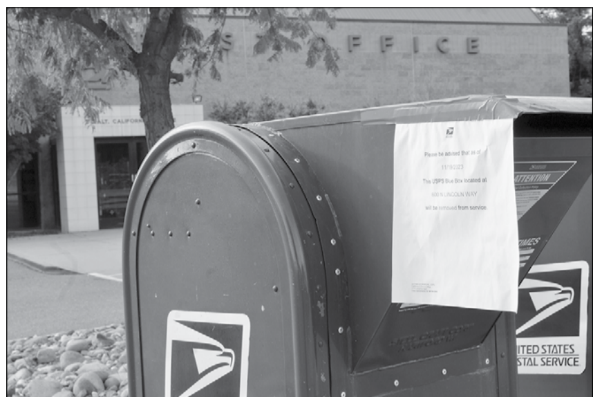
A notice outside the Galt post office explains that one of two drive-up mailboxes will be removed on Nov. 19.