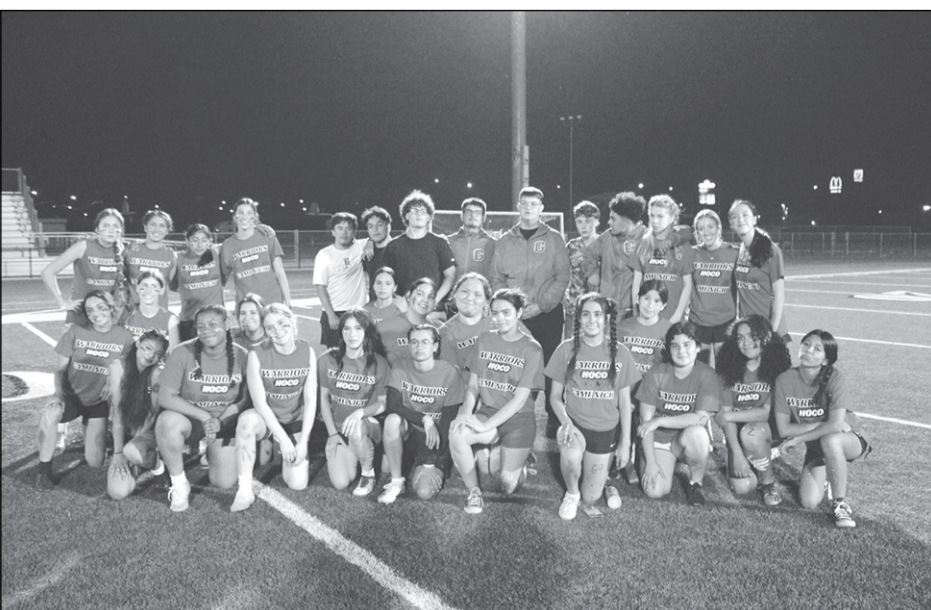
The junior and sophomore combined team with their coaches.

with the freshmen and the juniors combined with the sophomores to make the two teams. In the end, the seniors and freshmen proved dominant and celebrated their win. ★