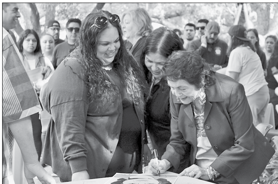
Dolores Huerta signs a poster for Sacramento Latino Book and Family Festival attendees.

U.S. Coast Guard Auxiliary, 6:30 p.m., Galt Police Department, 455 Industrial Drive, 916-687-1512. ★