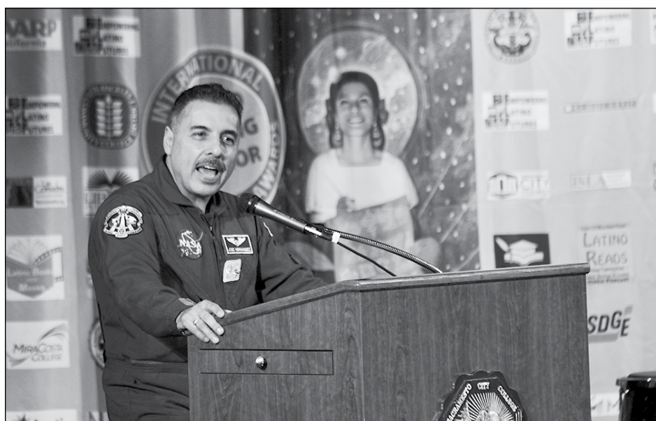
Former astronaut José Hernández urges children to 'dream big' and work hard to realize their dreams.