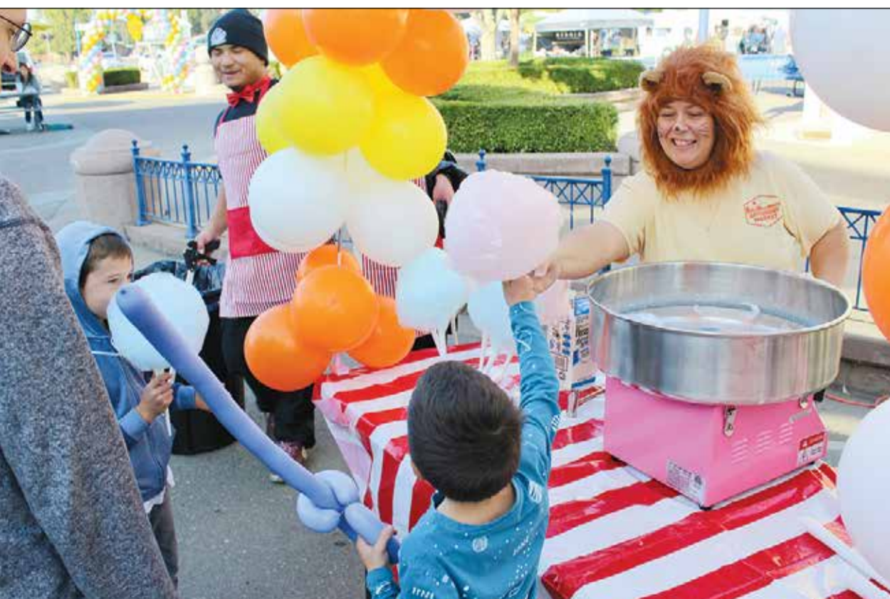
A city employee hands out cotton candy to children attending the Saturday Market on Nov. 4.