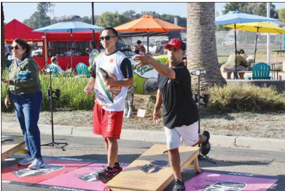
Players compete in a cornhole tournament at the Saturday Market.