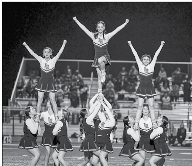
The Varsity cheer squad performs a stunt.