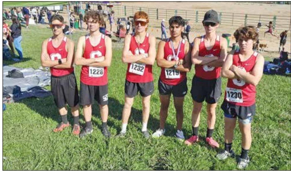
The Galt Cross Country boys are headed to Sections.

The team will be competing in the Section Championships at the Willow Hills Course in Folsom, CA on November 11th, 2023. ★