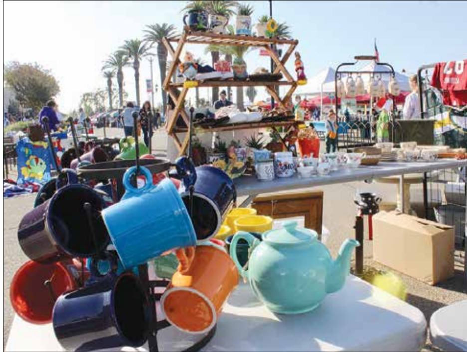
Some of the wares on sale in the antiques section of the Saturday Market.