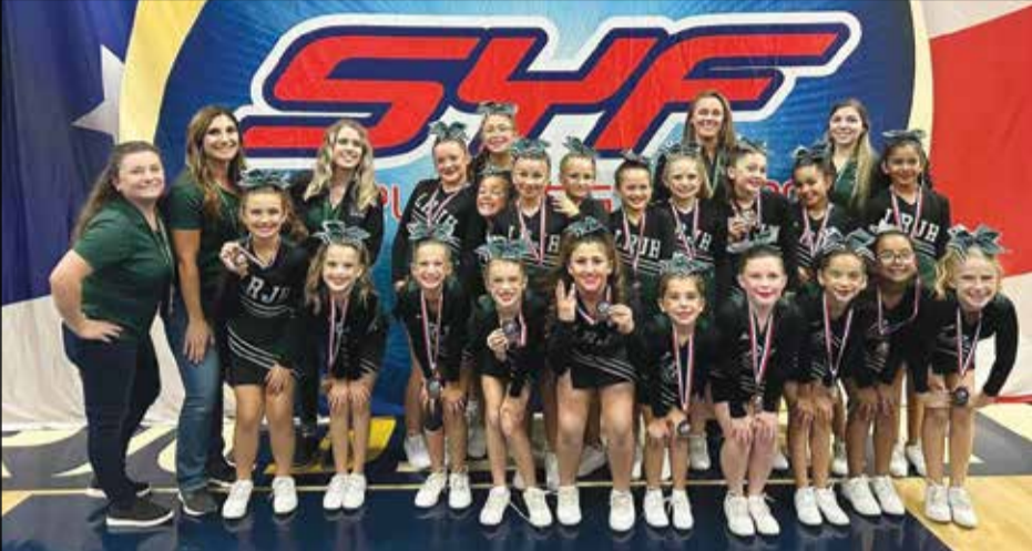
Liberty Ranch Jr Hawk 10U at competition.