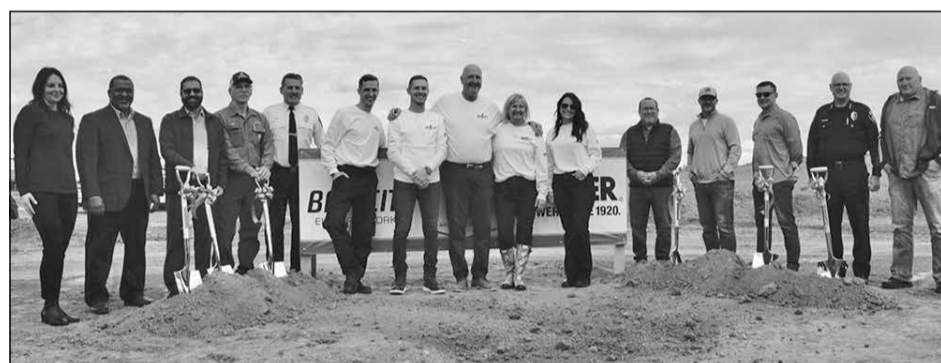
Representatives of Bay City Electric Works, the city of Galt and Cosumnes Fire Department participated in the groundbreaking.

Galt Teen Center is open to teenagers 13-19 years old, on Mondays, Tuesdays and Fridays, 3:30 p.m. to 6 p.m. For more information, visit galtteencenter.org . ★