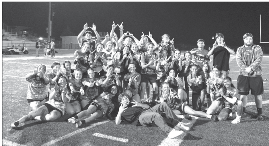
The winning combined team of seniors and freshmen.