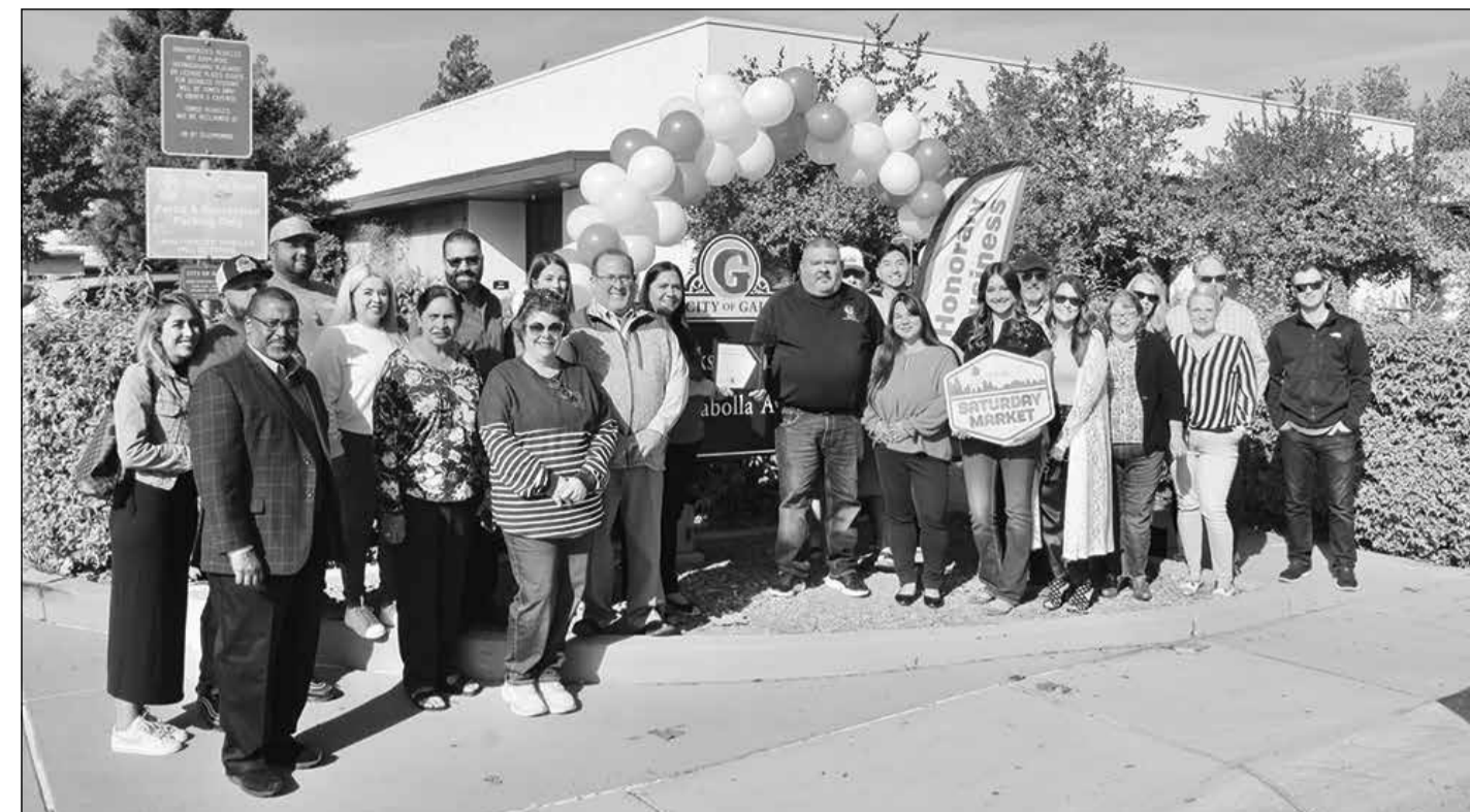
Members of Galt District Chamber of Commerce and of the city of Galt's Parks and Recreation Department gather for a photo on Nov. 2.