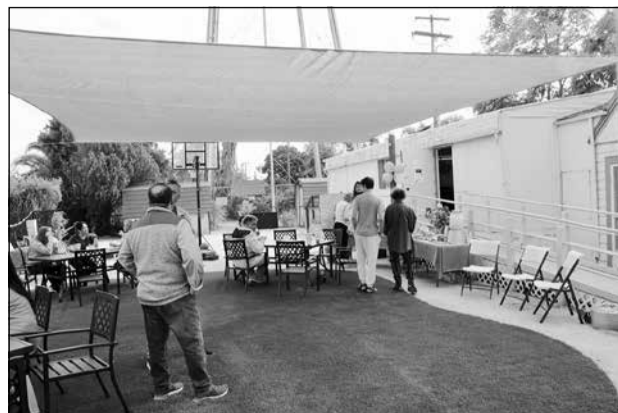
Attendees of Galt Teen Center's open house on Nov. 5 spend time in the renovated patio space.