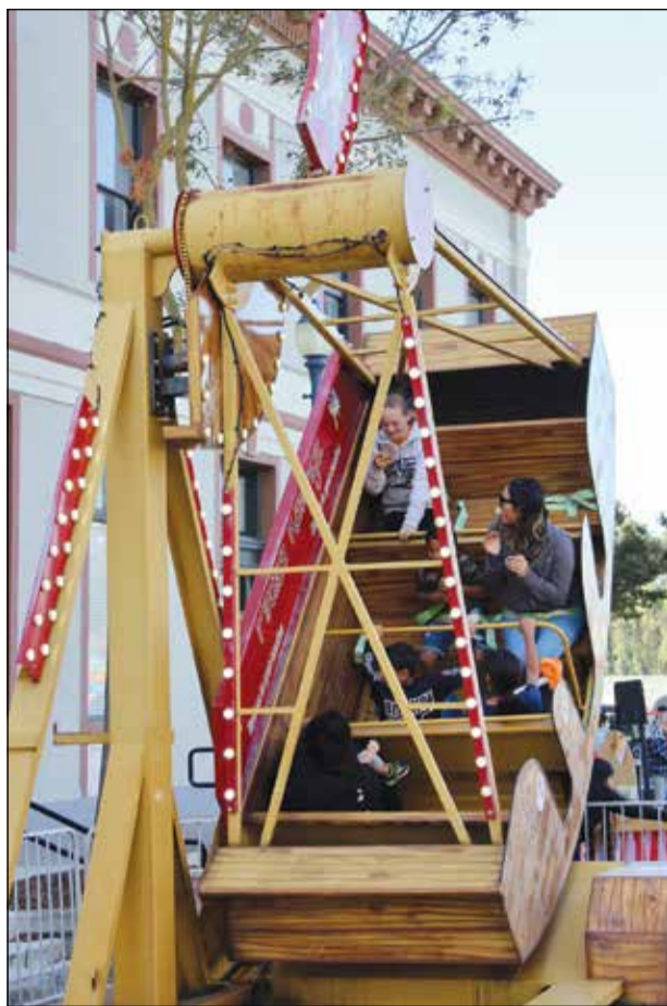
Attractions at the Saturday Market included a pirate ship ride.