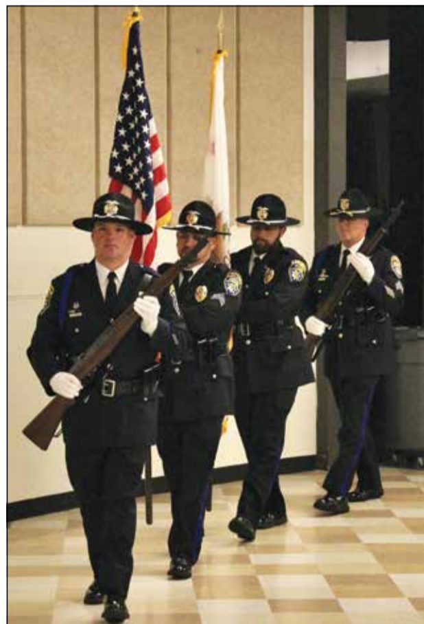
The Galt Police Department honor guard presents the colors.