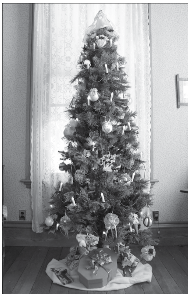
A Christmas tree in the McFarland ranch parlor.

This is only the second time the historical society