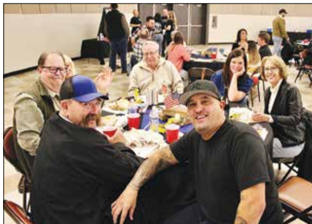
Back the Blue Barbecue enjoy their meal and company.