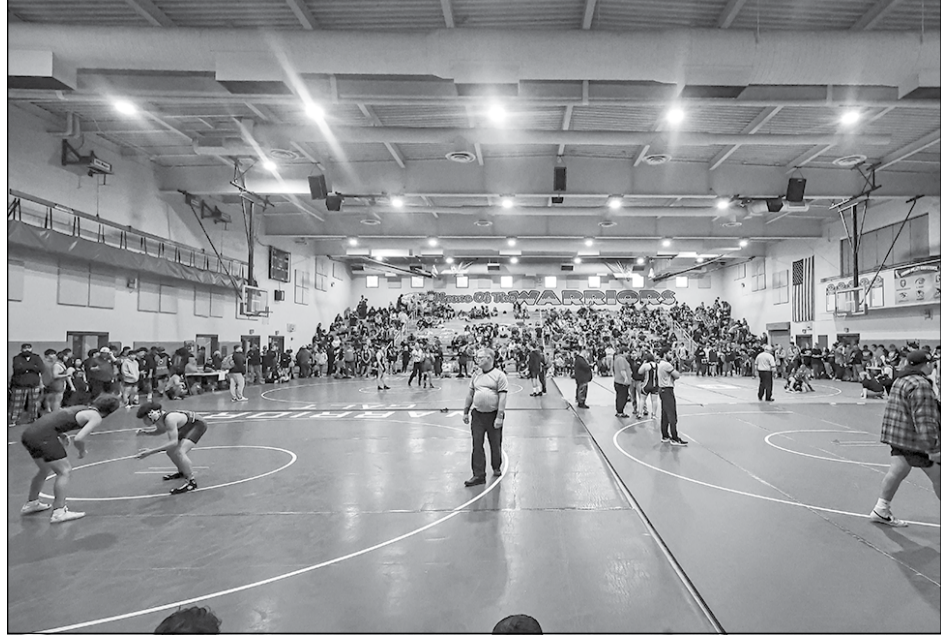
It is standing room only as four wrestling mats fill the Warrior gym floor.