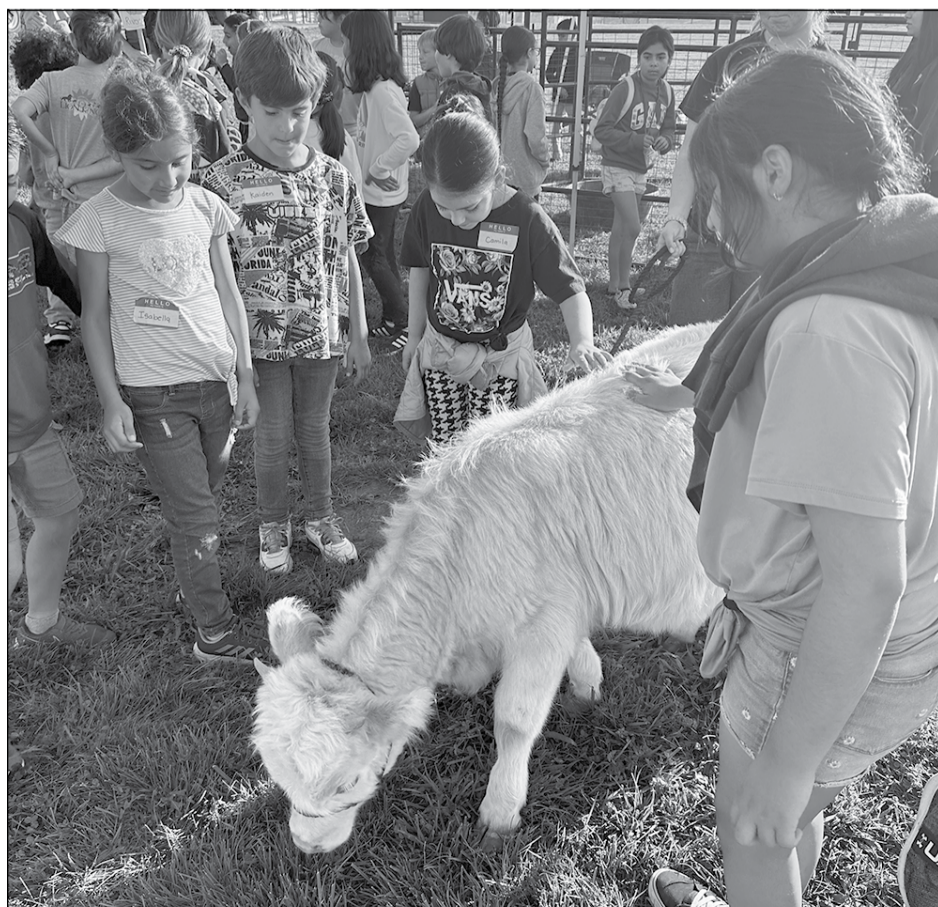
Elementary school students learn about animals at Liberty Ranch's Fall Ag Day.