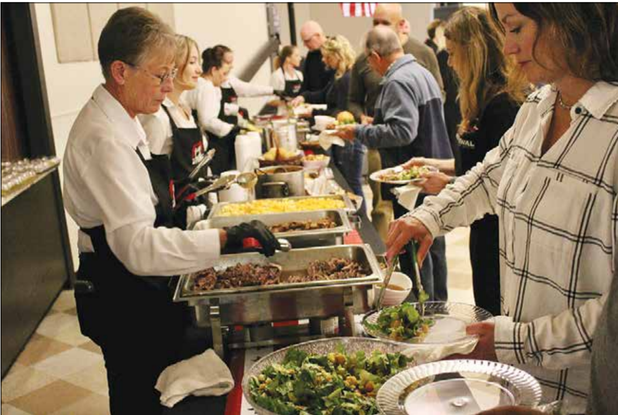
Back the Blue Barbecue guests get their food.