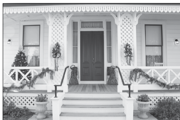
The front porch of McFarland ranch is seen with Christmas decorations in 2021.