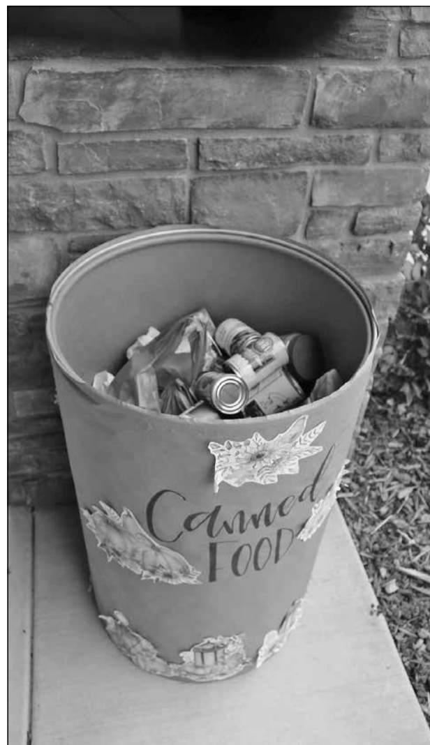
The Fall Festival included a canned-food drive supporting Real Life Church.