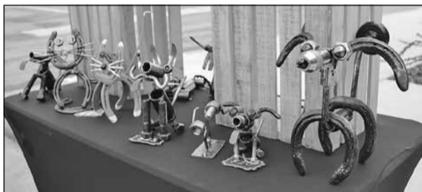
Metal animal sculptures by Donald Castillo.