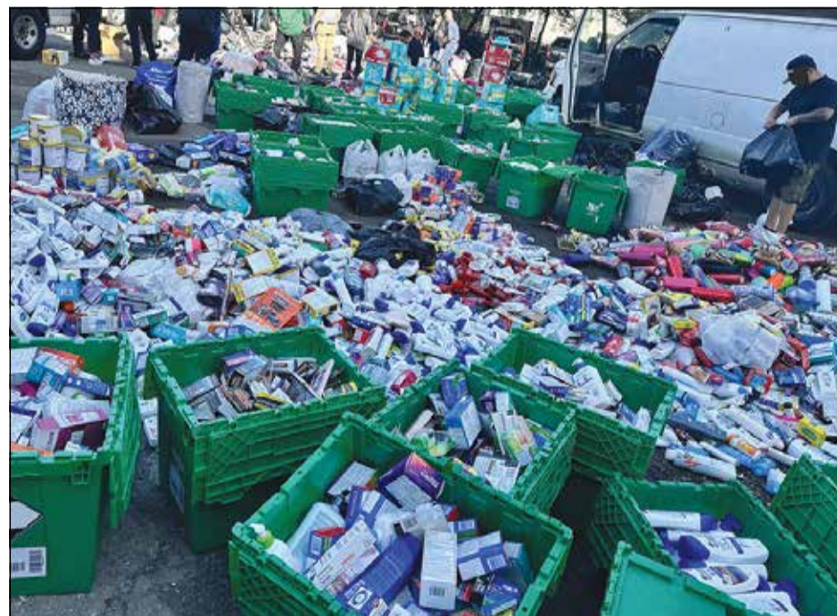
The merchandise found during a CHP search in Oakland. CHP has charged two people in the thefts.

"During the search of the Oakland residence, investigators uncovered stolen retail merchandise and a loaded handgun," the statement read. A second handgun was reportedly found in of several vehicles containing stolen merchandise. Photos of the