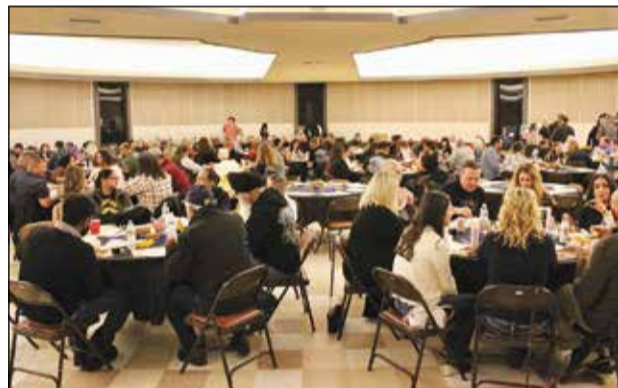
Back the Blue Barbecue attendees dine at the Littleton Community Center.