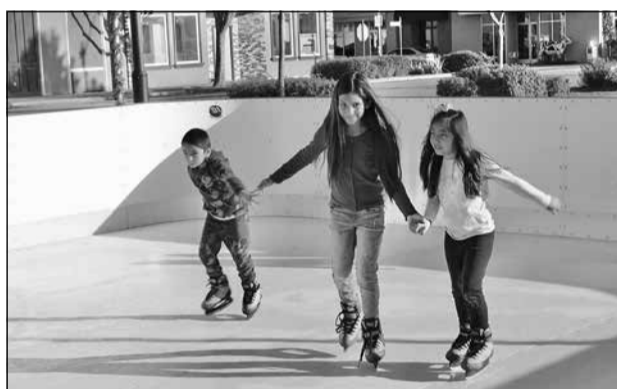
Children enjoy the Fourth Street ice rink on Nov. 26.