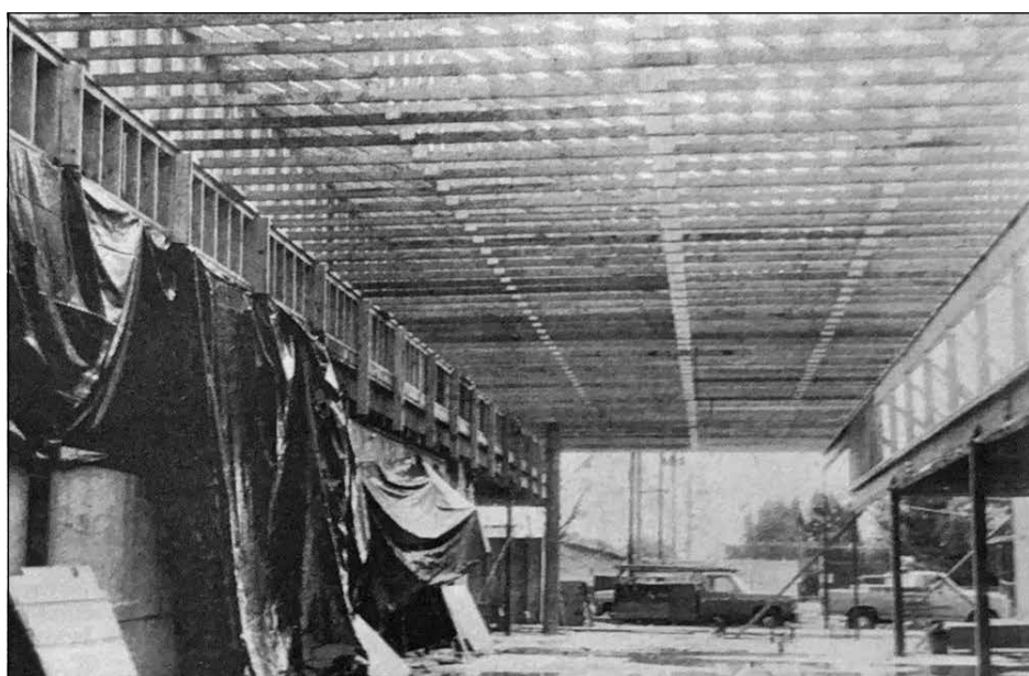
Dec. 1, 1983: Framework has gone up fast at Galt Super Market at 814 A Street. Galt Super is enlarging their store to accommodate their ever-growing business. The walls and roof have not been completed. Tarps prevent leakage into the existing store.