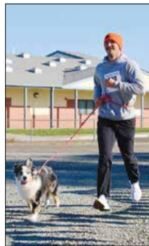
Participants both human and canine got their steps in at the Turkey Trot.