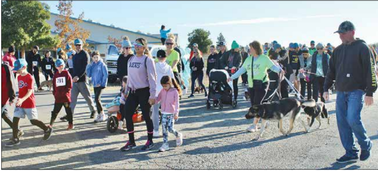
Participants in the Turkey Trot for Teal enjoy the yearly tradition on Nov. 23.

Healing Garden for Cancer Patients in Sight With New Designs