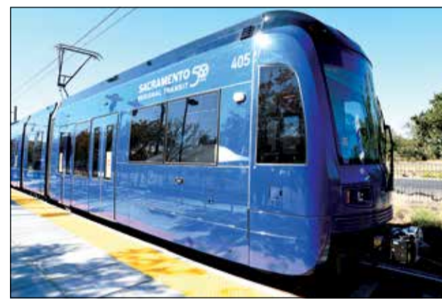
SacRT is testing 17 new low-floor trains built at Siemens Mobility in south Sacramento, modifying station platforms along the Gold Line to meet the height requirements.

SacRT is currently in the testing process for 17 new low-floor trains, which were built at Siemens Mobility in south Sacramento. SacRT has an order of 36 trains with the option to purchase up to