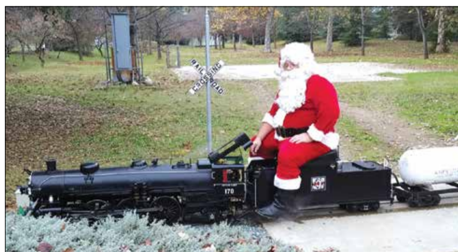
Santa's already on the move for the holiday season and will be in Rancho Cordova's Hagan Community Park offering train rides the weekends of December 2-3 and December 9-10.

For more information on the Season of Doing Good, visit Kings.com/Community . ★