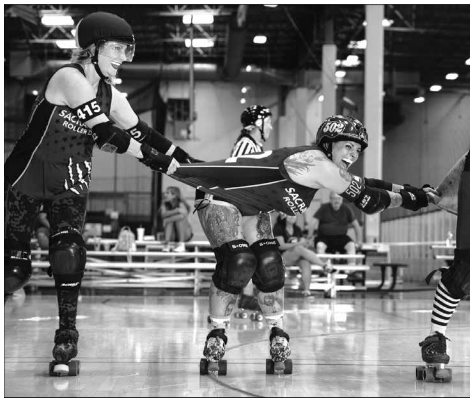
Roller derby players become family at Sacramento Roller Derby games and practices.