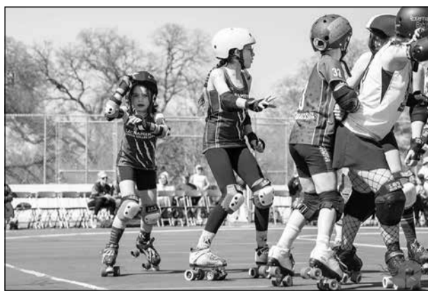
Sacramento Roller Derby's junior program begins at age 8.

small gift – the donor, who wishes to remain anonymous, gifted the group up to $2 million to build their facility. The excitement and relief of finding a permanent home was evident from both women.