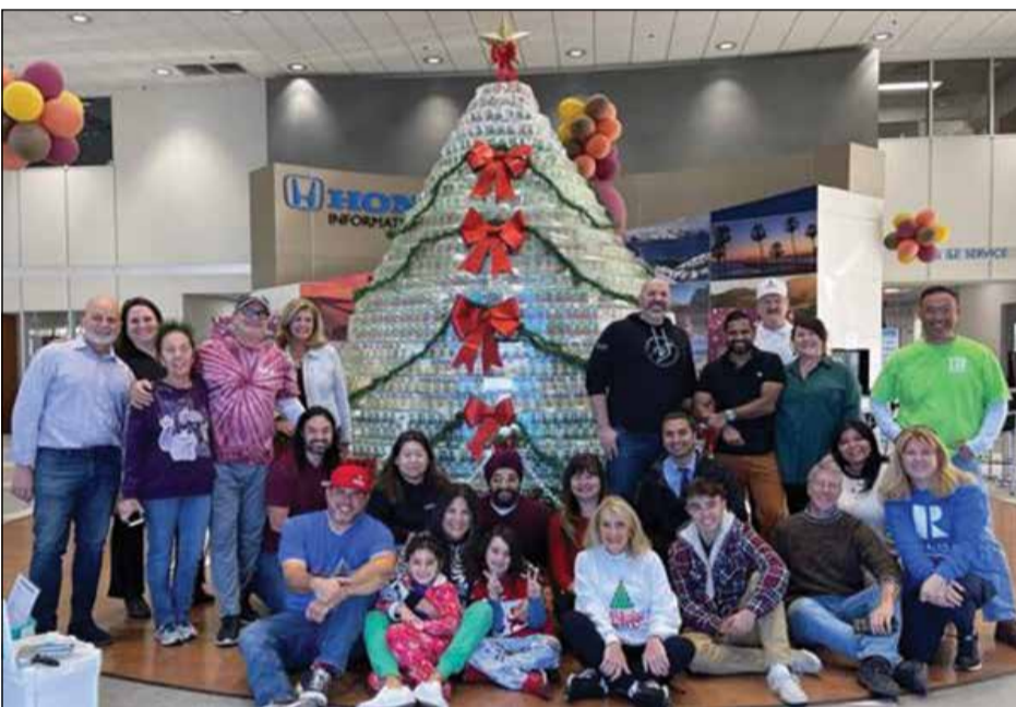
2022 CanTree Build at Capital City Honda.

Consolidated Communications Holdings, Inc. (NASDAQ: CNSL) is dedicated to moving people, businesses and communities forward by delivering the most reliable fiber communications solutions. Consumers, businesses and wireless and wireline carriers depend on Consolidated for a wide range of high-speed internet, data, phone, security, cloud and wholesale carrier solutions. With a network spanning more than 57,500 fiber route miles, Consolidated is a top 10 U.S. fiber provider, turning technology into solutions that are backed by exceptional customer support. Learn more at consolidated.com. Connect with us on social media. ★