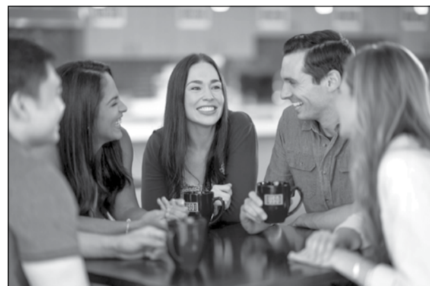
USO Coffee Connections provide monthly gatherings for military spouses.

Support for new parents: Military parents are often away from family and friends during their pregnancies and first months as new parents. USO Special Delivery presented by Johnson's are baby showers that provide a touch of home. They allow expectant parents and military spouses to connect and bond, and 72% of participants this year have stated in feedback surveys that this is the only baby shower they will