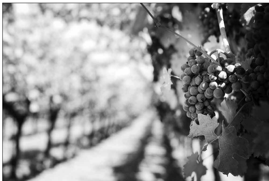
Wine grapes were once again the leading cash crop in Sacramento County.