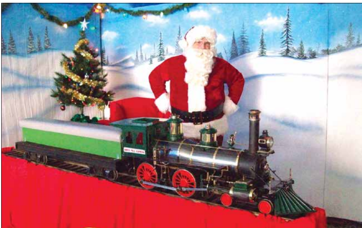
Bring the kids via SVLSRM's Santa Train to visit the Old Man Claus at Hagan Community Park in Rancho Cordova.