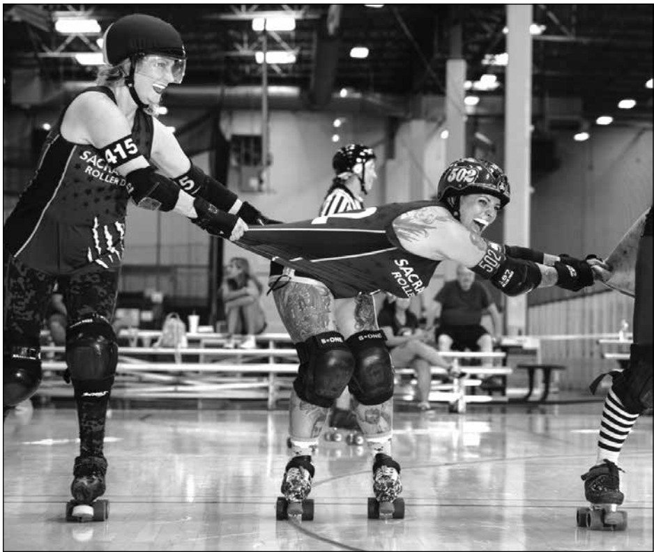
Roller derby players become family at Sacramento Roller Derby games and practices.