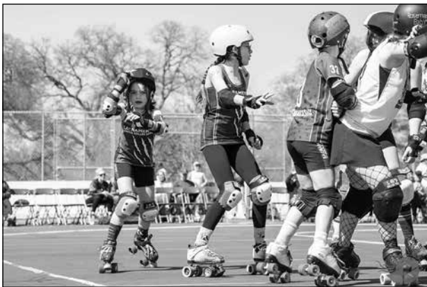
Sacramento Roller Derby’s junior program begins at age 8.

small gift – the donor, who wishes to remain anonymous, gifted the group up to $2 million to build their facility. The excitement and relief of finding a permanent home was evident from both women.