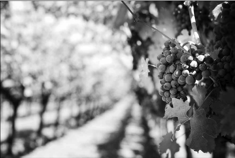
Wine grapes were once again the leading cash crop in Sacramento County.