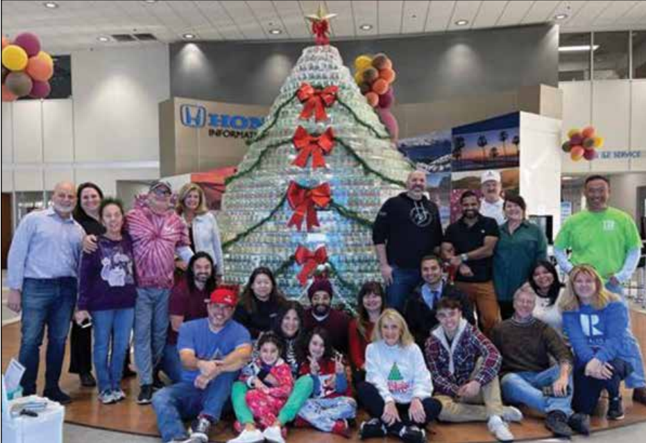
2022 CanTree Build at Capital City Honda.

1908 with about 50 original Members. The trademarked term "REALTOR®" is exclusive to real estate agents who are Members of a REALTOR® Association and identifies their professionalism and adherence to a business Code of Ethics. ★