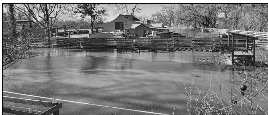
January flood waters caused millions of dollars in damage to area ag producers.