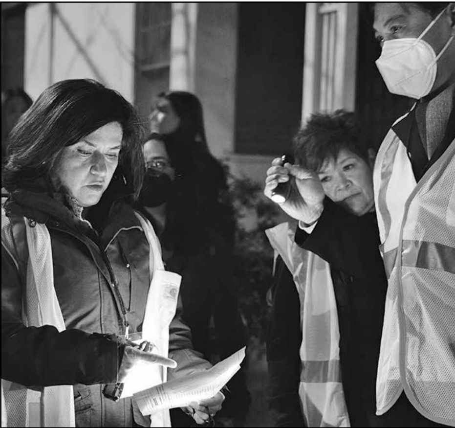
Canvassers for the 2022 Point-in-Time Count have a discussion.