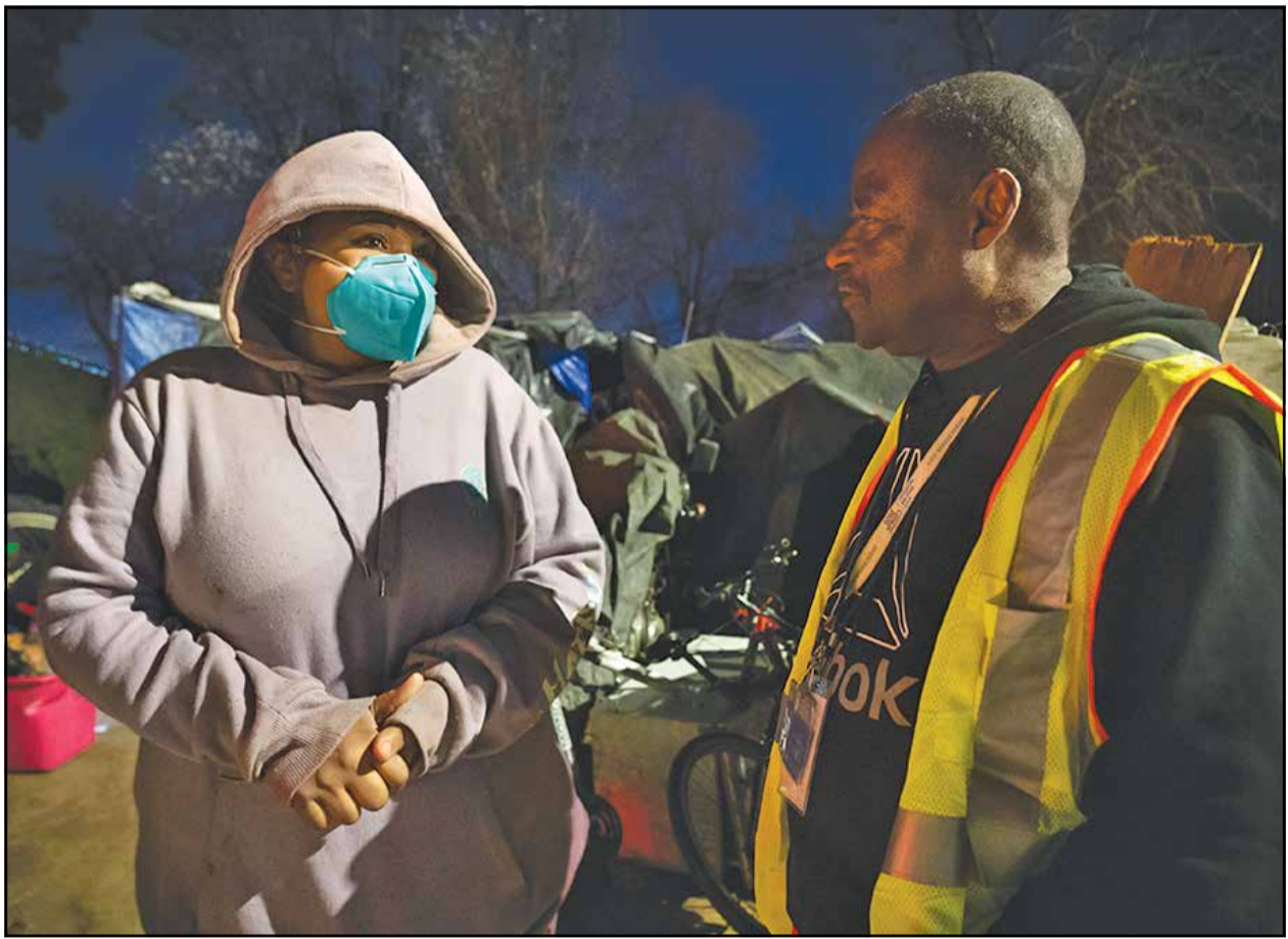
A Point-in-Time Count canvasser speaks with a person experiencing homelessness in February 2022.