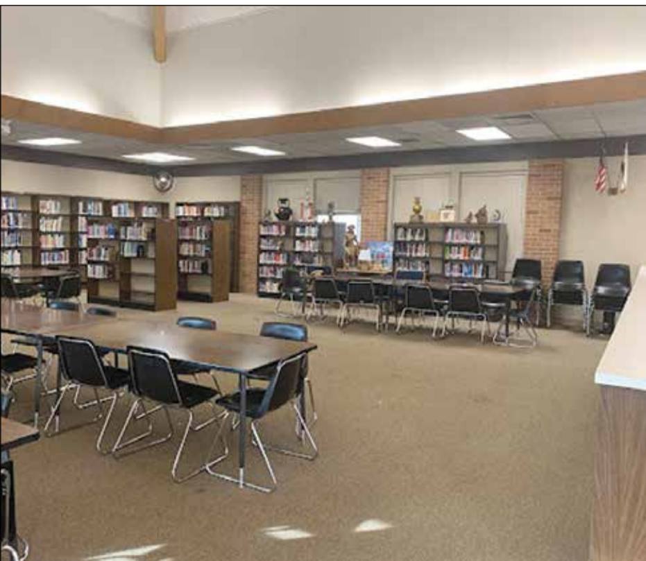
The Galt High School library.

Continued from Page 1 be refurbished to better adapt to a modern learning environment.