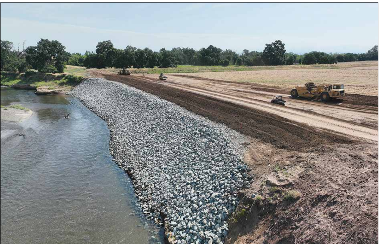
Reclamation District 800 remains $75 million in the hole after the January 2023 storms even though it has already been reimbursed for this levee repair at the end of Fig Road in Wilton. The board received the financial update at their Dec. 21 meeting.

Cosumnes River Levee District to Get Help From Feds, State