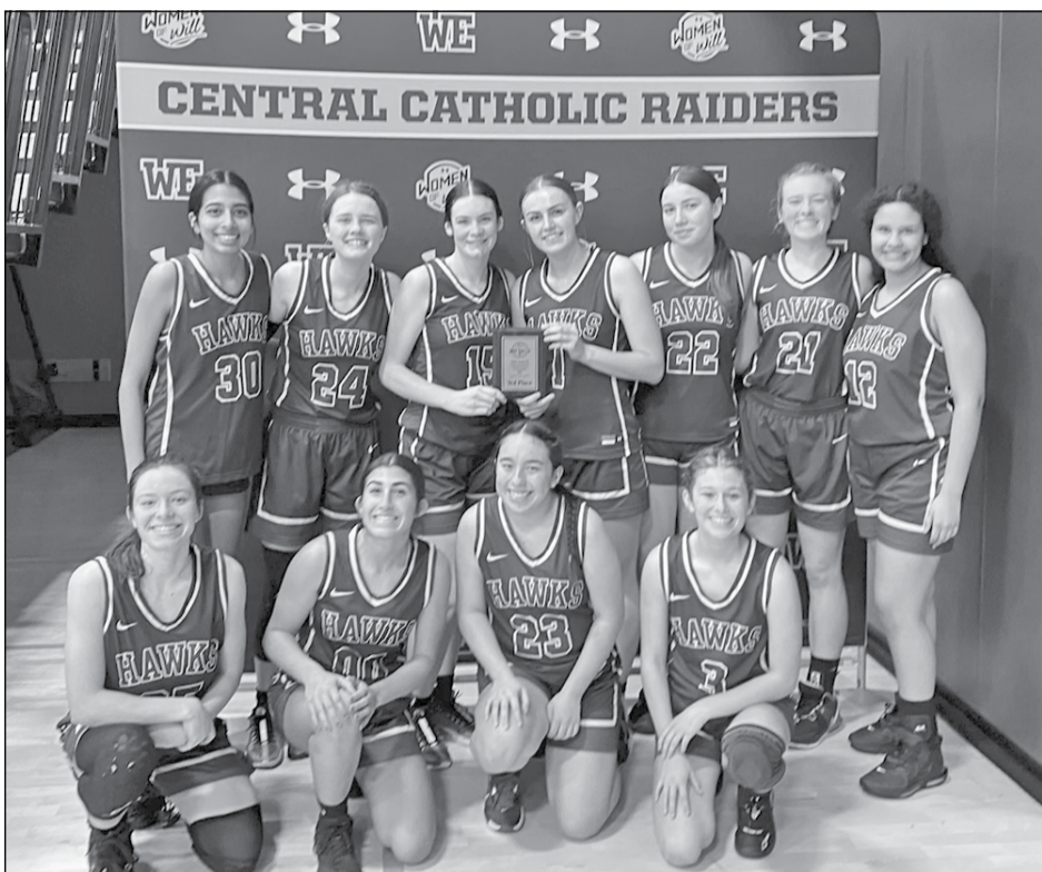
Liberty Ranch basketball players at the Central Catholic tournament.

The Hawks will host cross-town rivals Galt High on Thursday. ★