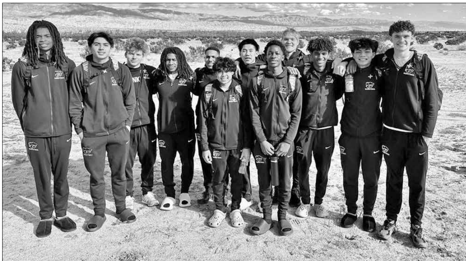
Franklin's boys basketball team took this photo while in the High Desert near Rancho Mirage where they placed second in a tournament during the holidays. The Wildcats have one of the best won-loss records in the Elk Grove-area at 15-2.

Delta League Cos. Oaks vs. St. Fran., 6:30 p.m. Plea. Grove vs. Franklin, 6:30 p.m. Davis vs. Elk Grove, 6:30 p.m. Gr. Sacramento League Johnson vs. Valley, 6 p.m. Metro Conference Mont. Trail vs. Grant, 7 p.m.