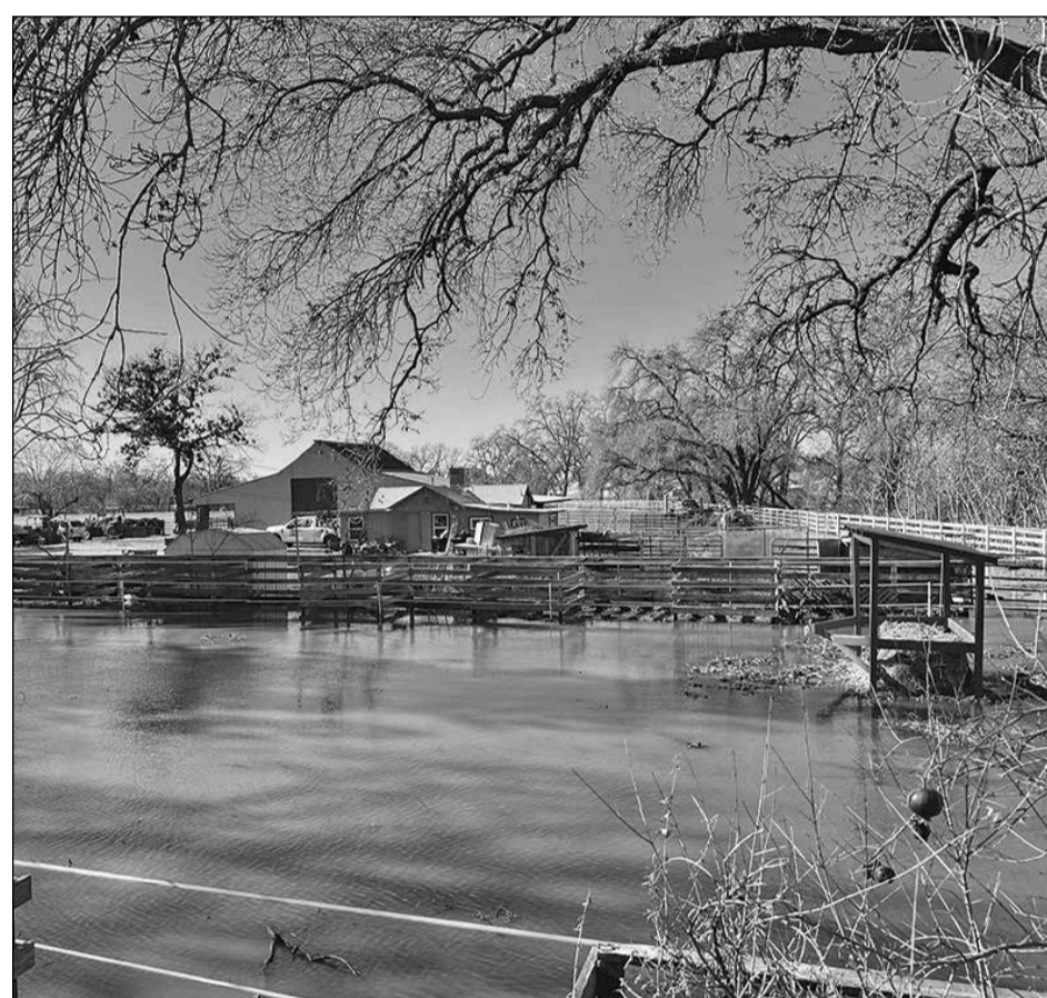
January flood waters caused millions of dollars in damage to area ag producers.

11:36 p.m., 4700 block of Elliot Ranch Road: Elk Grove police arrested Austin Marsh, 28, on battery charges. ★