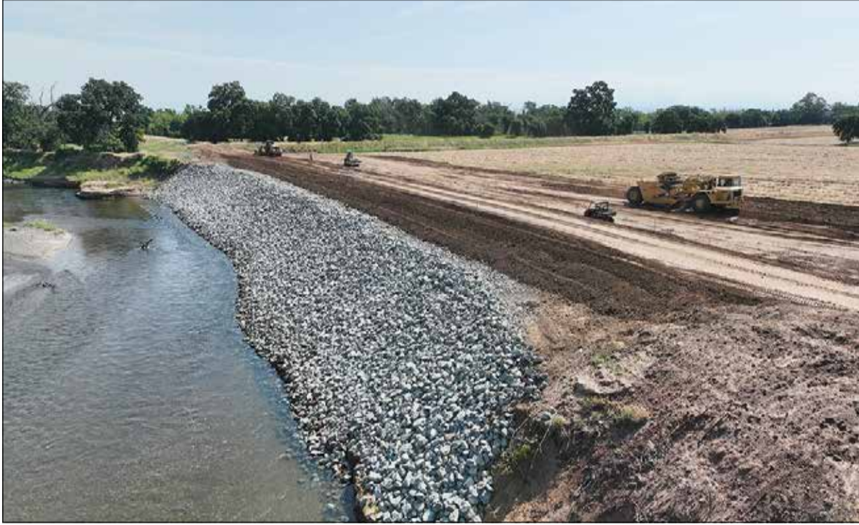
Reclamation District 800 remains $7.5 million in the hole after the January 2023 storms even though it has already been reimbursed for this levee repair at the end of Fig Road in Wilton. The board received the financial update at their Dec. 21 meeting.

Cosumnes River Levee District to Get Help From Feds, State