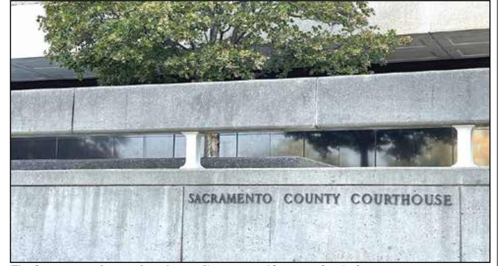
The Sacramento County Courthouse.

civil cases will be exempt from this requirement, but may file electronically in addition to filing documents at the counter, utilizing drop boxes, or postal services.