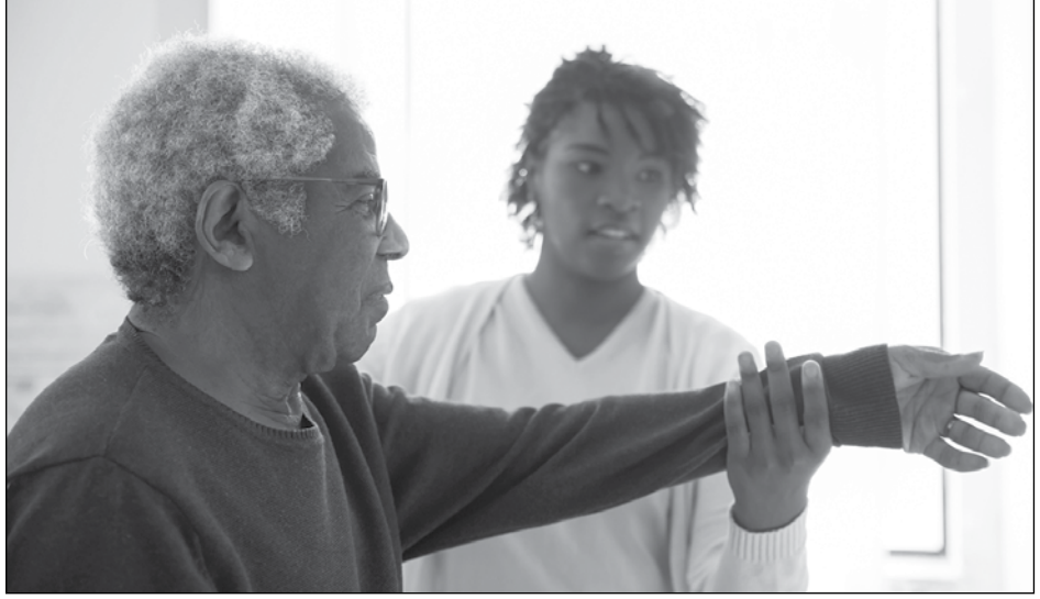
"We want them to get the benefit, which they so deserve." Aid & Assistance is provided by the Department of Veteran Affairs, and it is extremely easy to inquire about you or your loved one's eligibility.