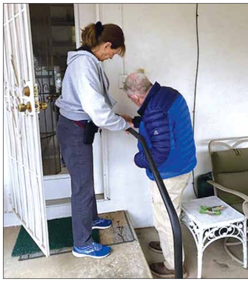
Rebuilding Together Sacramento volunteer and Safe at Home recipient test newly made home modifications.

$10,000 Soil Born Farms, exclusively offering "farm to wellness" career programs to veterans in the Sacramento region. Located in Rancho Cordova. Media: Audio/video available here. $10,000 - Yolo Crisis Nursery, Safe Stays Crisis Respite Care program, providing between 2,000 and 2,500 stays for children annually, including 100 parents and children in crisis, a caring and home-like environment for visitors. Serves: Yolo County, Sacramento and