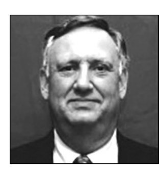
By Dan Walters, CALMatters.org

Hydrologists measure large amounts of water in acre-feet - an acre of water one-foot deep, or 326,000 gallons.