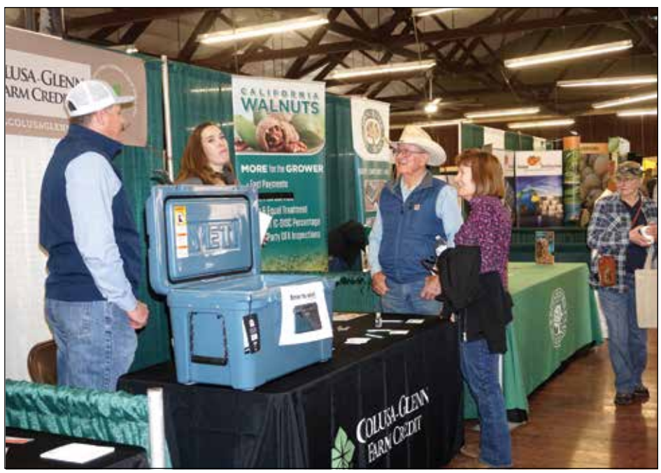
The Colusa Farm Show, billed as the "granddaddy" of farm trade expositions on the west coast, will open for its three-day run, Tuesday, Feb. 6, 2024, at the Colusa County Fairgrounds, 1303 10th St., in Colusa, to provide farmers and ranchers one-stop shopping for all agriculturerelated services.