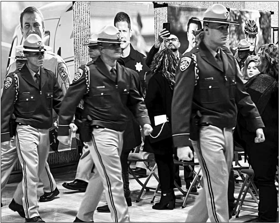
Filing into their graduation ceremony, new CHP Officers were captured in photos by hundreds of proud families.

Gripping New Docuseries Gives Viewers Exclusive Access Inside the CHP Academy