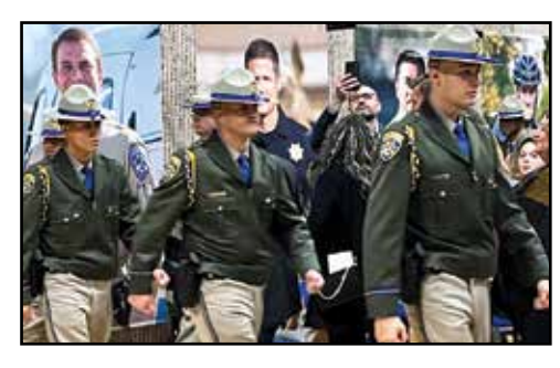
Streaming Soon: "CADETS" The Making of A CHP Officer PAGE 2

Home Care Financial Assistance for Veteran Spouses PAGE 5