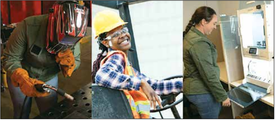
Opportunities are endless for single mothers nowadays.