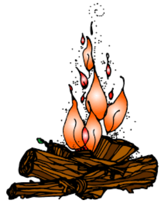
Summer 2024 Campsite Kids & Summer Saplings

While summer seems to be a bit out there yet, I have had an unusual number of early inquiries about our summer programming coming from non-Birch Grove families. Please start thinking about if you will be using Campsite Kids (K-5) and/or Summer Saplings (ages 3-5) this summer. Space is limited for both of these programs, but as always, registration forms go out to Birch Grove families first. Please also keep in mind that the Arrowhead routes, both Lake and Cook County, will continue to run during the summer just as they do now during the school year – same stops, same times. However, if you plan to utilize this service during the summer, you will have to pay $3 per child to and from Birch Grove. Tickets can be purchased in advance from the drivers, or you may pay by cash or check on the spot. Because transportation will be available, slots may fill up even faster than normal. Registration will come out to BGCS families in late March/early April to give BG families enough time to sign up and then to give the general public time to sign up before the first day of programming in June.