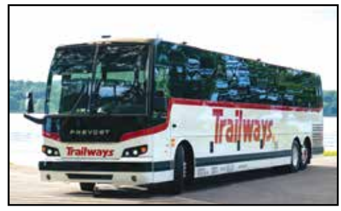
Trailways Forges Strategic Alliance with Greyhound and Flixbus