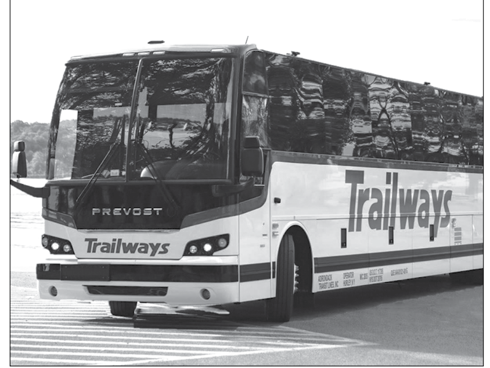
Trailways buses will soon be available in your area.