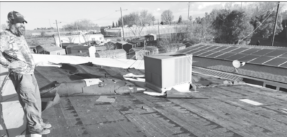
Above and below: Damage to the Twin Cities Rescue Mission from the February 4th storm.