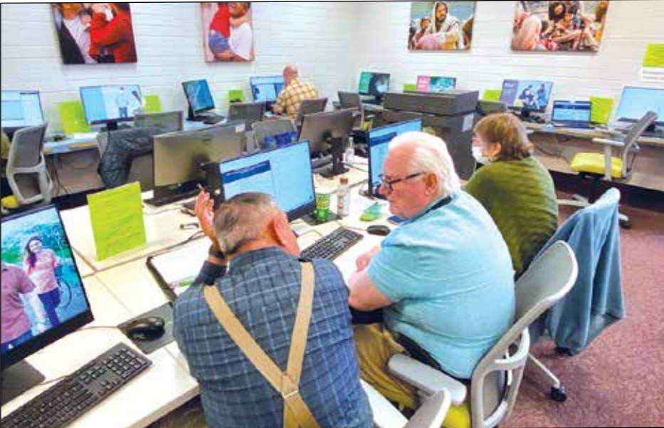
Volunteers assist patrons at the Sacramento FamilySearch Center.