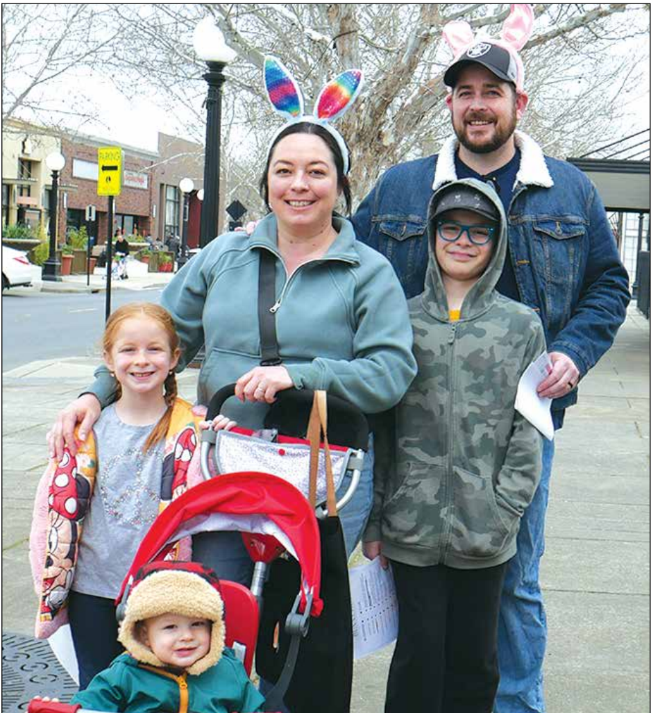
Complete with bunny ears, families bundled up against the chill while searching for prize eggs.