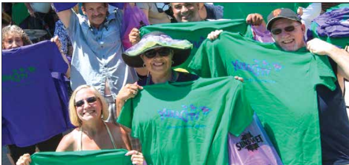
Seniors show off their shirts at the Yuba City Senior Center.

"I want to continue to be a vehicle for seniors to express their needs and to pass those