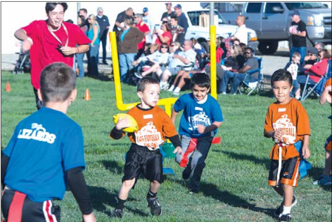
Children playing flag football with the Yuba City Parks & Recreation Department youth sports program.

Quality of life is precisely what the Yuba City Senior Center offers, starting with weekly activities, including Friday night bingo and waffle Wednesday. Not to mention, there are frequent bus trips and monthly schedules filled with activities like yoga, body toning, poker, watercolor painting, quilting, and knitting.