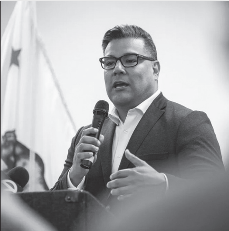
State Insurance Commissioner Ricardo Lara speaks during a press conference with Los Angeles labor leaders and advocates in Commerce on Sept. 26, 2022.