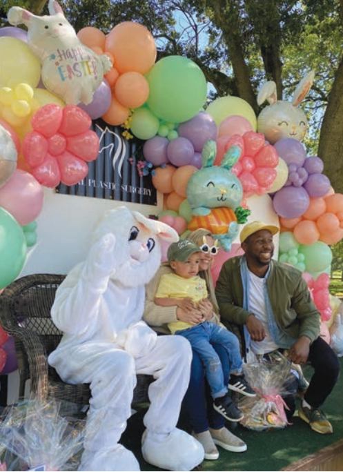
Families had a non-stop line for photos with The Bunny.

Anyone interested in participating with the LPCA can email them at communications@landpark.org . ★