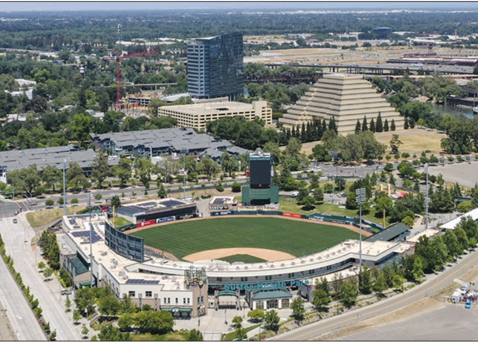
The City of West Sacramento and River City Regional Stadium Financing Authority are thrilled that Sutter Health Park will now be home to the Oakland Athletics.