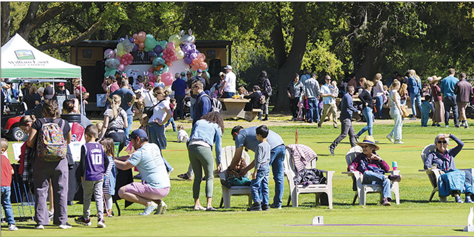
Bunny on the Green was well-attended.