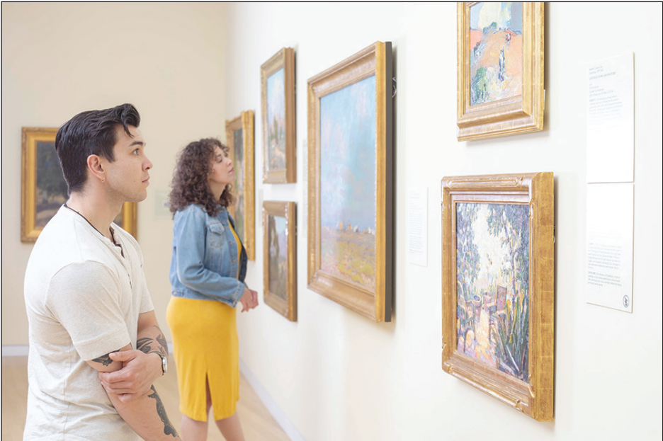
Crocker Art Museum goers enjoy artwork on display.