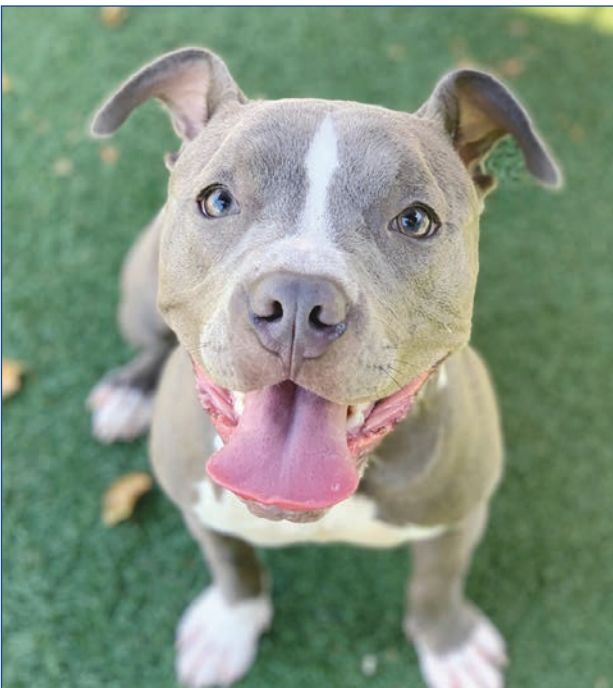
Support all the furry friends of Sacramento by participating in the Doggy Dash.

pet-friendly products and more. Bark at the Park Festival admission is free for registered Doggy Dash walkers. There is a $5 suggested donation for anyone not registered to walk upon entering the festival area. As of press time, $81,000 has already been raised for the 2024 Doggy Dash, with a goal of $222,500. The park is on the corner