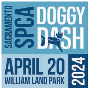
The 31st Doggy Dash will be on April 20 in Sacramento.

With registration comes a short-sleeved T-shirt and admission into the festival afterwards. On the day of the Doggy Dash, registration opens at 8:30 a.m. and the 2K/5K walk leaves at 10:00 a.m. Note: registration is $50 on the day of. It is required that all dogs be up to date on their vaccinations to participate. Immediately following the walk, stay and play at the Bark in the Park festival and enjoy K-9 demonstrations, contests, and more than 100 sponsor and vendor booths to visit, sample and purchase