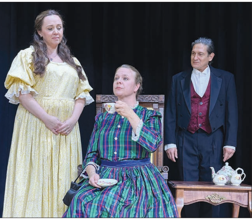
The cast of "The Importance of Being Earnest" performs on stage.