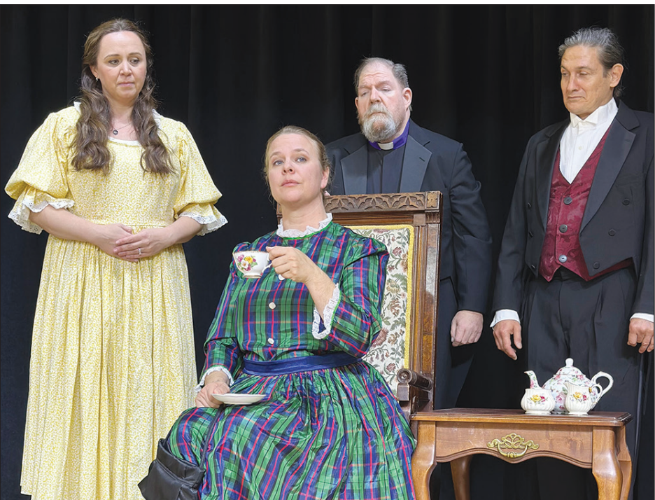
The cast of “The Importance of Being Earnest” performs on stage.