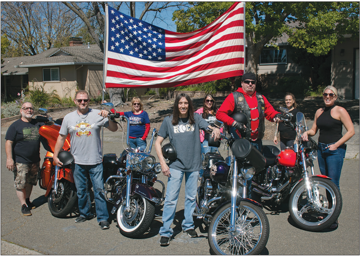
Tesla rock band vocalist Jeff Keith (front, center) joins friends at Woodhaven Avenue, Carmichael, to plan a "Ride For Reason" fundraiser.