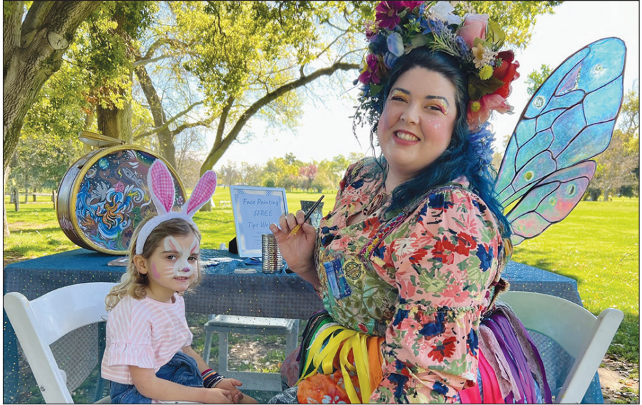
Tilly the Fairy applies face paint to a little customer.