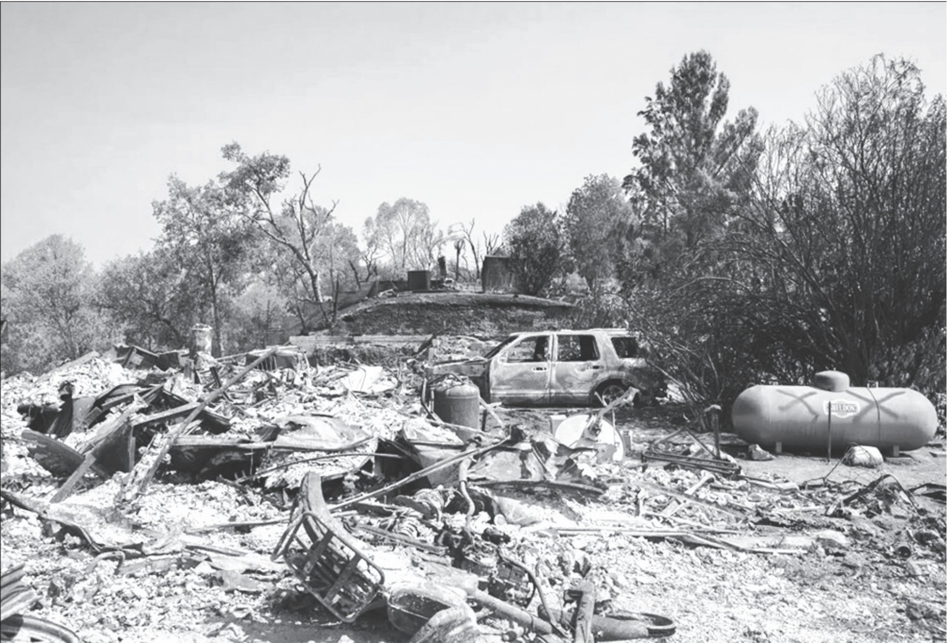
Here are the remains of a burned home in Berryessa Highlands on Sept. 21, 2020.