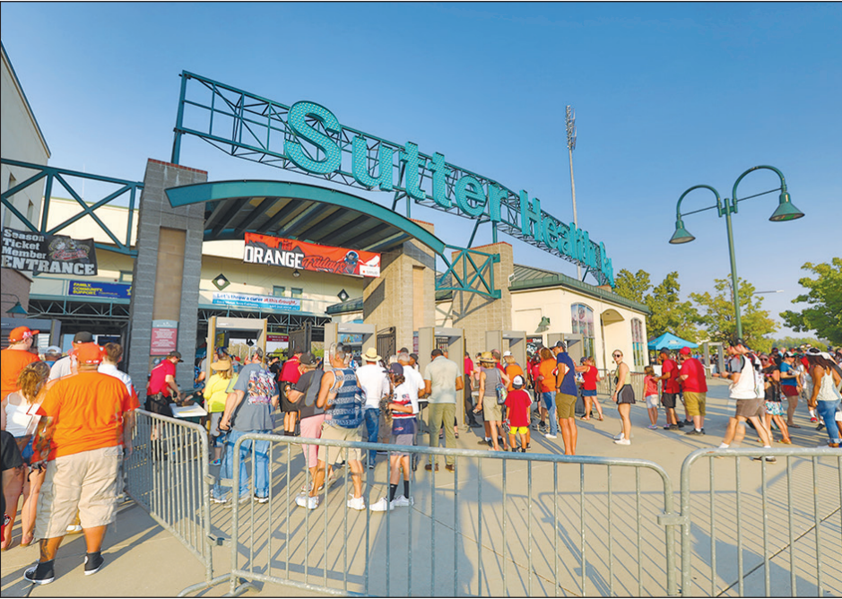
Here is the Sutter Health Park entrance, which will welcome thousands of Oakland A's fans now that the Major League Baseball team will call West Sacramento home temporarily.