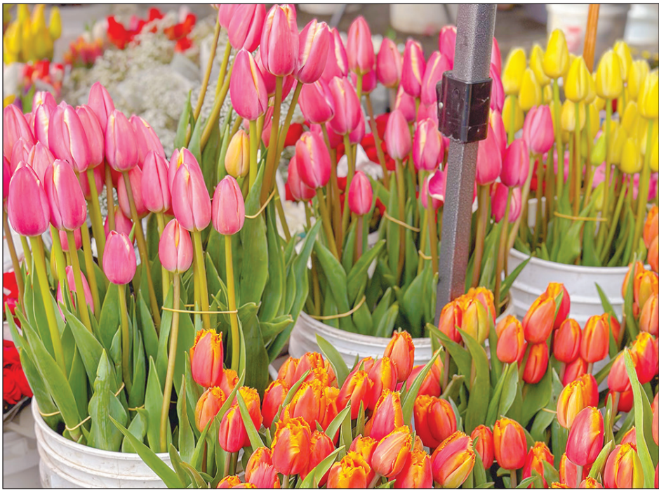
Local vendors and artisans offer a diverse array of gifts such as fragrant fresh flowers at the Midtown Farmers Market.