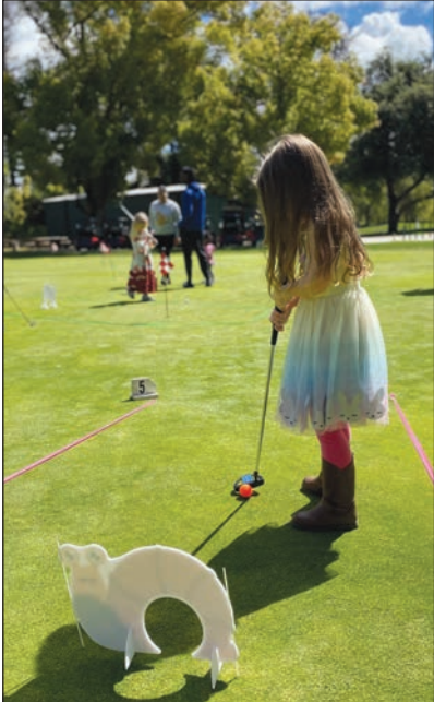
A little girl in her Easter best competes in the putting contest.