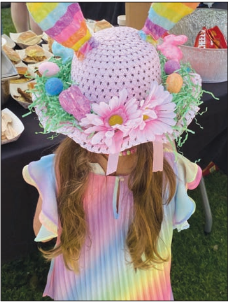
A girl stands head-to-toe in Easter finery.

prizes. Ideal Plastic Surgery sponsored the free activities, and the sound system was donated by Your Neighborhood Tech. Each child received a chocolate bunny and a ticket for a free kiddie scoop from Vic's Ice Cream.