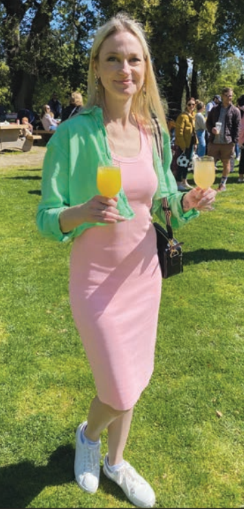
A Land Park neighbor loves the free mimosas for LPCA members.