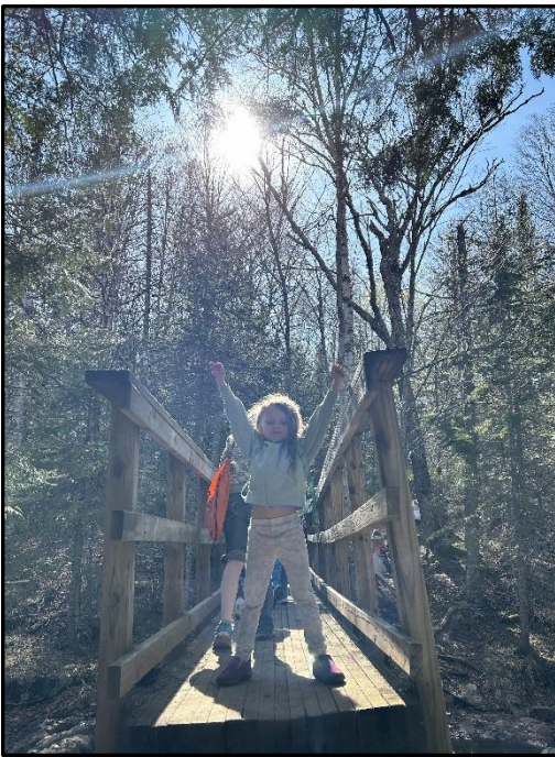
Birch Buddies ~ HIKE! after school program final hike was Cascade!

Saplings parents: Please note that there will be no Saplings on Friday, May 31. The Saplings last day is on Thursday, May 30.