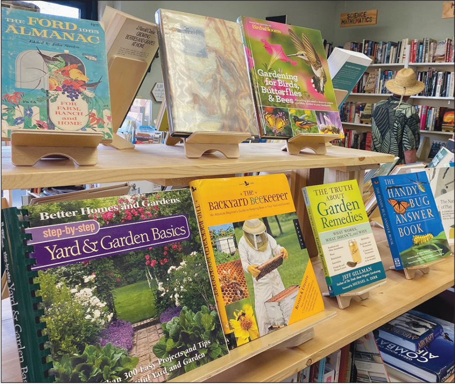
Gardening books grace the main display for spring.