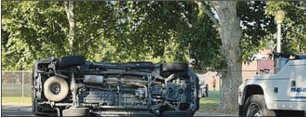
There was a crash in front of California Middle School in June 2023.

allow for a stop sign or traffic signal. Traffic volumes crossing 11th Avenue at Land Park Drive were also too low to qualify for a stop sign. But the Traffic Safety Committee is undeterred, as they continue to meet with District 7 Councilman Rick Jennings and his team to find feasible safety solutions for the most dangerous intersections. They also continue to discuss other options like mini-roundabouts that slow down traffic as it flows through the neighborhood street.