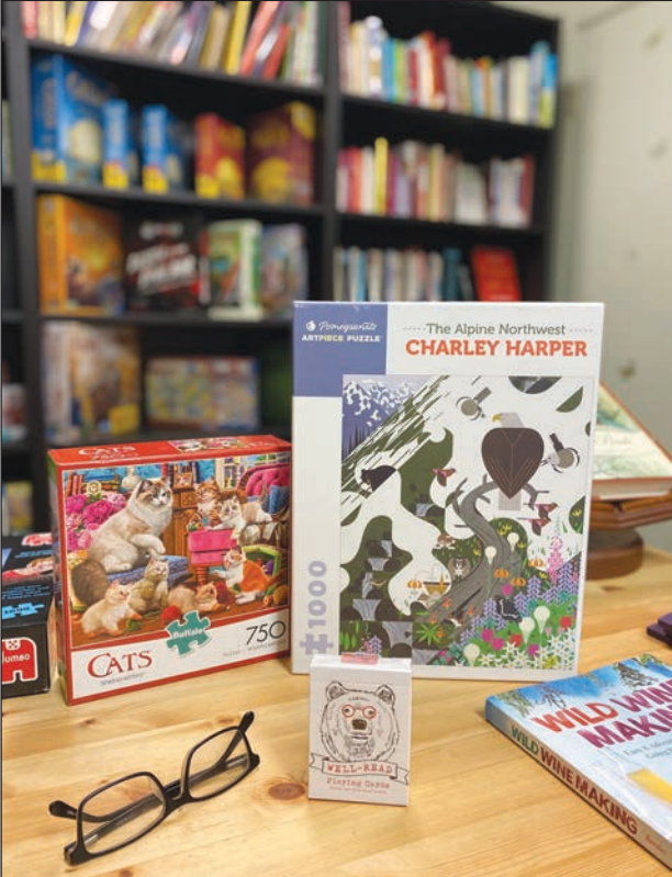
Games and puzzles are ready to explore at Crawford’s Books.