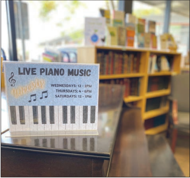
Local pianists are encouraged to come and play the keys at Crawford’s Books.