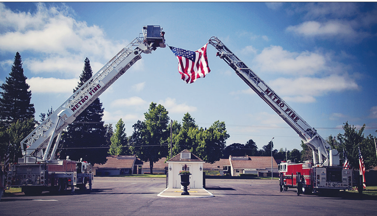
Fire department trucks raise the American flag high at Mount Vernon Memorial Park's Memorial Day celebration.