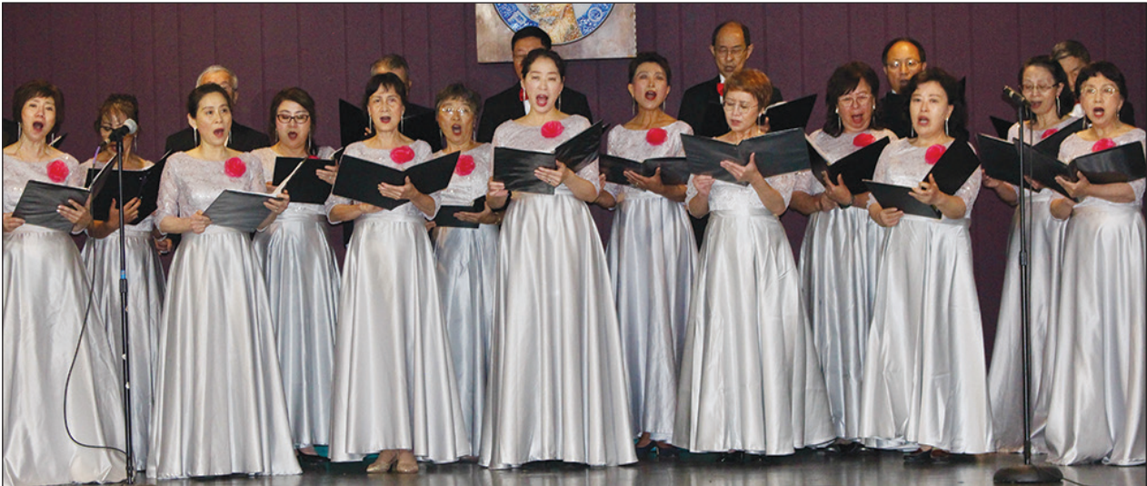
The California Bridgeway Choir performs at Elks 6's Mother's Day concert.