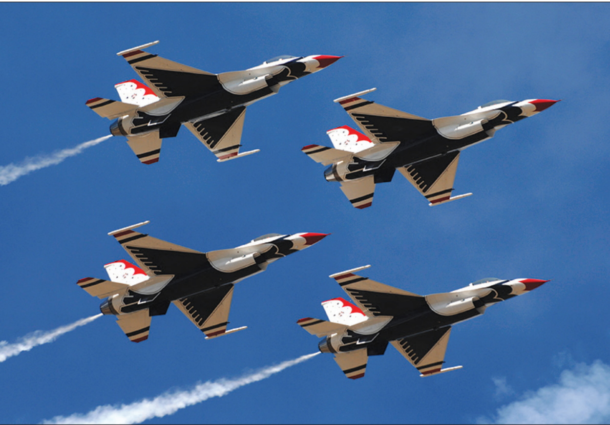
The United States Air Force Thunderbirds Jet Demonstration Team returns to the California Capital Airshow by popular demand.