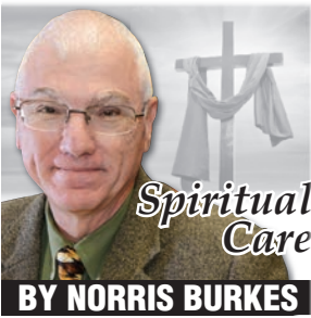
BY NORRIS BURKUS

Some people call the church directly and others find me through my local