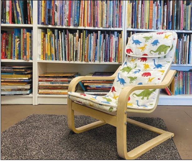
Little readers can also sit and take their time deciding which books to take home at Crawford’s Books.