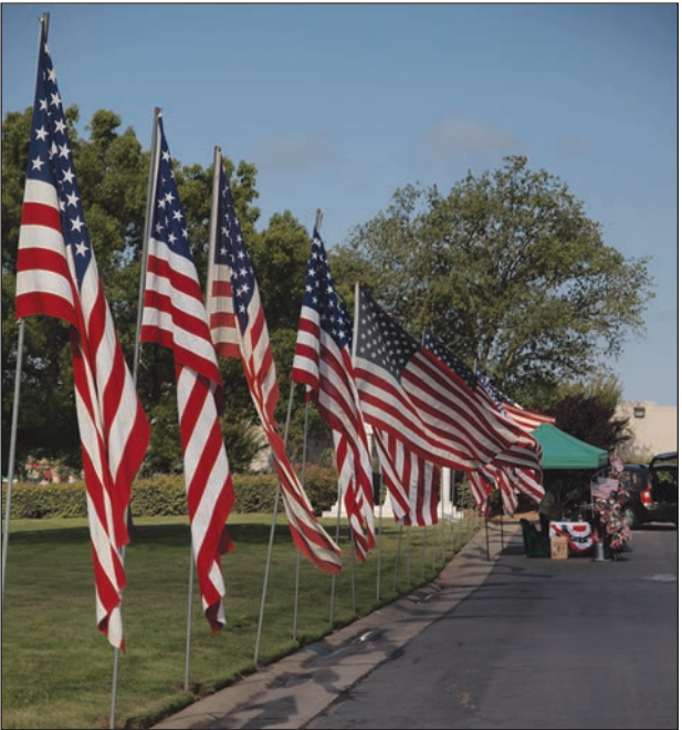
American flags encircle Mount Vernon Memorial Park at last year’s Memorial Day celebrations.