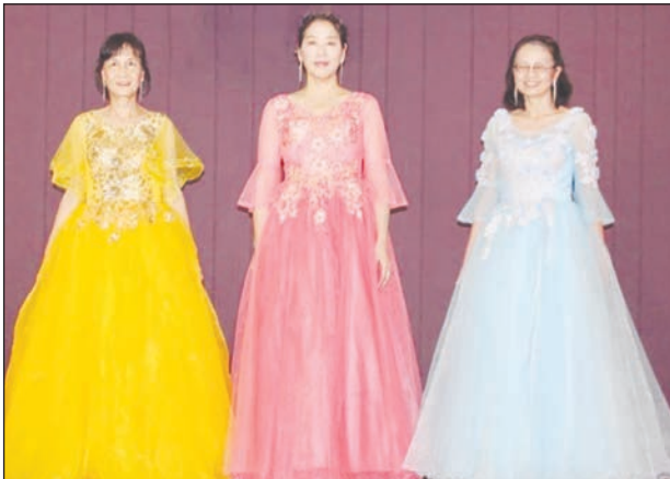
The California Bridgeway Choir finale was women in beautiful gowns performing "On Wings of Song."