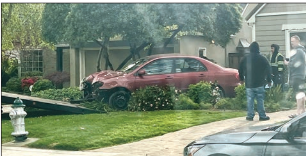
A car crashed into a house on Vallejo Way and Land Park Drive on March 23.

The city engineer conducted a warrant study measuring traffic volumes and speeds at several key intersections to see what traffic mitigations could be implemented. The conclusion was that 2nd Avenue and Land Park Drive are too close to Broadway to