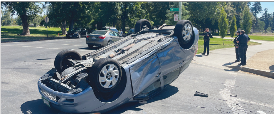
The intersection at Land Park Drive and 14th Avenue was the scene of a crash in September 2023.

Tragically, there have already been two fatalities