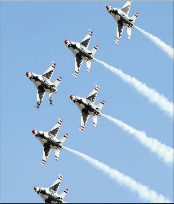
The skies will light up July 13 and July 14 with performances by the top airshow performers during the annual California Capital Airshow.

For more information about the airshow, performers and discount tickets, visit the airshow's website at www.californiacapitalairshow.com . ★