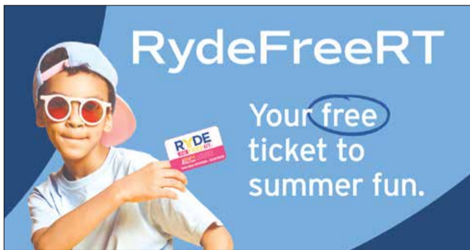
Youth from transitional kindergarten through 12th-grade can ride free for the summer with the RydeFreeRT card.

To ride free, students/youth need a valid RydeFreeRT card. Youth who are experiencing homelessness or taking