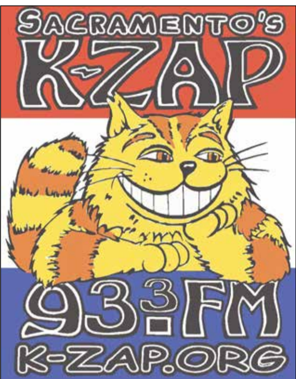
K-Zap has been a widely beloved radio station in the Sacramento area for many years.

The "10 To Feed the Kitty" donation drive will run from now until July 4. Listeners can donate online at k-zap.org/donate using their credit, debit card or Venmo. In addition to the online campaign, K-ZAP will promote the drive at various events in the community, including the Carmichael Concerts in The Park on June 15