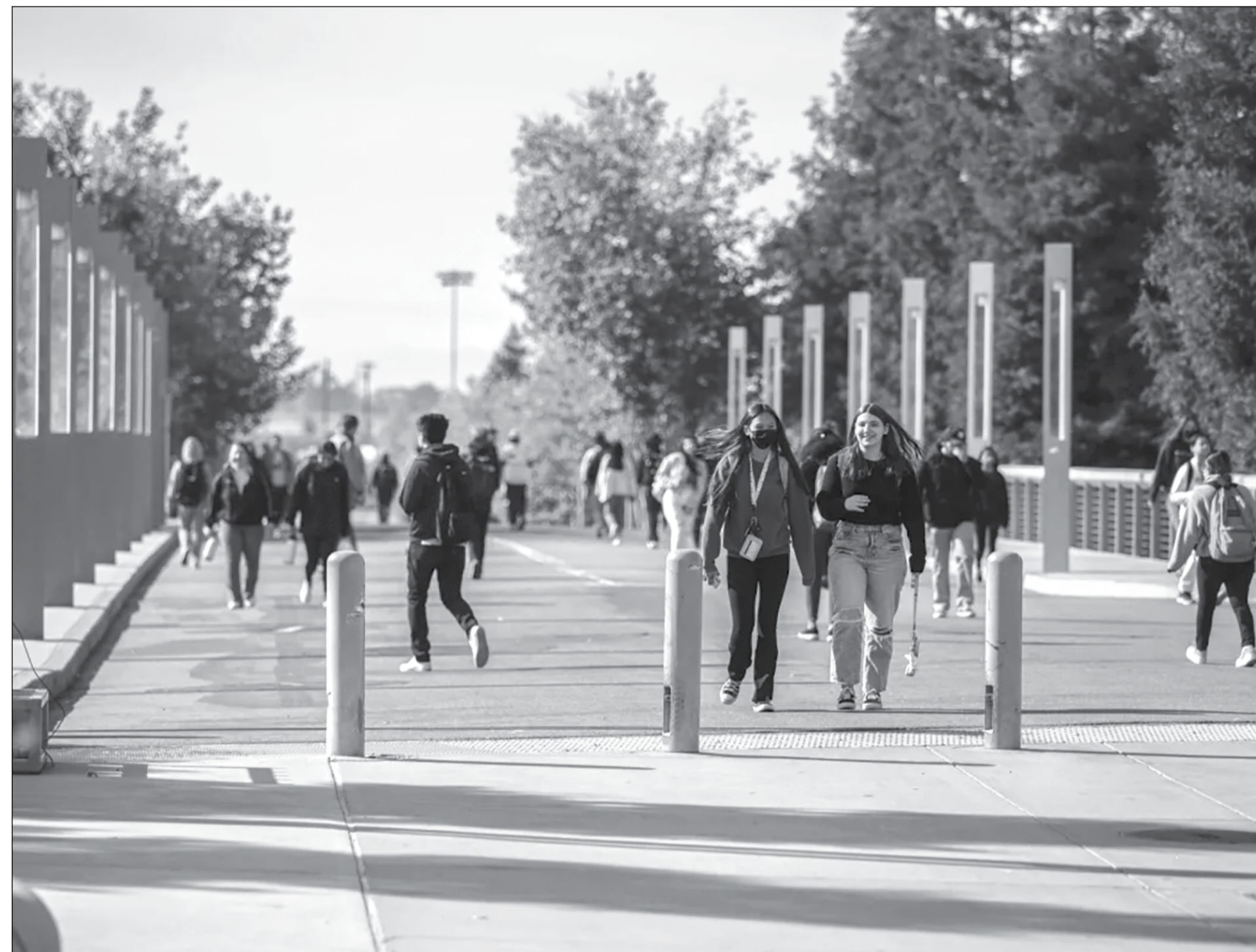
Students walk along the bridge leading into campus on Scholars Lane at the University of California Merced campus on Nov. 4, 2022.