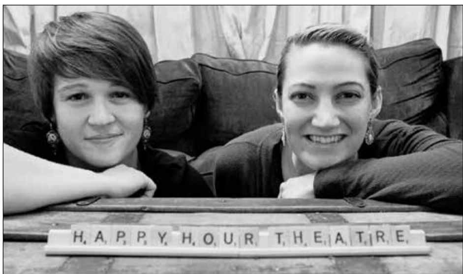
The Happy Hour Theatre Company is pleased to receive the $500 microgrant.