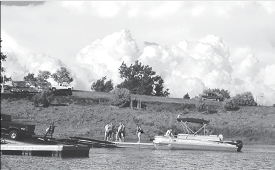
As fun as boating can be, it is also very important to practice it safely.

Continued from page 1 this vital safety check.