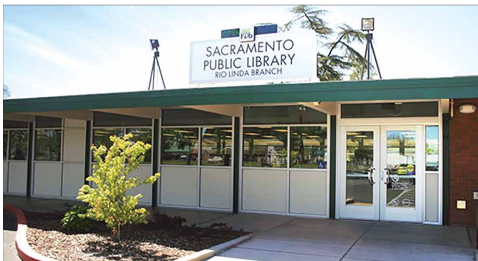
Meal sites are available at 14 library locations: Arcade, Carmichael, Colonial Heights, Del Paso Heights, Elk Grove, Fair Oaks, Martin Luther King, Jr., North Highlands - Antelope, North Sacramento - Hagginwood, Rancho Cordova, Rio Linda, Southgate, Sylvan Oaks, and Valley Hi - North Laguna.