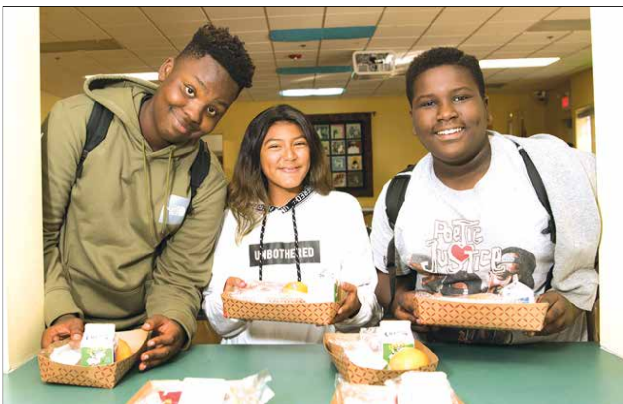
Teen volunteers help with the Lunch at the Library program.

Lunch will not be served on Independence Day (July 4). All libraries will be closed for that holiday. ★