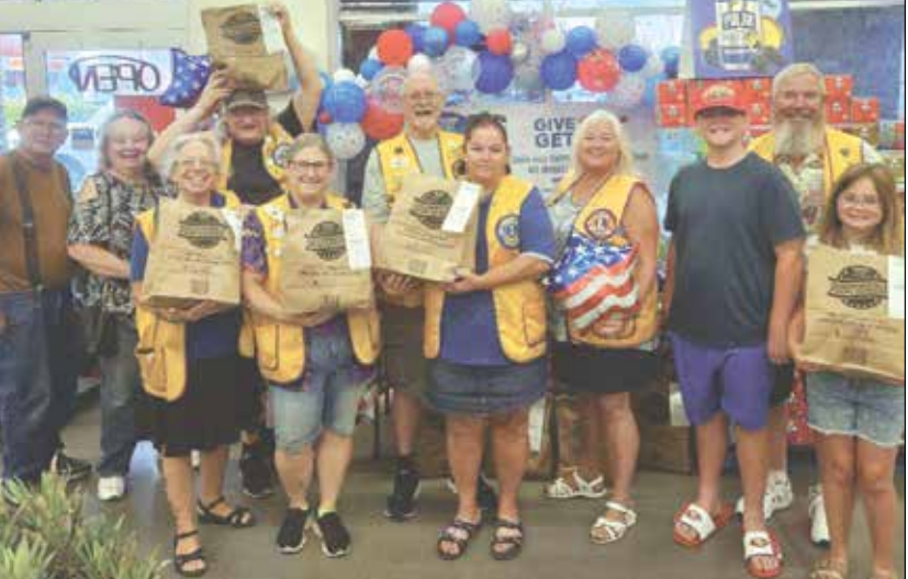
Lions Club members and company have been working tirelessly to plan the Independence from Hunger food drive.