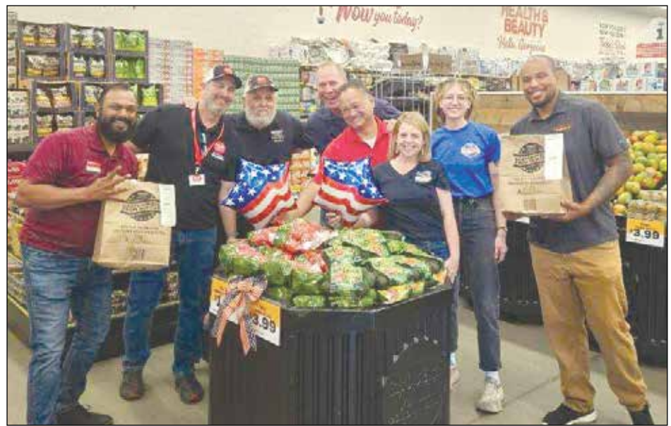
Consider supporting your community by stopping by a Grocery Outlet and donating food.