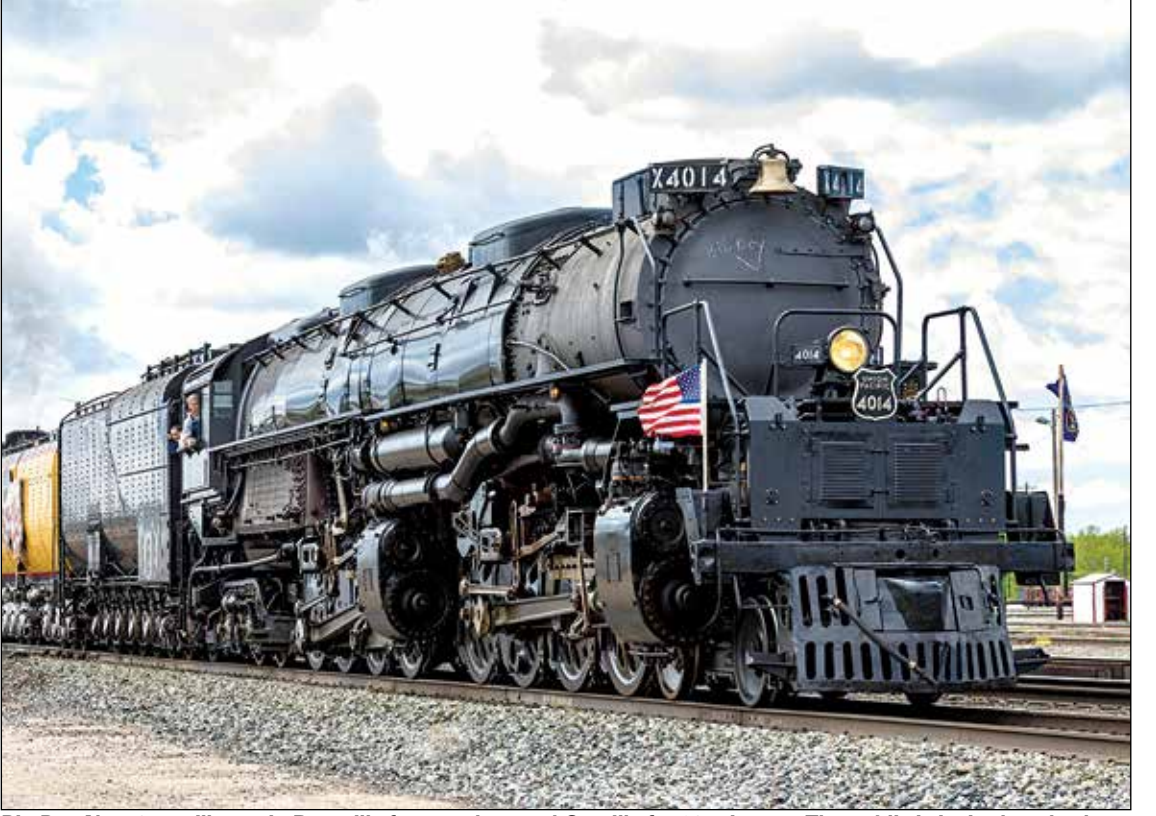
Big Boy No. 4014 will stop in Roseville for two days and Oroville for 30 minutes. The public is invited to check out this historical icon.

During World War II Union Pacific operated some of the most modern and powerful steam locomotives ever built. Among them were the famous "Big Boys," the largest steam locomotives in the world. Working with them were the "800-class" high-speed passenger locomotives, as well as hundreds of older class steam engines. Union Pacific's steam legacy continues today with the