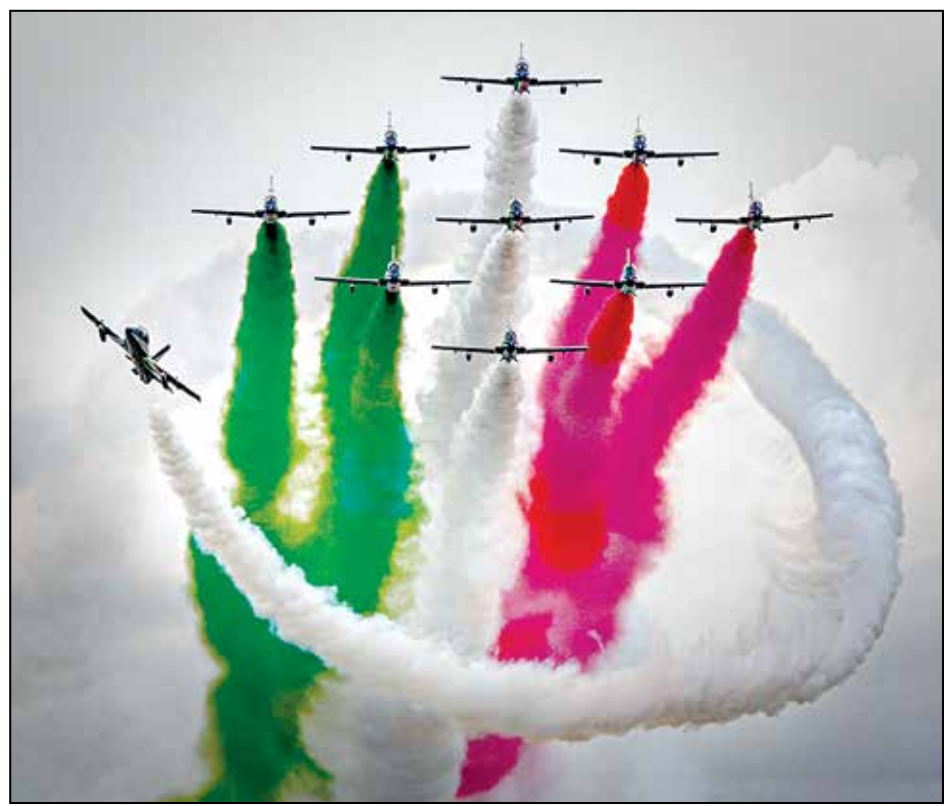
Italian jet team Frecce Tricolori will headline the 2024 California Capital Airshow, as part of its first North American tour in more than 30 years.

Continued from page 1 online only and will not be sold at the gate. Purchase tickets now before they sell out.