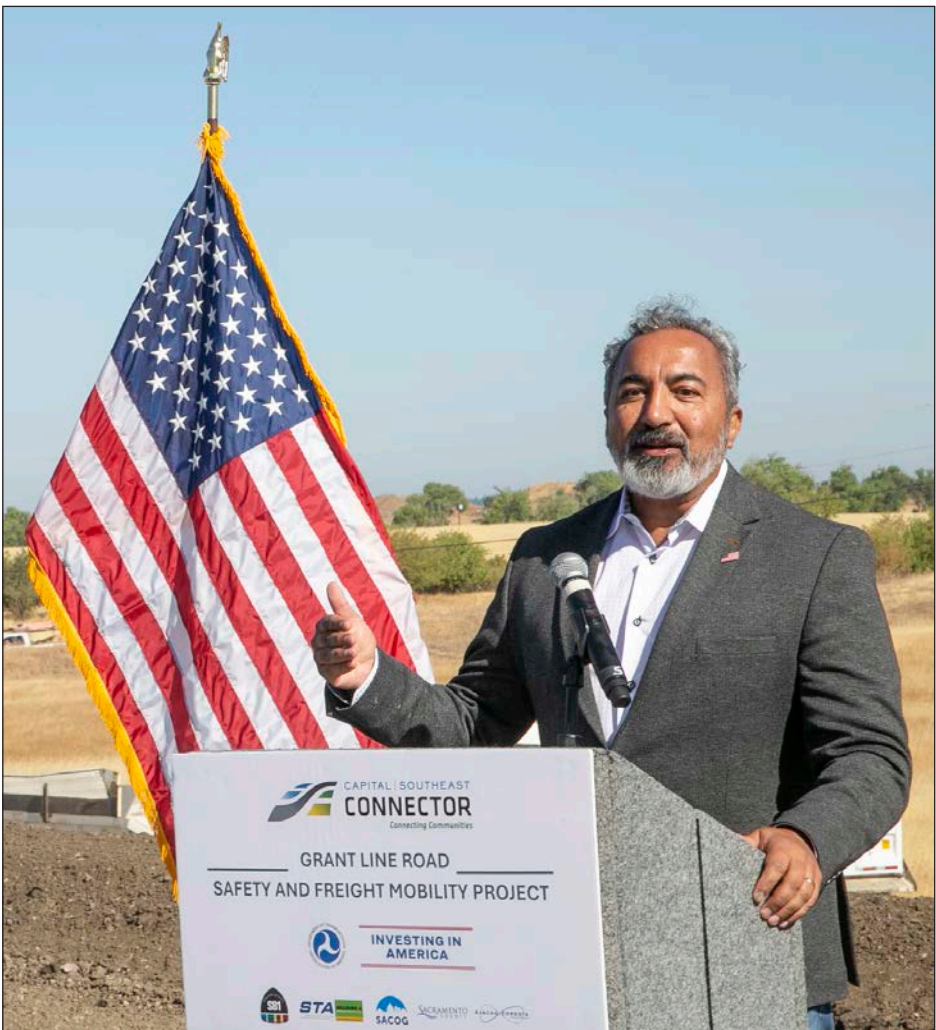
Congressman Ami Bera says the grant could serve as a catalyst for completing construction of the Capital SouthEast Connector.

Cooper described Grant Line Road as a critical route to the South County. “This is kind of late in coming but we need it,” the sheriff said. “It’s a safety issue for our motor-ing public and for your first responders.”