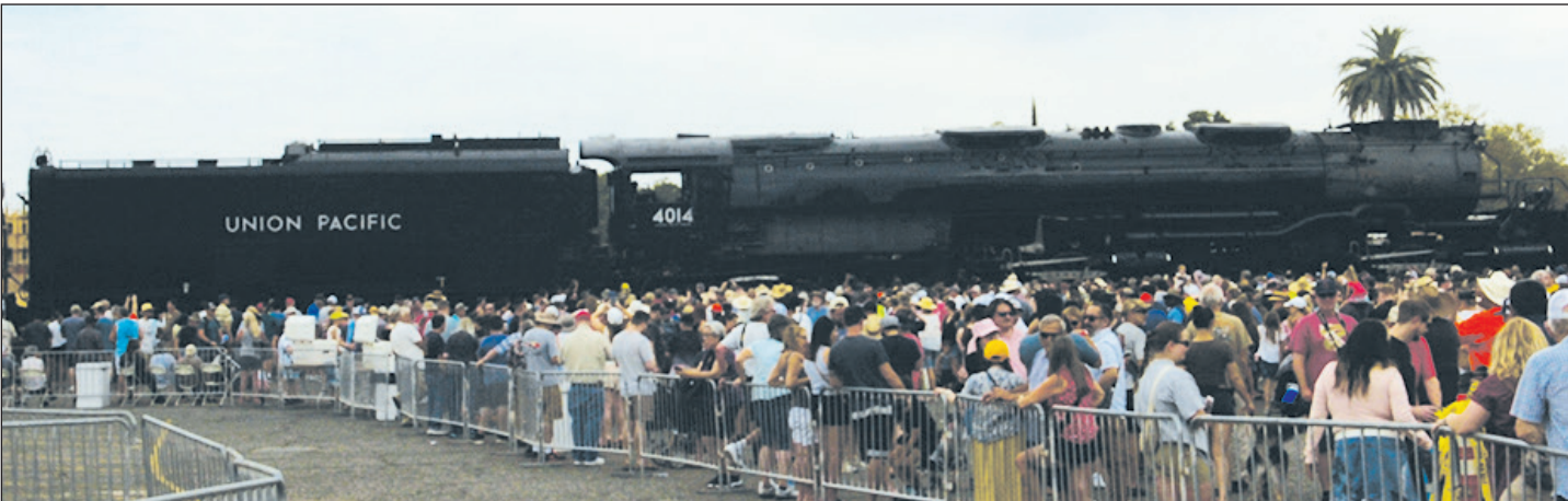
Thousands of railfans viewed Union Pacific's 4014 Big Boy during its July 12-13 stop in Roseville.