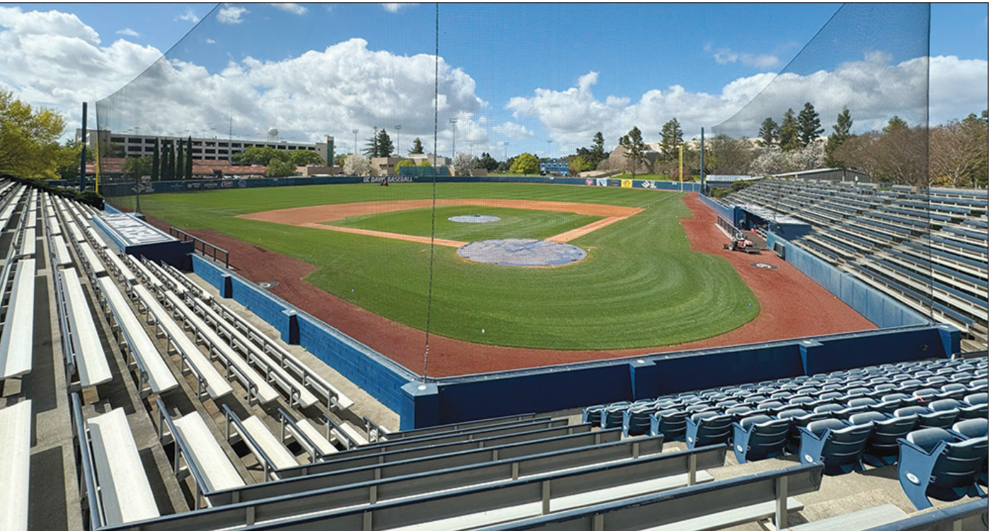
Phil Swimley Field at James M. & Ann Dobbins Baseball Stadium has room for 3,500 spectators.