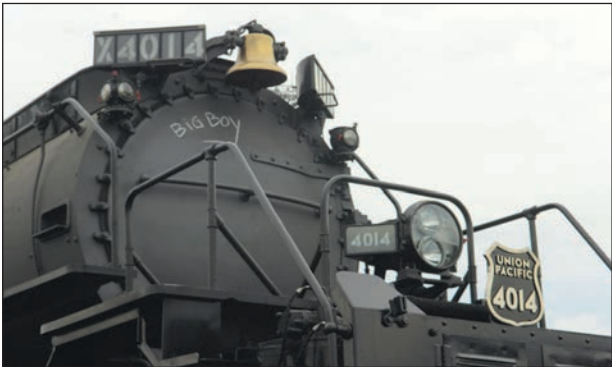
Union Pacific's 4014 Big Boy, an oil-burning 4-8-8-4 locomotive, is 132 feet long and weighs 1.2 million pounds.