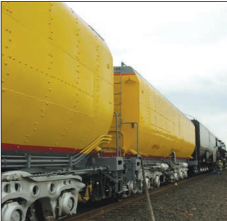
Extra tenders carry water for Big Boy's steam boiler.