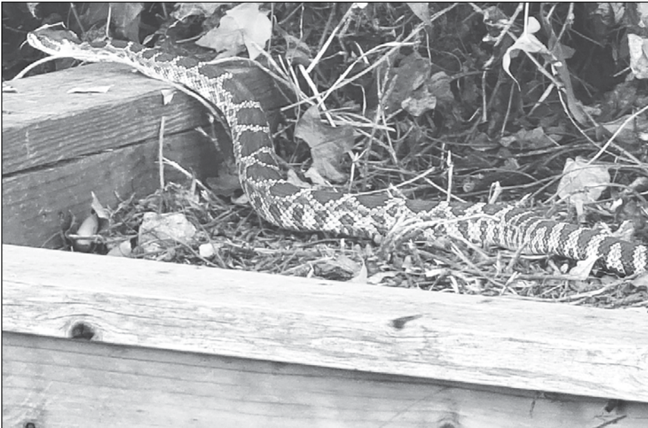
Northern Pacific Rattlesnakes are common in this area.