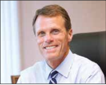
Commentary by Ted Gaines

The shocking national political events have rightfully dominated the news of the past few weeks. But in relative obscurity, governments everywhere are still working, and the California political establishment has been busy waging a war of deception and disempowerment against our citizens. This time, they’re targeting the ballot initiative process, an important form of direct democracy. First is the death of the Taxpayer Protection and Government Accountability Act (TPGAA), a voter-rights initiative aimed at putting the brakes on runaway taxes and fees plaguing our famously expensive state. The Taxpayer Protection and