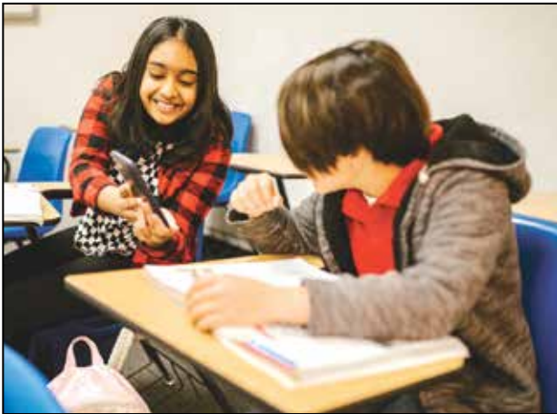
Excessive smartphone use among youth is linked to increased anxiety, depression, and other mental health issues.

Excessive smartphone use among youth is linked to increased anxiety, depression, and other mental health issues. A recent Pew Research Center survey found that 72% of high school and 33% of middle school teachers report