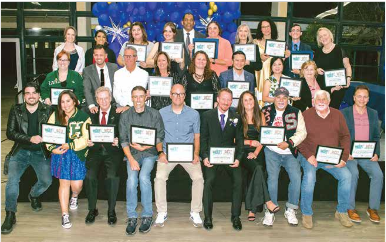
Last year's Best of Carmichael winners posed for a group portrait at La Sierra Community Center.