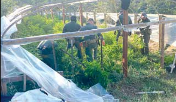
Unified Cannabis Enforcement Task Force officers find illegally grown cannabis.