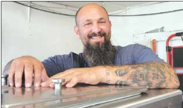
This grill is where the magic happens. But don’t stop with hamburgers; try one of Lou’s Burgers’ many milkshakes.

Contact Janice Row at janice@restaurantsrow.com or at 916-292-1314. ★