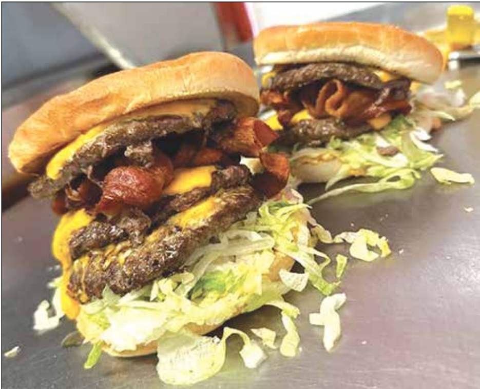
Lou’s Burgers has been a must-visit restaurant in Rio Linda for many years. The yummy burgers include a secret sauce that keeps customers coming back all the time.

Life happens and things change. The landlord that their grandfather had passed away and a new landlord bought the building and the land. And had big plans but since they had a lease, he had to put his plans on hold. The two sides tried to work out something that worked for them both but the landlord decided to sell to someone else. The new landlord also wanted the