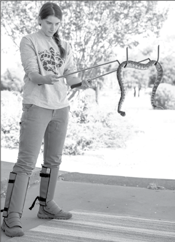
Save The Snakes teaches students and wildlife professionals how to handle venomous snakes safely. The organization accepts donations to keep their work going.

"The important thing to remember is that rodents attract snakes," Nuckolls said. "Removing a snake's food source is crucial to keeping your home snake-free."