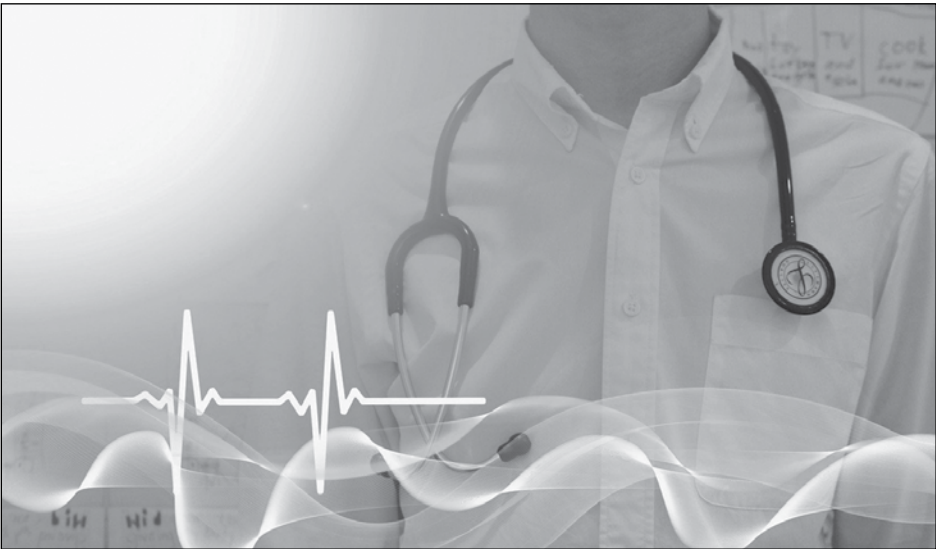
A free youth heart screening in Davis this fall will help identify young people who may be in that group. The event is sponsored by the Kyle J. Taylor Foundation (KJTF), in collaboration with UC Davis Health and Project ADAM Sacramento.