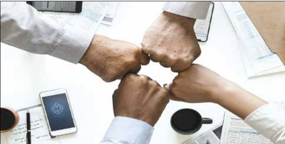
The Greater Sacramento Economic Council contingency is looking forward to connecting in-person with South Korean companies already investing in the Greater Sacramento region.