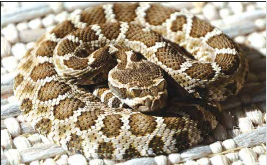
Northern Pacific Rattlesnakes are recognizable with their distinct triangular heads and dark brown blotches running down their backs.

"They can die if they become overheated, so it's not unusual to find them on