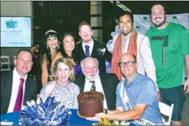
An over-the-top dessert auction is a highlight of Best of Carmichael celebrations, scheduled this year for Nov. 1.

Businesses in 69 fields will be 2024 contenders. Categories include professional services, non-profits, markets, restaurants, fitness centers, churches and many more entities that