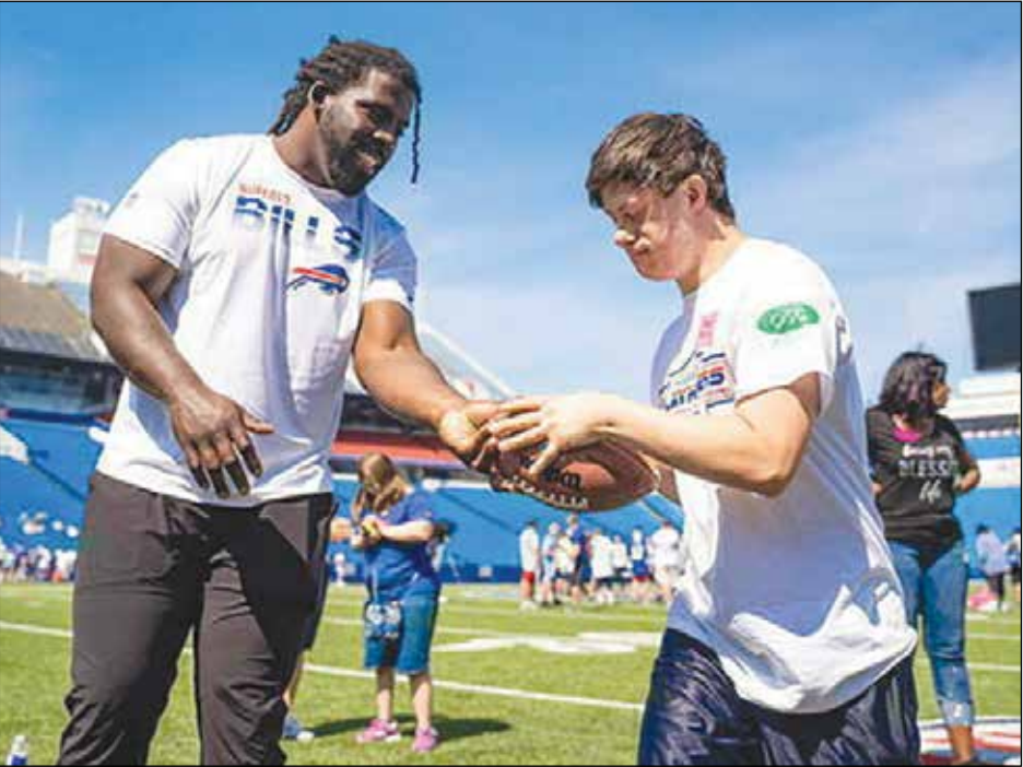
Playmakers Character and Leadership Academy events encourage all youth to participate. From mid-September through November, a free, inaugural Playmaker Flag Football will have two leagues for boys and girls: a league for youth between the ages of 6 and 14, and another league for youth with developmental differences.