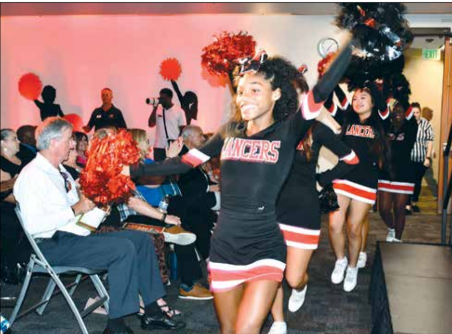
The Cordova High school cheerleaders start the festivities off with a Hall of Fame cheer.