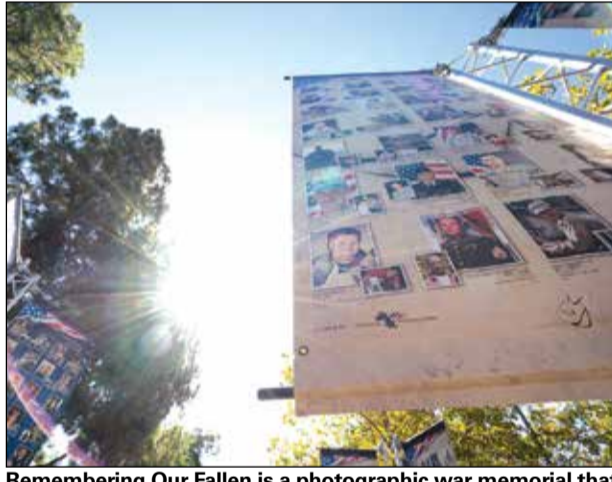
Remembering Our Fallen is a photographic war memorial that honors those who served and made the ultimate sacrifice.

In honor of this somber anniversary, the city of Rancho Cordova hosted the "Remembering Our Fallen" exhibit. The