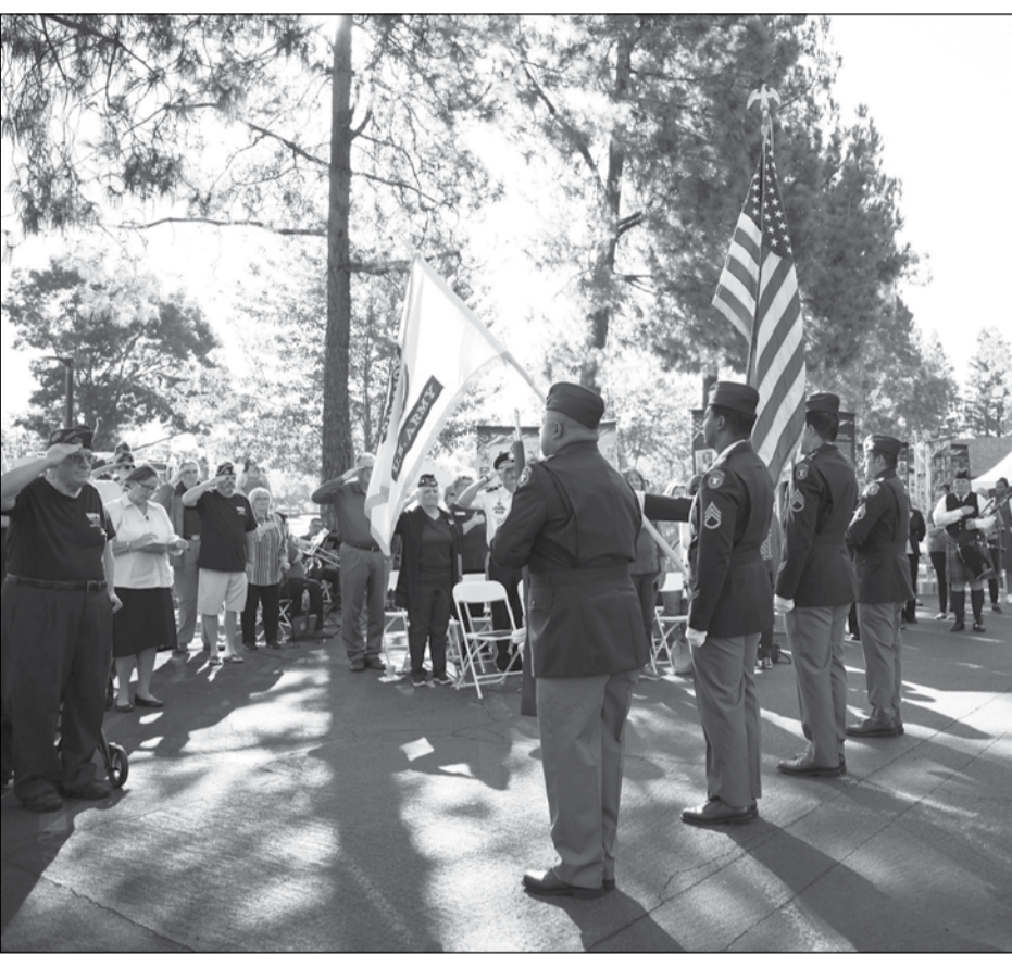
The memorial included a presentation of colors by the U.S. Army Color Guard.