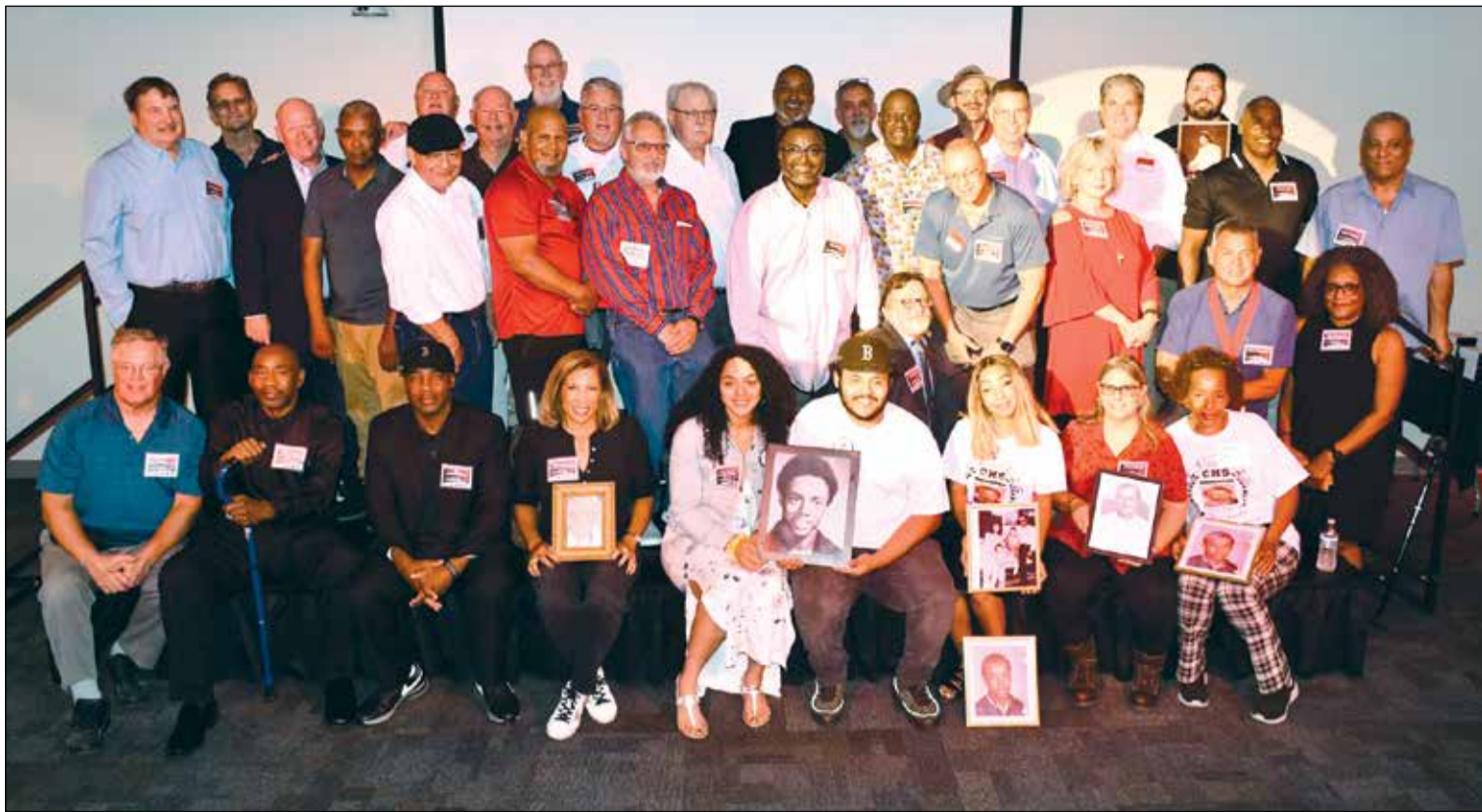
Members of the Cordova Lancer's 1977 varsity football team and family members of teammates who died pose for a photo.

Each inductee received individual recognition with video