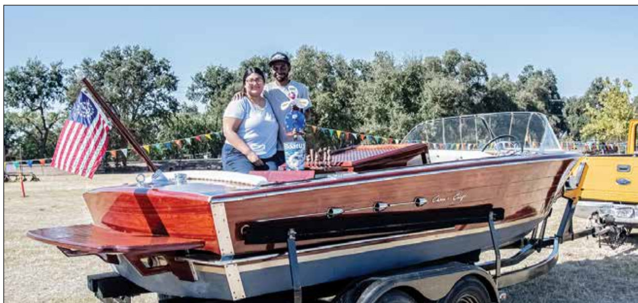
At the 2023 Oktoberfest Car Show, a couple shows off their classic boat.

For more information about the event and the Lions Club, visit https://www.facebook.com/RioLindaLC . ★