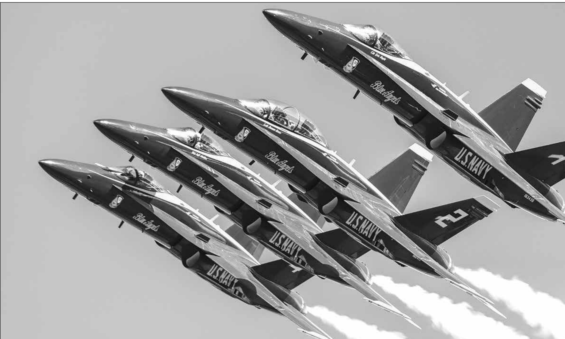
The Blue Angels return to next year's California Capital Airshow at Mather Airport on March 22 and March 23. The renowned Blue Angels, pictured here, performed at the California Capital Airshow in 2019.