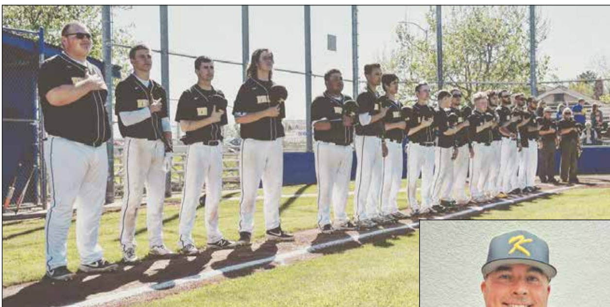
The Rio Linda Knights baseball team will kick off their season in early 2025.

Twin Rivers Unified School District News Release