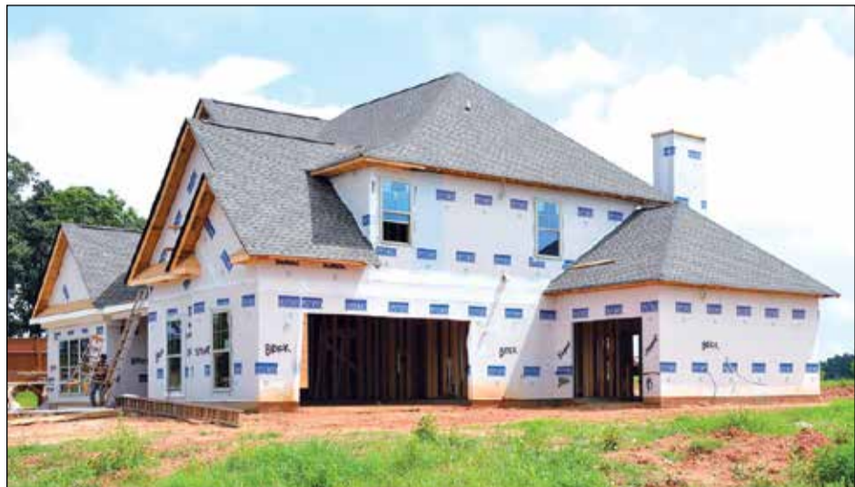
Building Industry Association (BIA) members reported selling 605 homes during the month in the region.