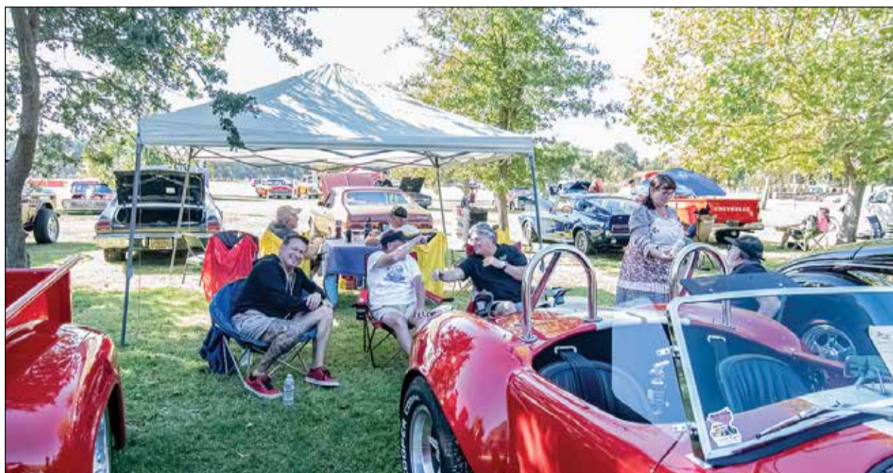
Attendees enjoy the ambiance of the Oktoberfest Car Show.

PLAYMAKERS INCLUSIVE SPORTS • CHARACTER • RELATIONSHIPS