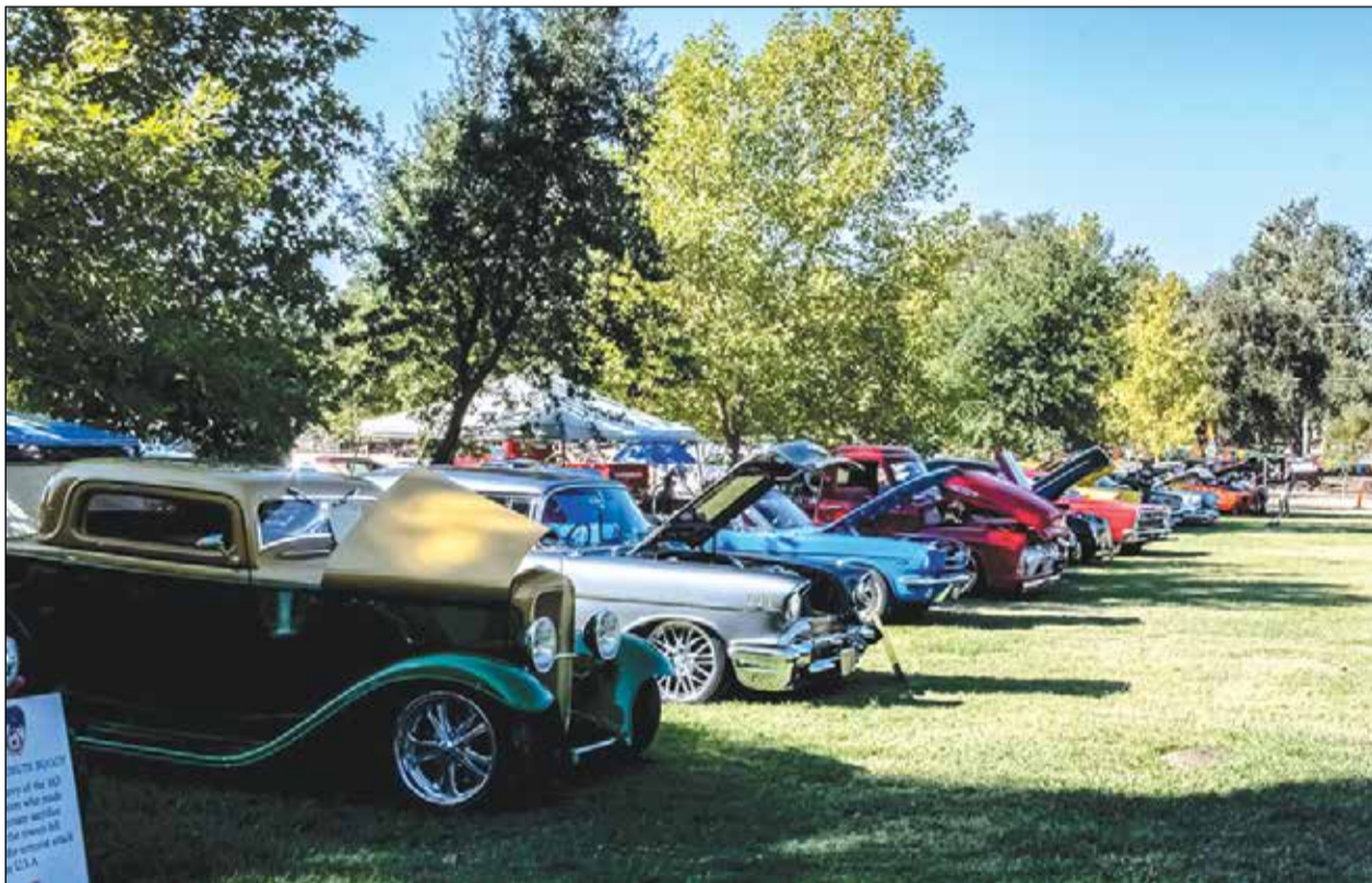
A wide variety of classic cars will be available to view Oct. 5.