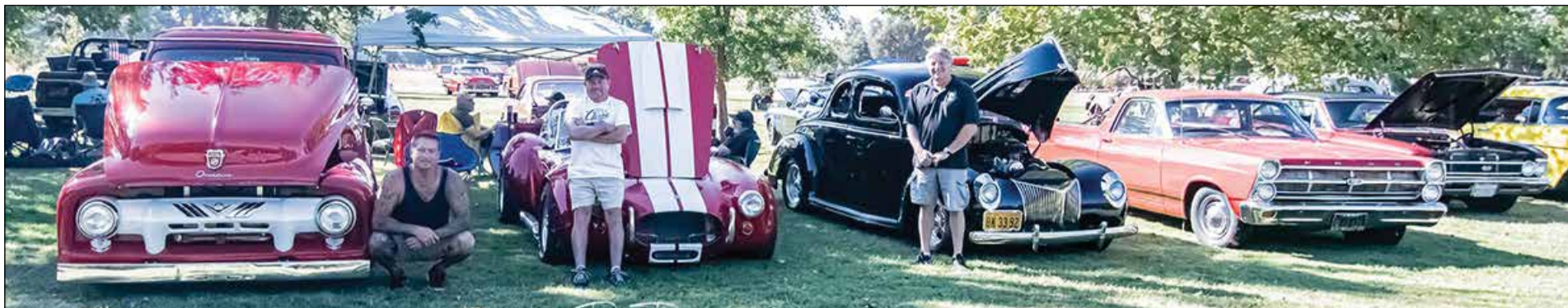
Car owners stand with their prized belongings at the 2023 Oktoberfest Car Show.

Continued from page 1 of their previous car shows and the club is constantly hosting events and fundraisers to benefit the local community," Kypke said.