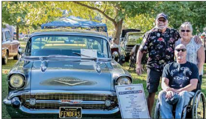
A 1957 Chevy Belair was on display at last year's event.