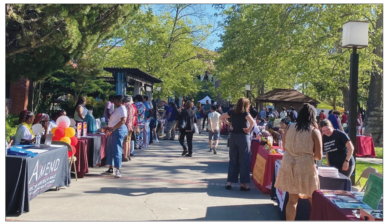
The campus celebrates the Sacramento City College event on a lovely spring day.