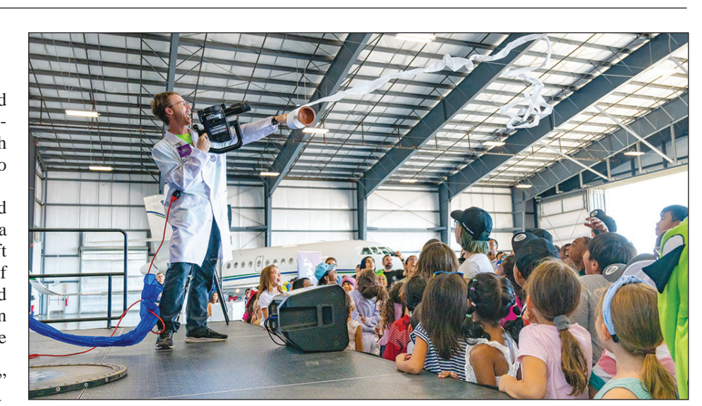
An interactive "Mad Science" show took place at the event.

Tengesdal highlighted the significance of representation, saying, "I think events like this are great for people that are likeminded to meet people that have been there and done that. To show kids the diverse backgrounds