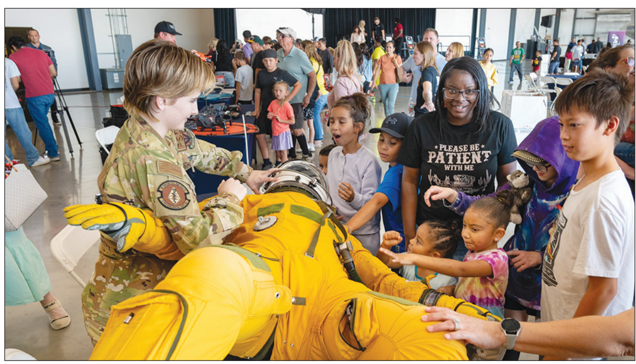
U.S. Air Force ROTC was one of the many hands-on STEM exhibits at the event.