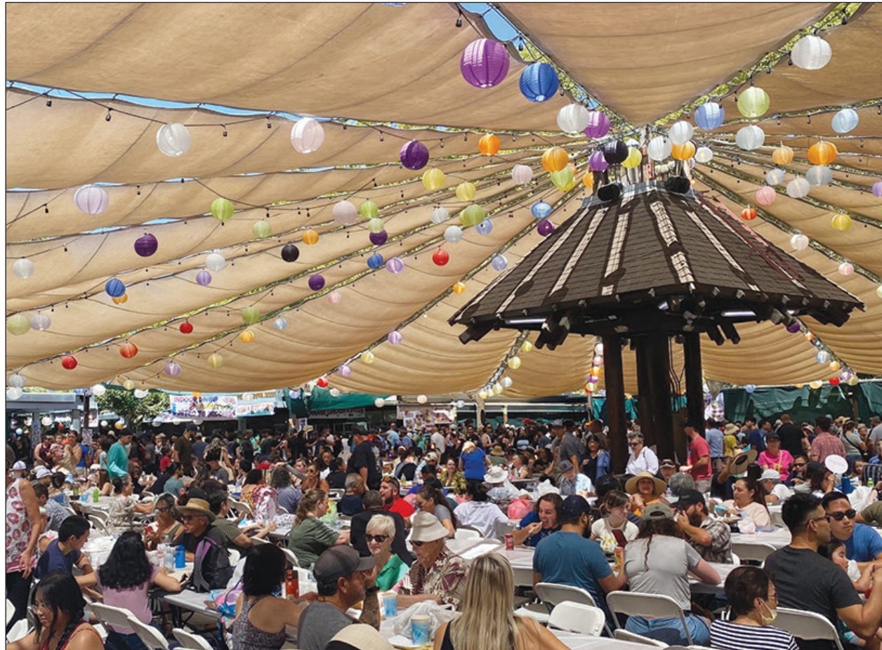
The annual Food and Cultural Bazaar at the Buddhist Church brought thousands of guests.