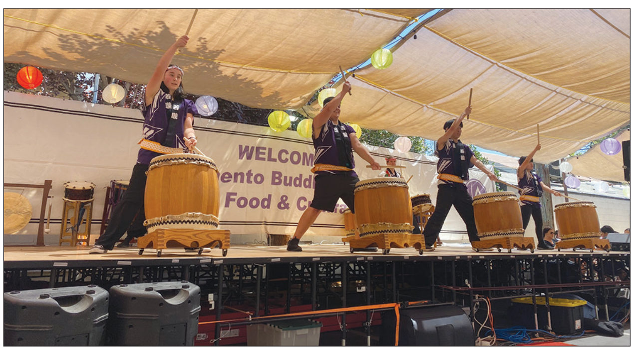
Taiko Drum Players entertain guests.

Continued from Page 1 the Bazaar's origins came at the end of World War II, when the interned Japanese Americans were released from the American internment camps and came home. They wanted to reconnect with each other so the community decided to host a Japanese cultural bazaar. That was 1946, making this the event's