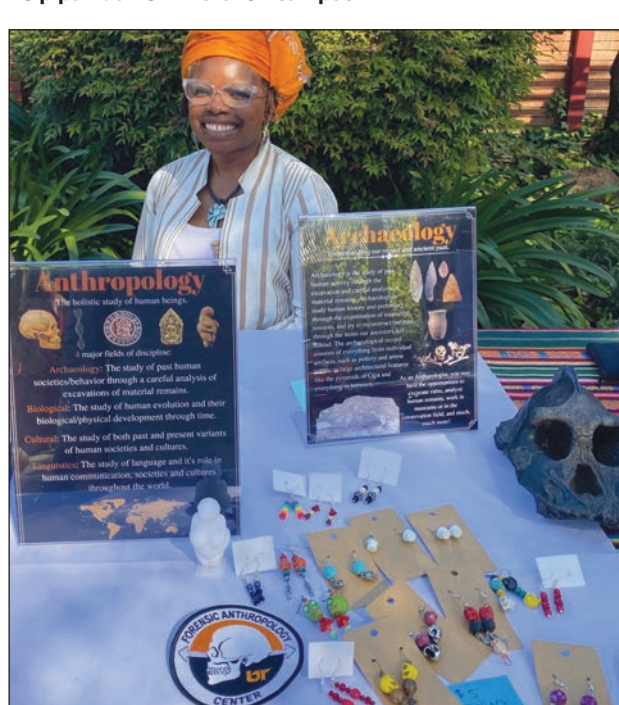
A welcoming student hosts an anthropology table at the