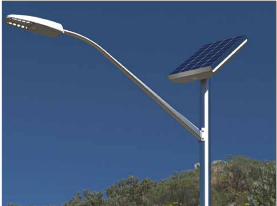
Pictured here is a general sample of what a typical solar powered streetlight looks like. Each solar powered streetlight operates individually, with a solar panel providing the power for the street light fixture.

The new streetlight will be built in the back of the Sunrise Tech Center campus not far from its fenced-in children’s play