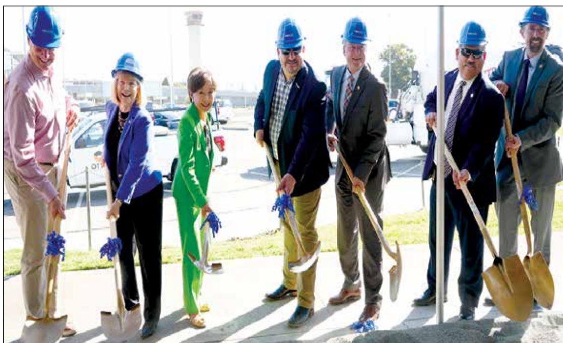
Airport officials, along with local dignitaries, break ground for the new Terminal B parking garage.

Congresswoman Doris Matsui at the groundbreaking event. "This new parking garage will