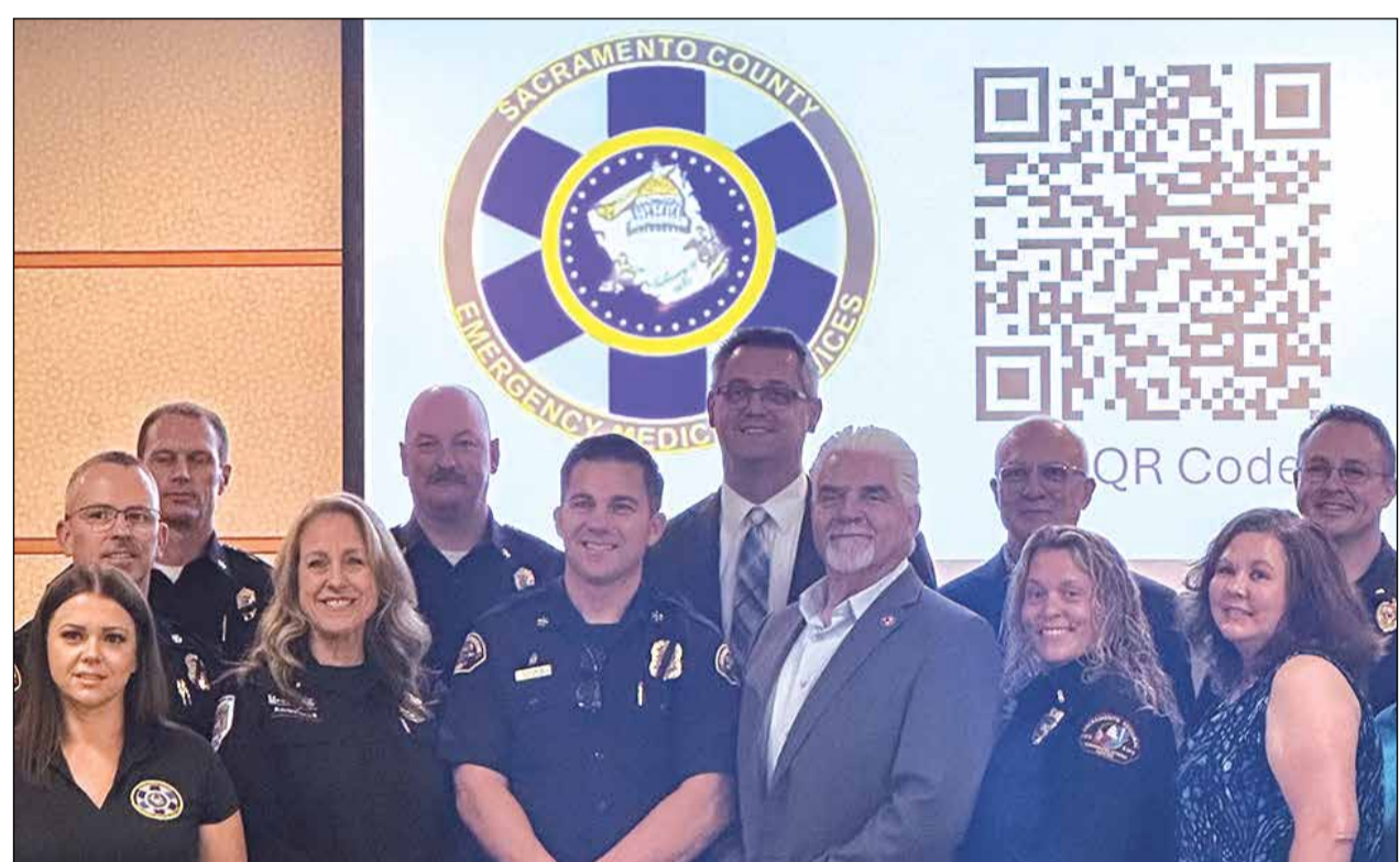
Metro Fire and Sacramento County representatives, along with various hospital staff across the county, pose for a group photo.