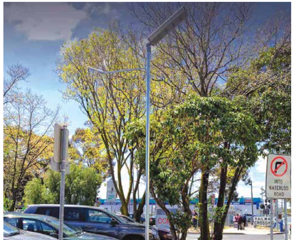
The City of Citrus Heights is building the first of three new solar powered streetlights to help enhance public safety. This photo illustrates the design proposed for Walnut Drive, just east of Auburn Blvd.