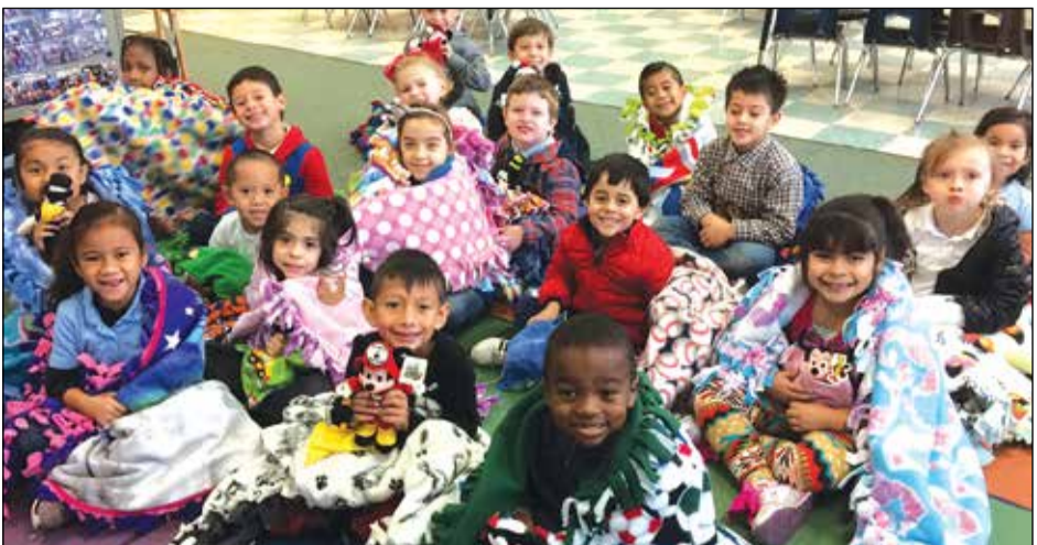
Kindergarteners are giddy with their blankets and Beanie Babies from Sacramento Blankets for Sacramento Kids.

By Claire Gliddon, Sacramento Blankets for Sacramento Kids