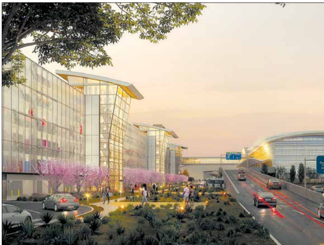
Here is an architectural rendering of the future Terminal B parking garage as seen from street level.

"Today's groundbreaking is another important step to realize the SMF Forward vision and deliver tangible improvements for our community," said