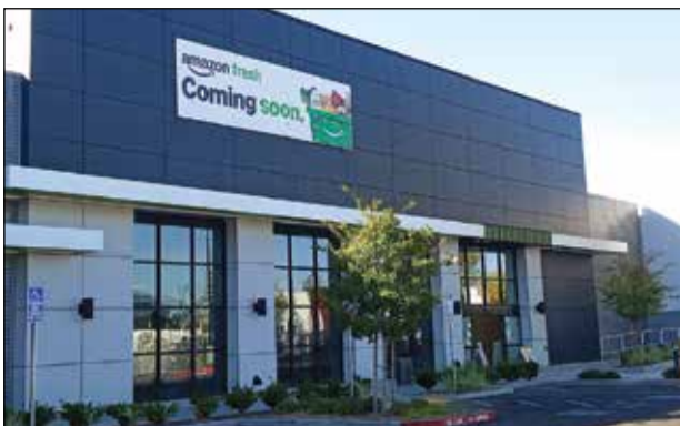
Amazon Fresh's Citrus Heights location is expected to open this fall.