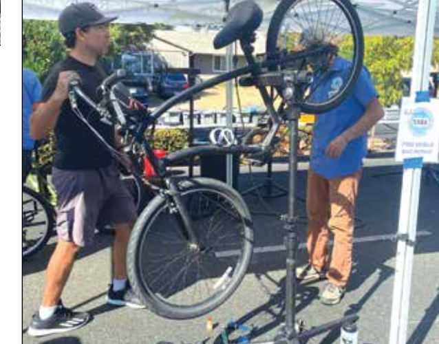
Free bike repairs were available for attendees at the event.

Sacramento Area Bicycle Advocates (SABA) hosted the event in partnership with Bicycling Advocates Rancho Cordova (BARC) with support from the City's Community Enhancement and Investment Fund. The event draws inspiration from Bogota, Colombia's Ciclovia, where streets are similarly closed to cars for