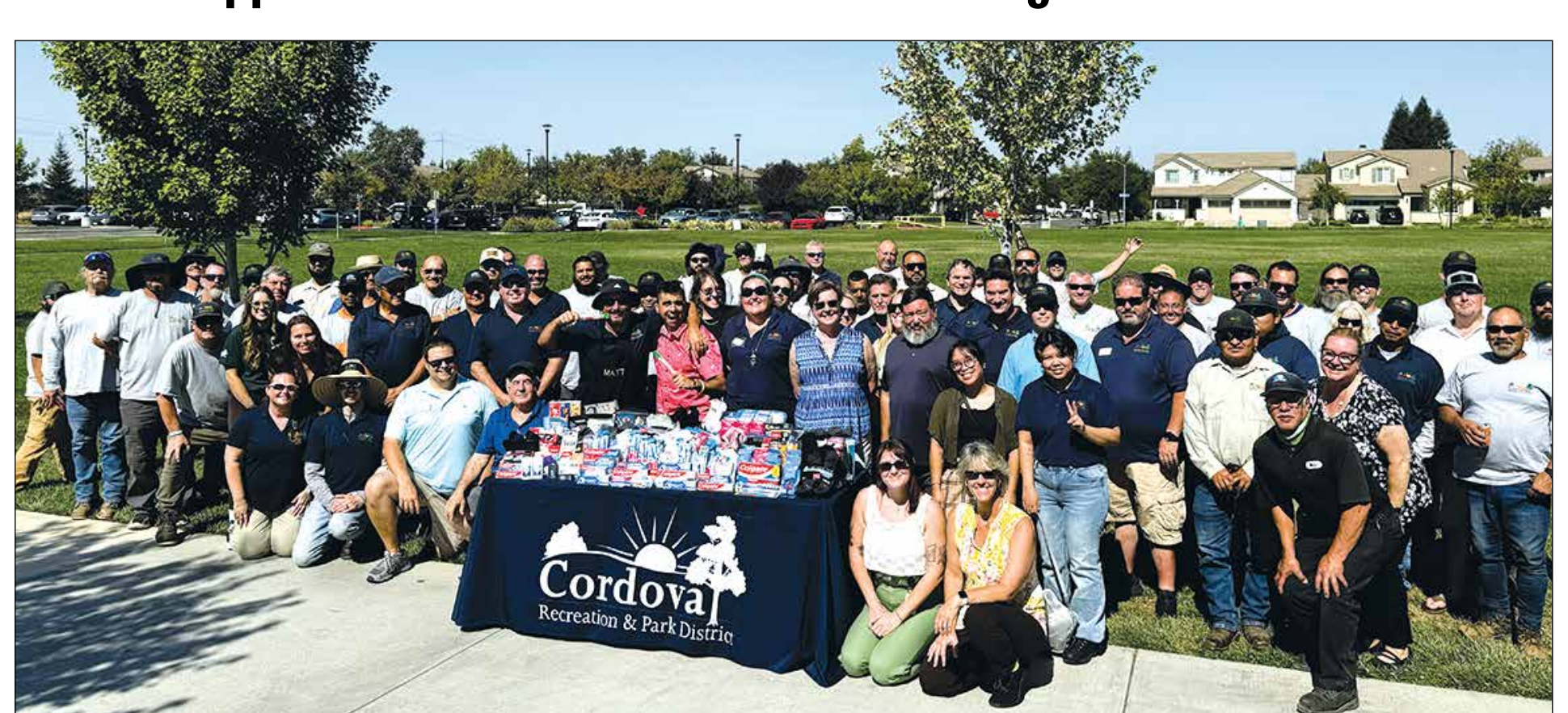
Cordova Recreation & Park District Board of Directors and staff stand with toiletry donations for the Folsom Cordova Unified School District's Families in Transition Services program.