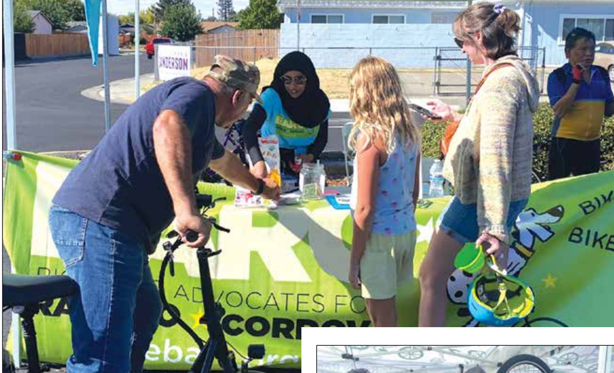
The inaugural Cicladova event happened on Oct. 10 hosted by Sacramento Area Bicycle Advocates and Bicycling Advocates Rancho Cordova.