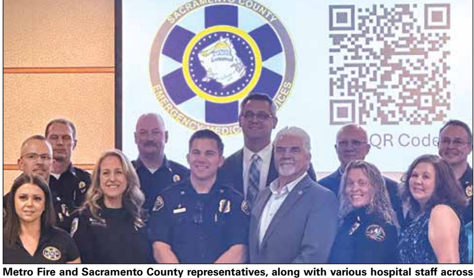
the county, pose for a group photo.

not exceed 30 minutes and required a report to the California Emergency Medical Services Authority by July 1 of this year. Additionally, the bill mandated that hospitals submit by Sept. 1 of this year.