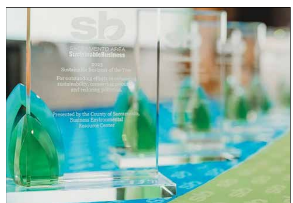
Eight businesses in Sacramento County were recognized Sept. 26 for their commitments to sustainability.