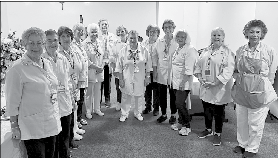
The Mercy Hospital Guild volunteers served 608 hospital staff members tea sandwiches and baked goods at the annual personal tea in May.