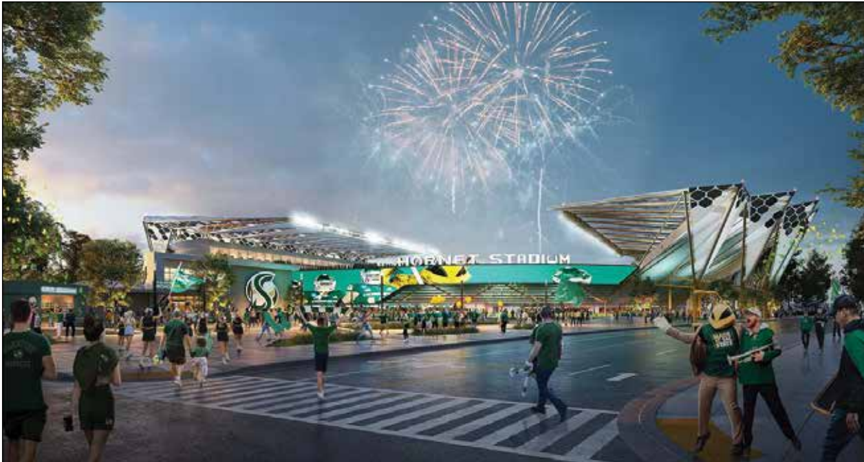
Here is an architectural rendering of the future Hornet Stadium from ground level.