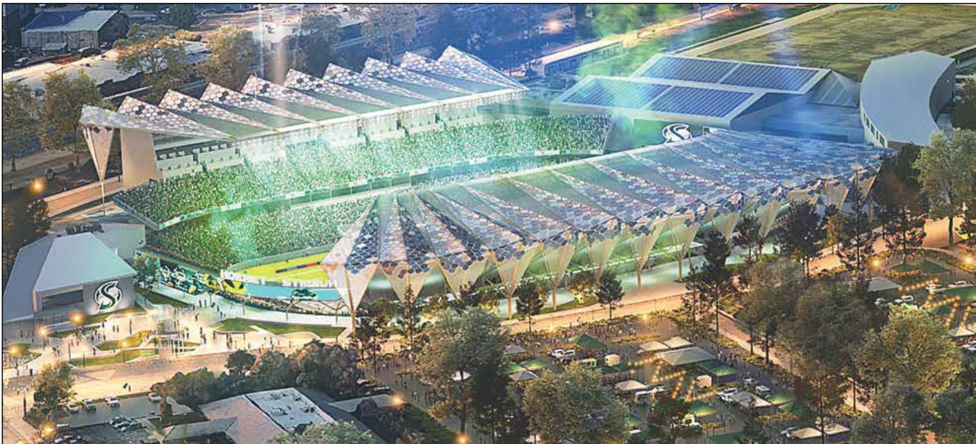
Here is an architectural rendering of the future Hornet Stadium from ariel view.