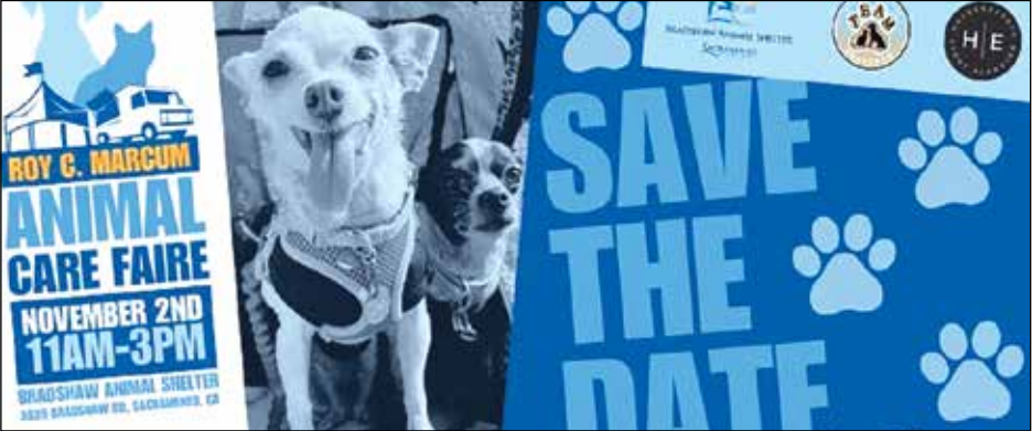
Pets will be available for adoption at the Nov. 2 Pet Festival.