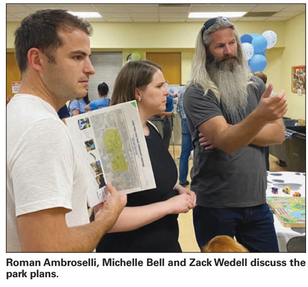
high-density areas where