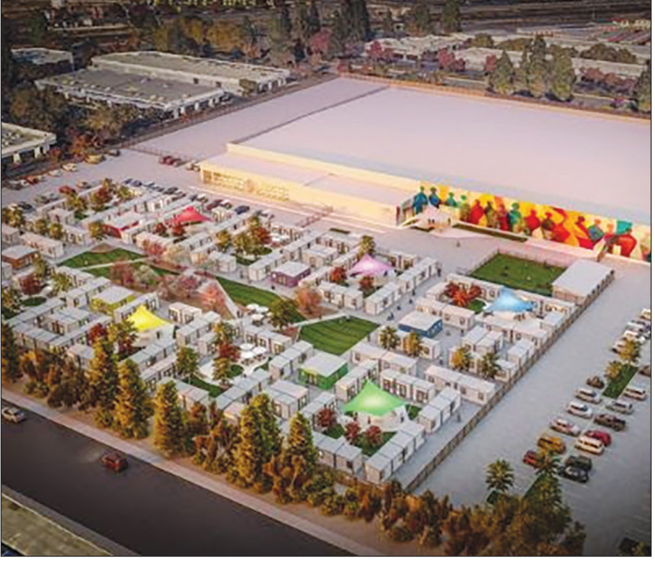
The Watt Service Center and Safe Stay, if open for at least 15 years, will serve about 18,000 unsheltered people.

The Watt Service Center and Safe Stay (Center) provides the space and opportunity to make all of these visions a reality.