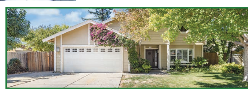
7346 Flowerwood Way, Sacramento 95831 3 Bd 2.5 Bath 2,235 Sg. Ft. 7,405 Sg. Ft. Lot