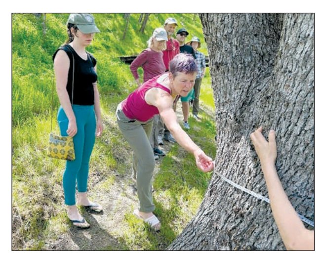
During Tuleyome's Certified California Naturalist course, participants are introduced to different ways to measure ecosystem health.

Davis campus. No advanced degrees or previous naturalist