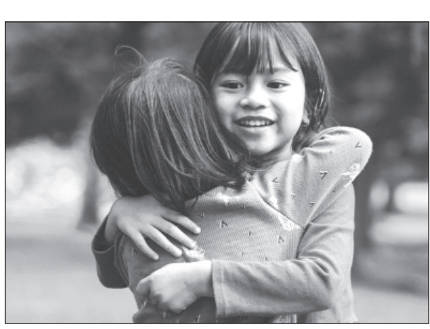
Sacramento County has partnered with HeartLand Child and Family Services to decrease bullying in the county.

This month, the HeartLand team participated in community events to promote anti-bullying messages, share resources