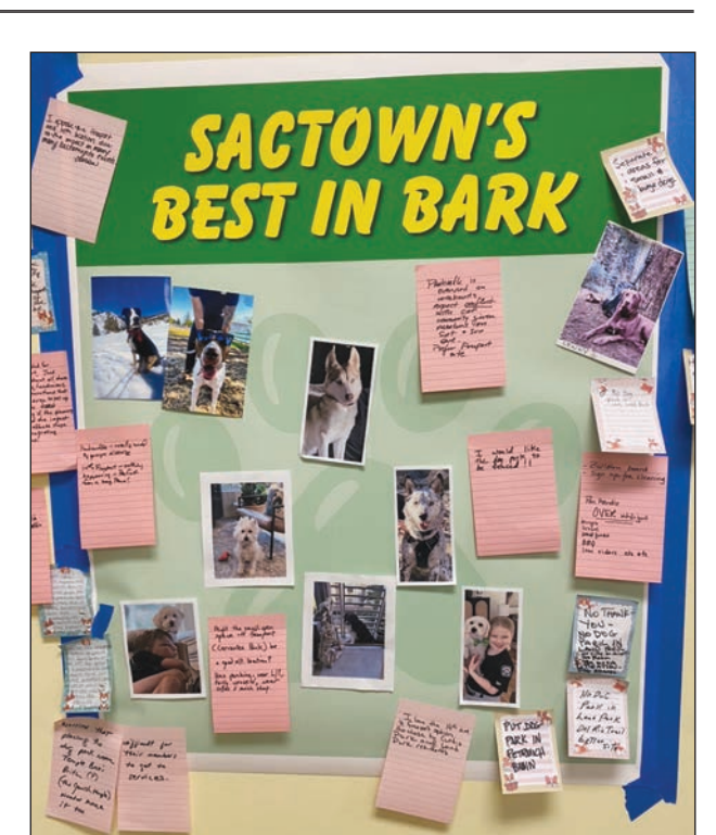
People were encouraged to bring photos of their dogs and leave more written comments on the board.

those surveyed who worry about aggressive dog behavior. Currently, only seven park rangers are on duty to patrol over 140 of Sacramento's parks. No one should expect regular park enforcement around dog issues.