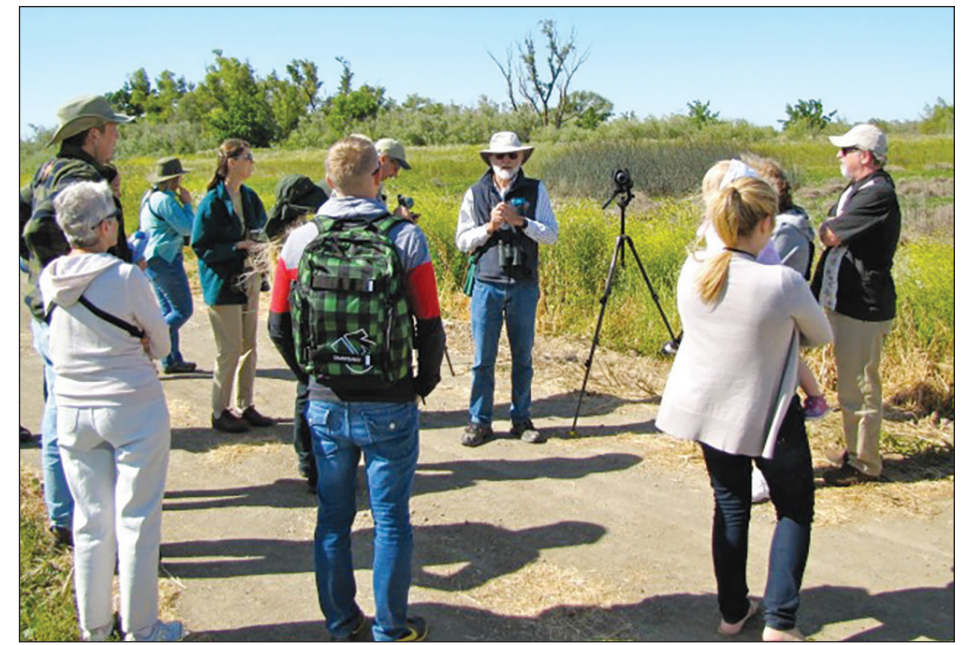
A tour group learns about the Yolo Bypass Wildlife Area.