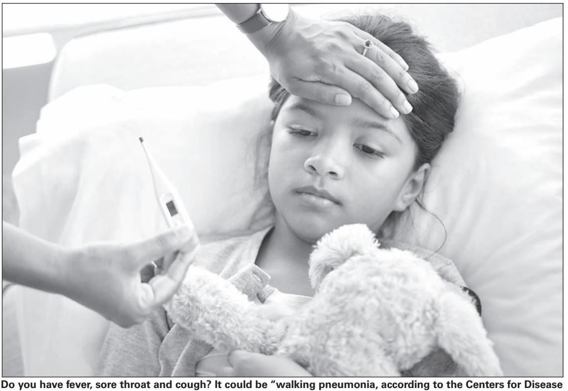
Control and Prevention, which is on the rise.

"Pneumonia Mycoplasma, also known by the nonmedical term 'walking pneumonia,' is caused by the bacteria Mycoplasma pneumoniae, which causes a respiratory tract infection. These can be mild infections which, most often, do not require hospitalization, but for some, they can be severe and