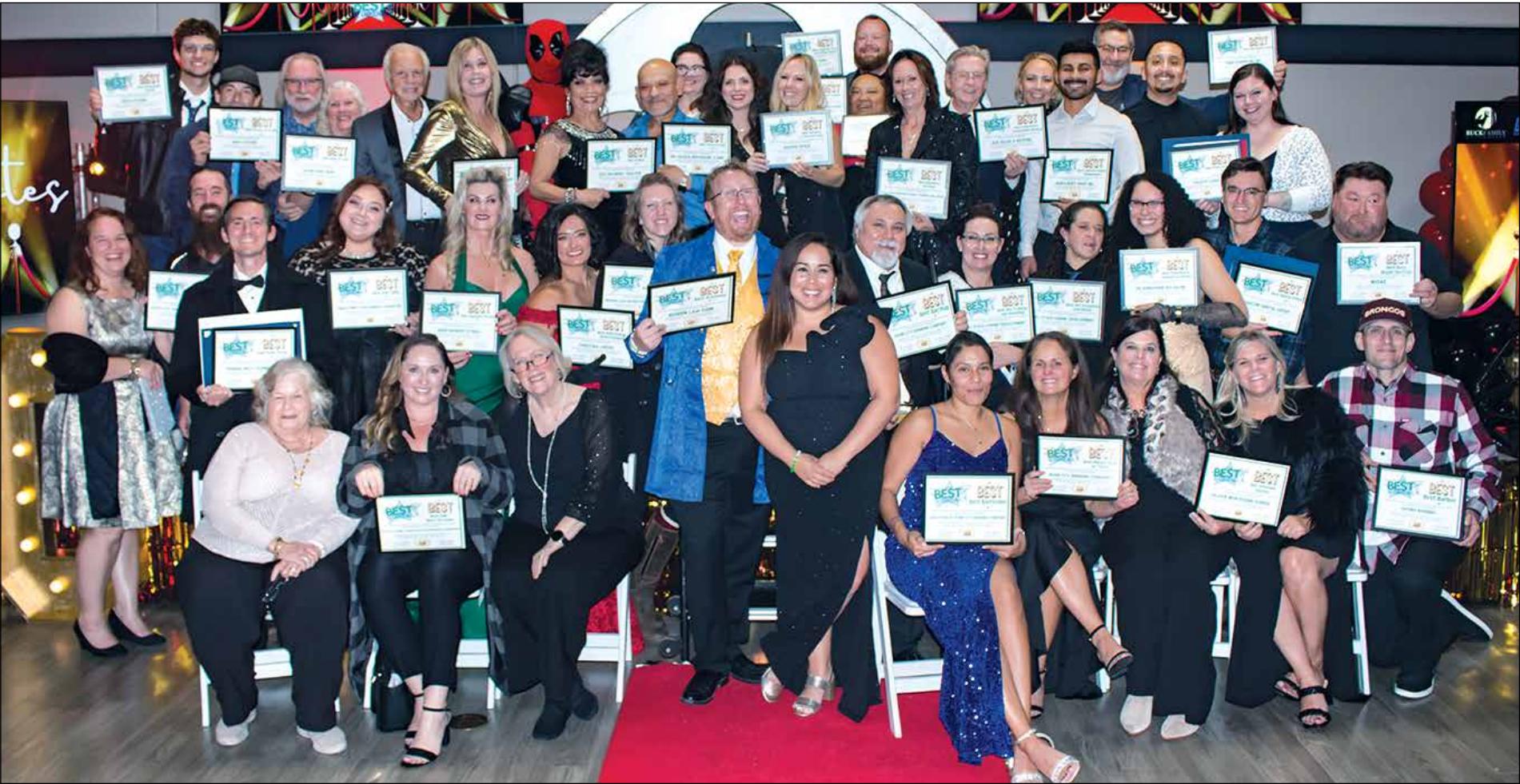
Winners in dozens of business and service categories unite at the Best of Carmichael gala. The 2024 community contest enthused more than 18,500 voters.