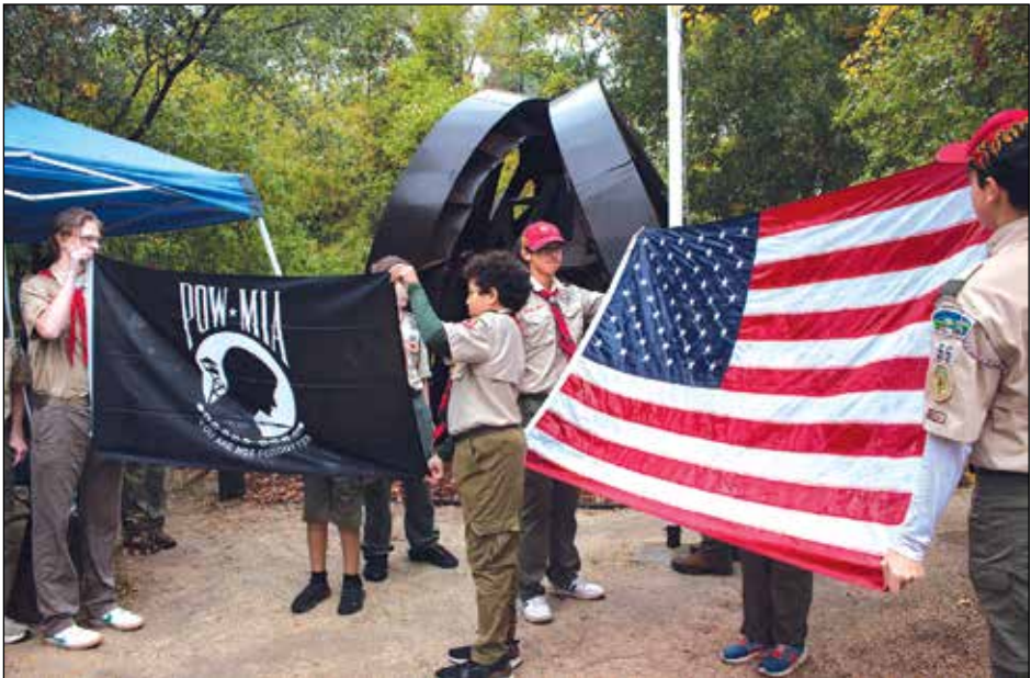
Braving heavy rain, Carmichael Scouts present flags for observances.