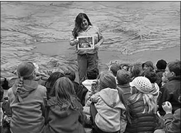
Nimbus fish hatchery staff lead youngsters in exploration of the salmon life-cycle.

The Nimbus fish hatchery visitor center is located at 2001 Nimbus Road, Gold River. ★