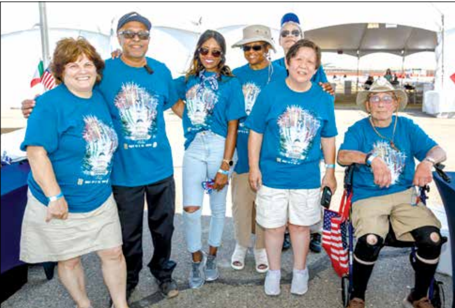
California Capital Airshow's annual airshow receives support from more than 1,000 dedicated volunteers. Sign-ups for the 2025 Airshow are open now.

Community Members Invited to Learn About Volunteer Opportunities for March Airshow