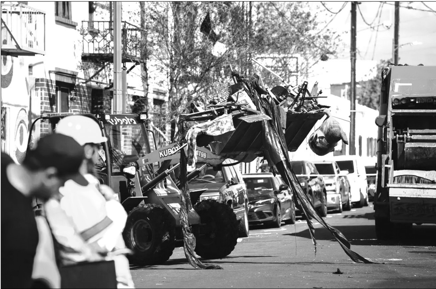
Gov. Gavin Newsom has endorsed the sweeping of homeless encampments.

“There is no compassion in allowing people to suffer the indignity of living in an encampment