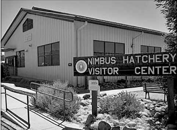
The Nimbus fish hatchery visitor center is the place to learn about the American River Fall salmon run.