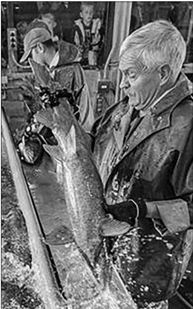
An adult salmon is harvested for eggs or roe as a tour-group watches at the Nimbus fish hatchery.