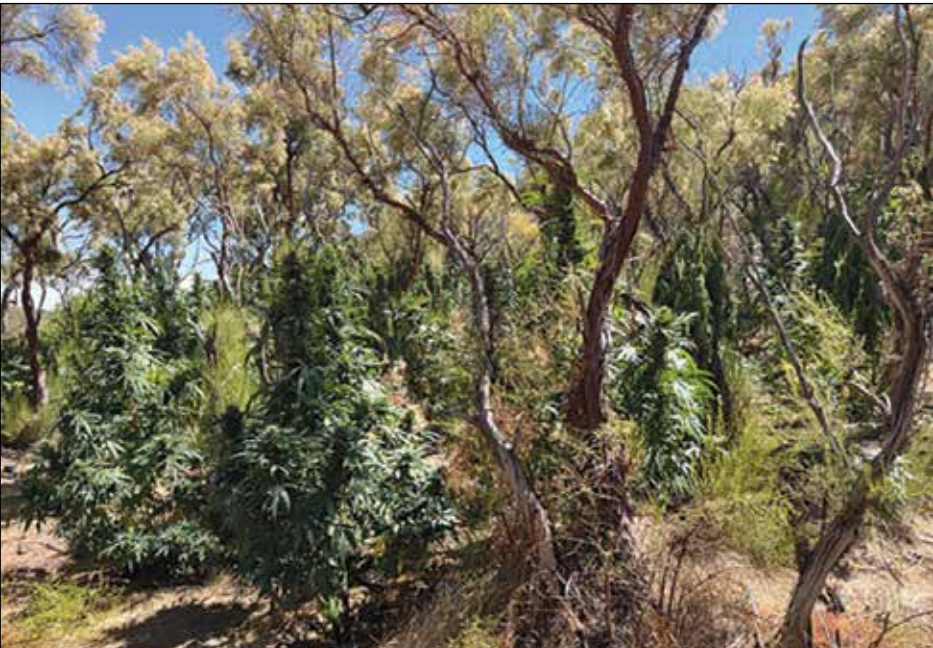
Pictured here is illegal cannabis growing at Anza Borrego Desert State Park.