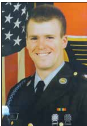
Photos of veterans were hung on the wall of Hometown Buffet, a former restaurant in Citrus Heights.