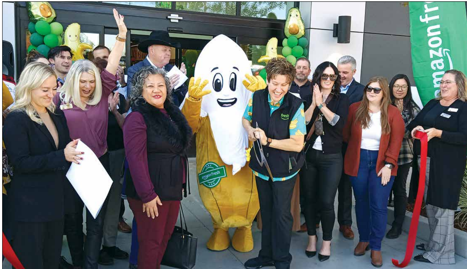
Citrus Heights city officials and Citrus Heights Chamber of Commerce members joined together in an official afternoon ribbon-cutting ceremony.

Staff members actively engaged with customers and a “Good to See you, Citrus