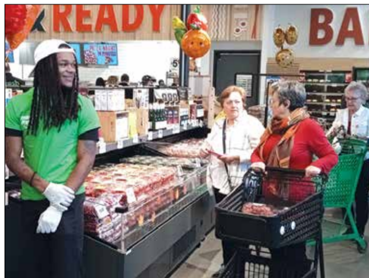
Customers will find national brands, produce and protein, as well as Amazon’s private-labeled brands.

The new grocery store features its latest brick-and-mortar design. Customers will find national brands, produce and protein, as well as Amazon’s private-labeled