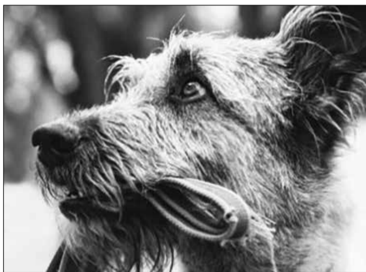
Bradshaw Animal Shelter and the City of Citrus Heights have partnered to provide comprehensive animal services to the local community.

The partnership officially began on Sept. 1, following the conclusion of Citrus Heights' contract with Placer County on Aug. 31. The agreement with Sacramento County is set for five years, with an option for renewal. Through