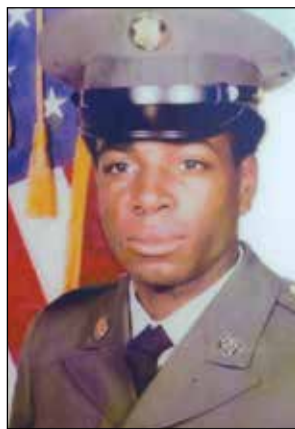
Anyone who recognizes faces in the photos can contact Debbie Luce.