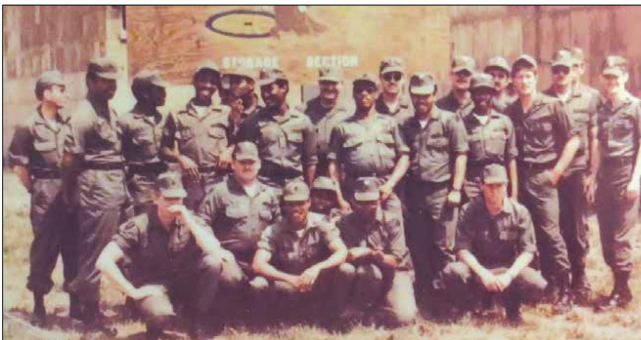
A group of veterans poses in an undated photo.