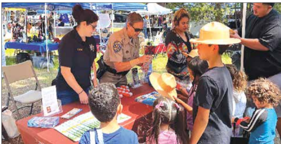
By working closely with tribal leaders and members, the CHP seeks to address specific concerns and provide meaningful support to Native American communities throughout the state.