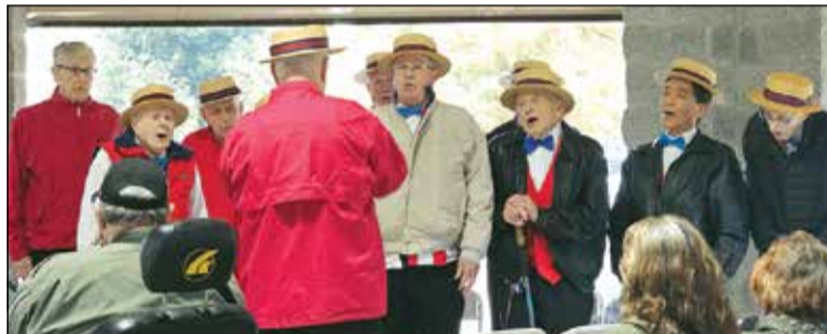
A local singing group performs a patriotic tune.