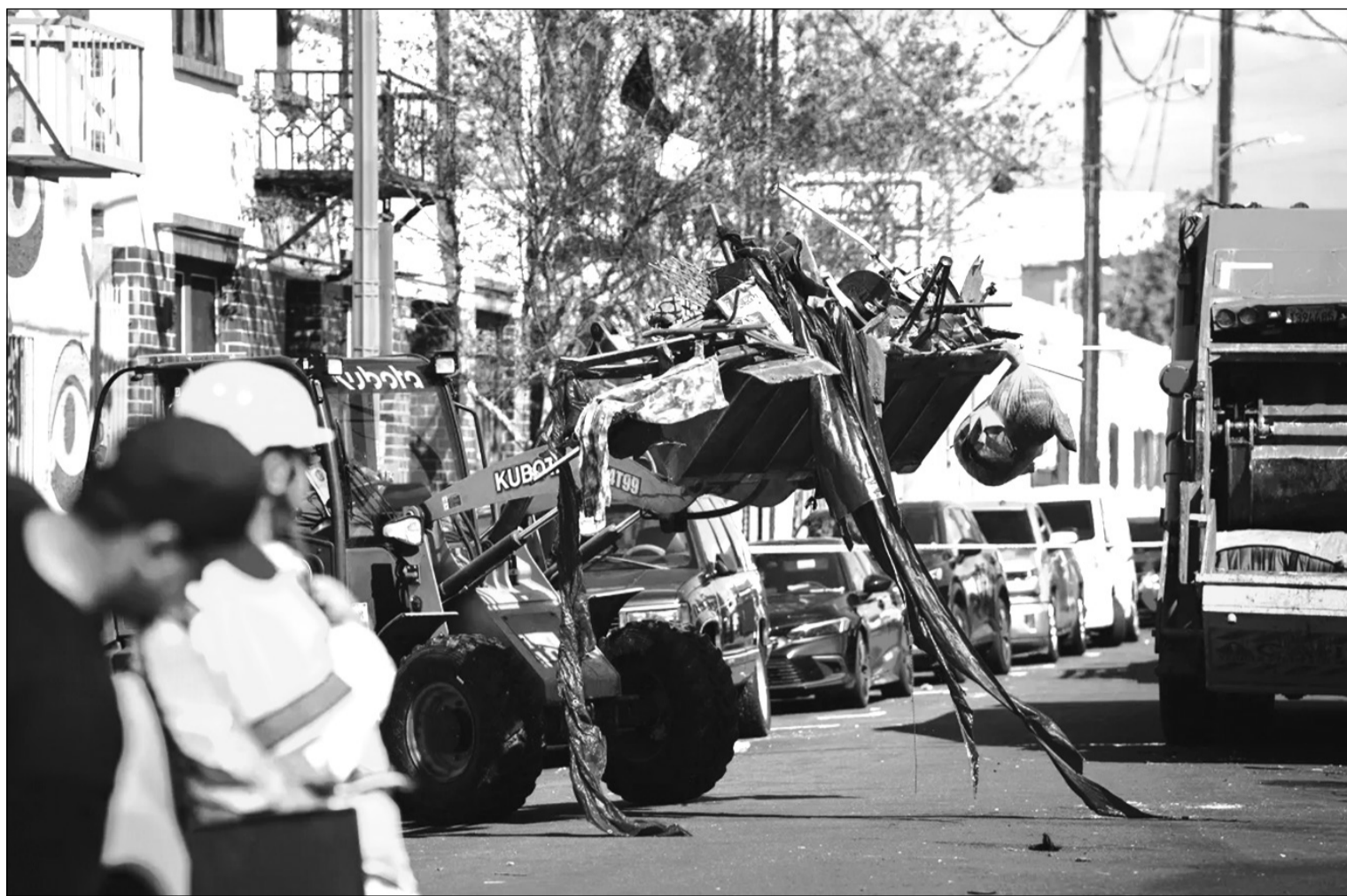
Gov. Gavin Newsom has endorsed the sweeping of homeless encampments.

"There is no compassion in allowing people to suffer the indignity of living in an encampment