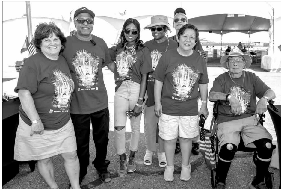
California Capital Airshow's annual airshow receives support from more than 1,000 dedicated volunteers. Sign-ups for the 2025 Airshow are open now.

Community Members Invited to Learn About Volunteer Opportunities for March Airshow