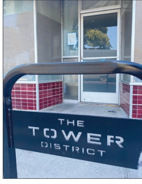
The Tower District new Broadway office by the Tower restaurant is scheduled to open in spring of 2025.

"3rd Space is an effort to reconnect communities divided by freeways,"