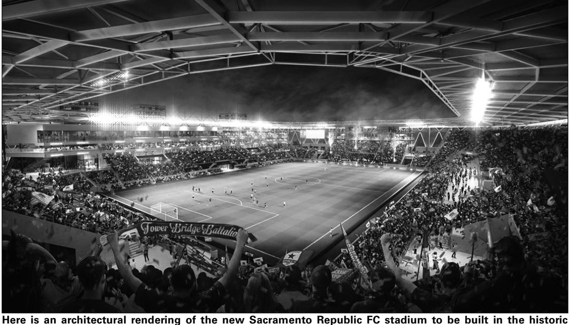
Sacramento Railyards district.

The agreement, albeit non-binding, does include information regarding project costs, economic impact and anticipated public and private funding sources. The estimated $321 million price tag breaks down to, $175 million for the new stadium, $56 million for the new live entertainment venue and $90 million for associated