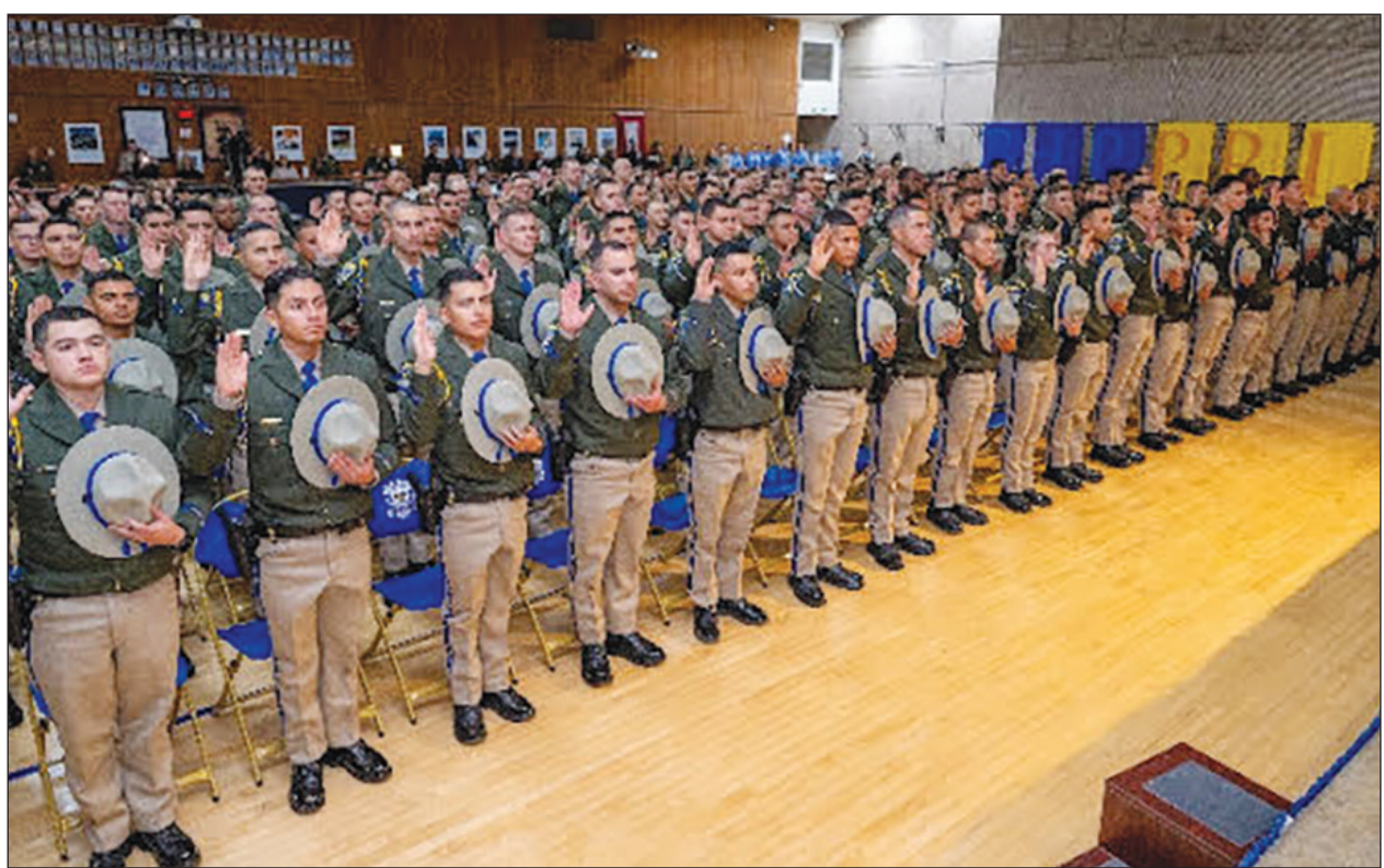
CHP swears in 121 new officers on Nov. 15 at the CHP Academy in West Sacramento.