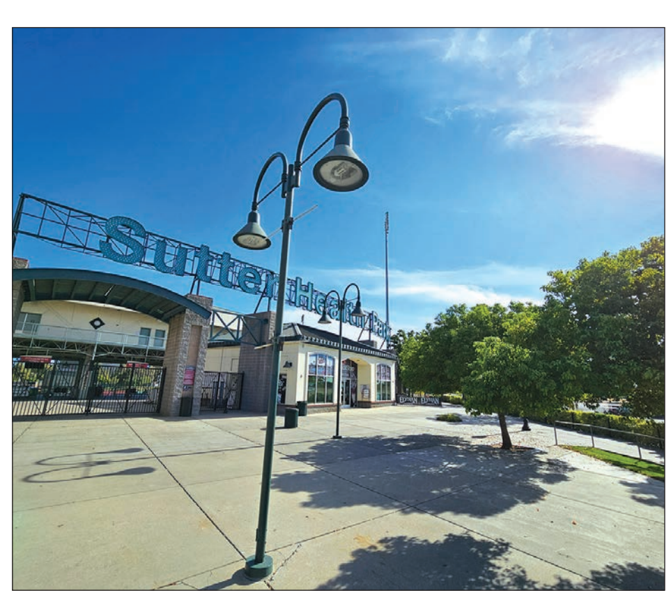
Sutter Health Park in West Sacramento will be home to Major League Baseball's Athletics for the 2025 season.