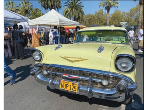
More free events like Extra Butter are planned for the Tower parking lot.