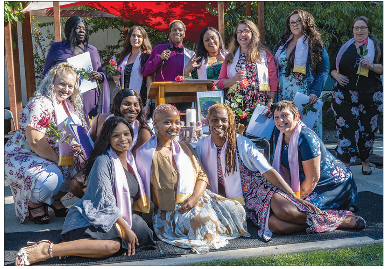
Graduates from Women's Empowerment's latest job readiness session gather after their ceremony in September.

Kristin Thebaud Communications News Release