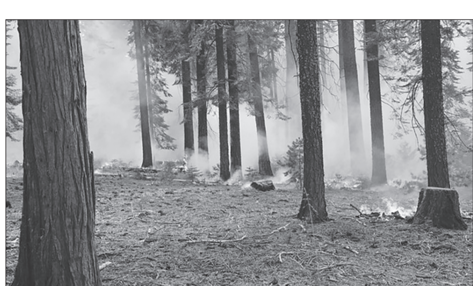
Prescribed fire is used as a tool to manage healthy forests.

California Department of Forestry and Fire Protection News Release