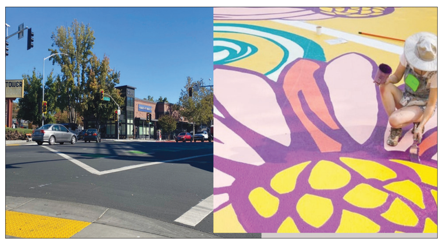
The intersection of Broadway and Land Park Drive is scheduled for an asphalt art installation in 2025. Street photo by Kristina Rogers/Art and painter photo by asphaltart.bloombert.org