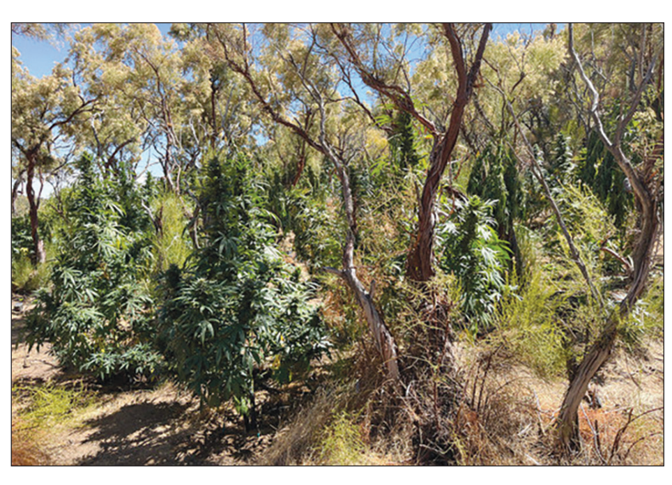
Pictured here is illegal cannabis growing at Anza Borrego Desert State Park. Photo from