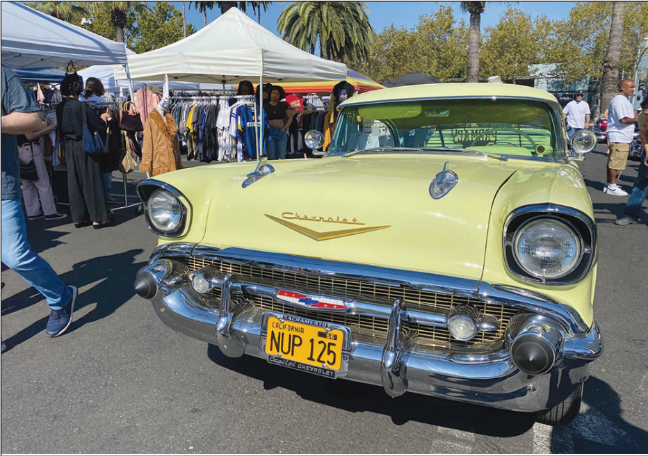
More free events like Extra Butter are planned for the Tower parking lot.