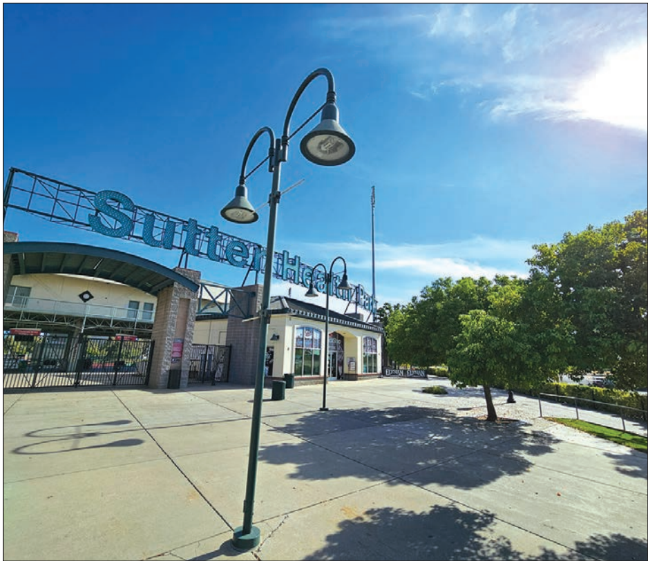
Sutter Health Park in West Sacramento will be home to Major League Baseball’s Athletics for the 2025 season.