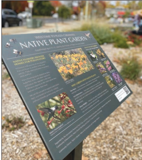
The educational sign stands proudly at Plaza Cervantes Park.