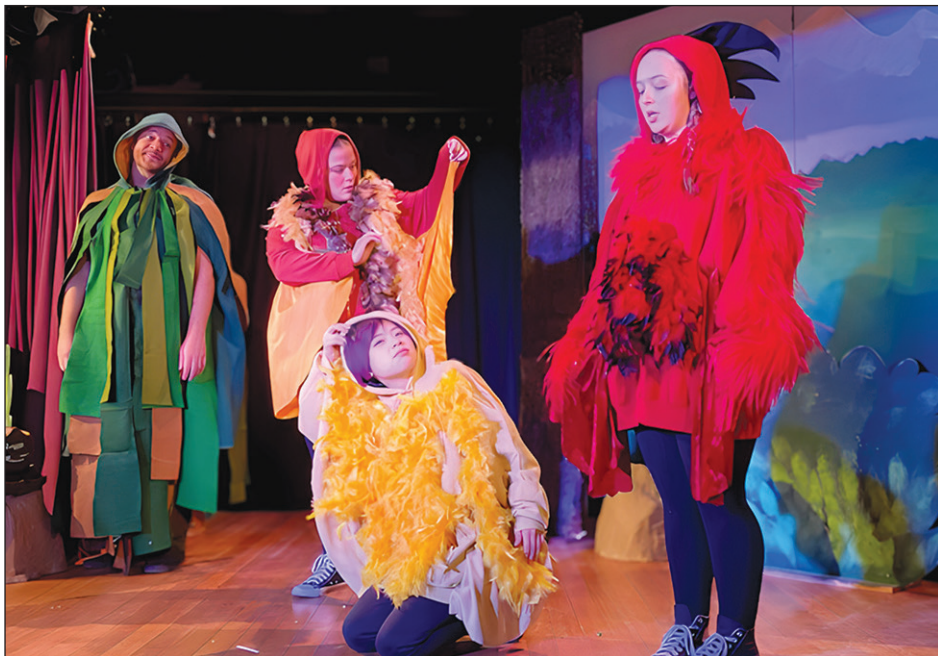
A scene from "Little Bird’s Second Chance," playing weekends through November and again in January at Fairytale Town.