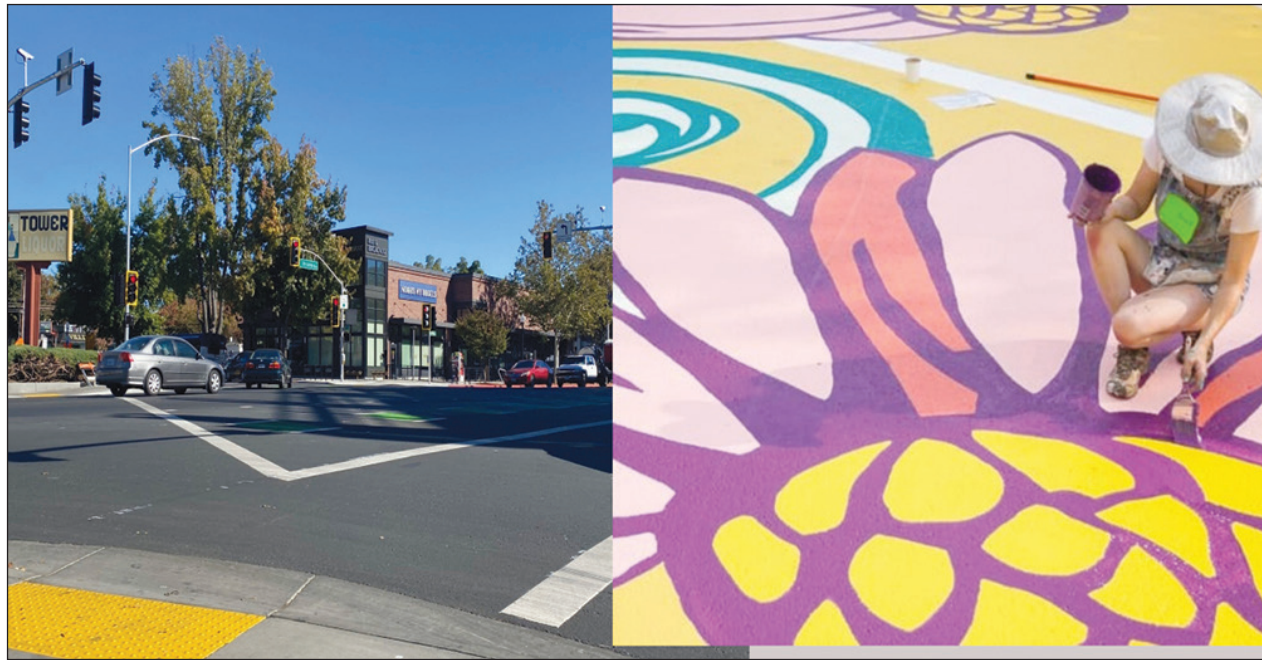
The intersection of Broadway and Land Park Drive is scheduled for an asphalt art installation in 2025. Street photo by Kristina Rogers/Art and painter photo by asphaltart.bloombert.org

Tower District maps out a creative corridor ecosystem