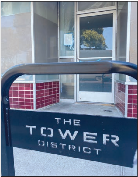
The Tower District new Broadway office by the Tower restaurant is scheduled to open in spring of 2025.