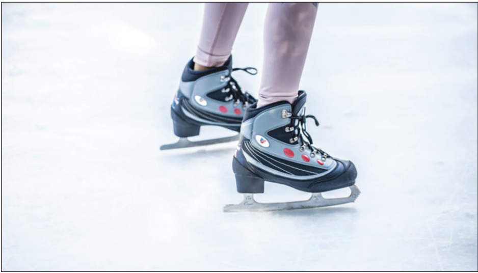
The Downtown Sacramento Ice Rink opened for the 2024 season on Wednesday, Nov. 6.

SACRAMENTO, CA (MPG) - A Sacramento holiday tradition, the Downtown Ice Rink presented by Dignity Health is the perfect place to gather with friends and family to enjoy the holidays. The rink officially opened for the 2024 holiday season on Wednesday, Nov. 6. For more than 30 years, the Downtown Sacramento Ice Rink has transformed the neighborhood into a winter wonderland. Located in Ali Youssefi Square right outside Golden 1 Center and some of the best restaurants in the city, the rink is the perfect place to spend a winter day. We partner with other local organizations throughout the season to offer discounts and themed activations like craft days, silent disco nights, donation drives and more. Lace up your skates and get ready to laugh at your falling friends