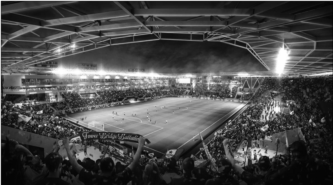
Here is an architectural rendering of the new Sacramento Republic FC stadium to be built in the historic Sacramento Railyards district.

SACRAMENTO, CA (MPG) - A project that was on life support had some much-needed life injected into it on Tuesday, Nov. 12, when the Sacramento City Council voted unanimously to approve the framework for a $321 million downtown railyards soccer stadium and entertainment venue. A long-awaited development needed to provide a permanent home for the Sacramento Republic Football Club (FC). According to the information provided by council staff in support of the proposal, the projects being approved include a soccer stadium with supporting infrastructure occupying approximately 31 acres, as well as a new 3600-seat live entertainment venue that would occupy existing historic buildings in the railyard. The agreement, albeit non-binding, does include information regarding project costs, economic impact and anticipated public and private funding sources. The estimated $321 million price tag breaks down to, $175 million for the new stadium, $56 million for the new live entertainment venue and $90 million for associated