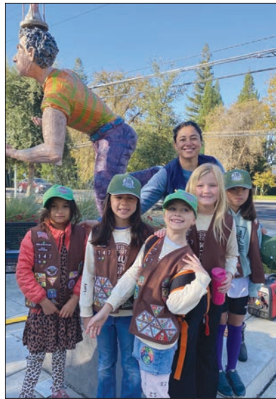
Land Park’s Girl Scout Troop 1147 is eager to plant trees and learn about the native flowers.