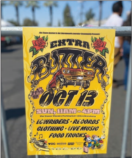
Extra Butter poster on display.