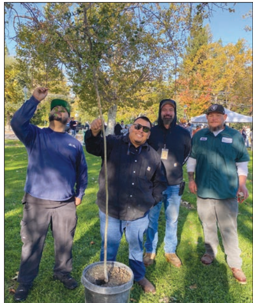
The YPCA team gives the tree planting volunteers a thumbs up.

Community Association and planting organizations look forward to 2025. The groups are speaking about collaborating on other gardening projects such as making improvements to the WPA Rock Garden in William Land Park. If anyone is interested in supporting the neighborhood beautification efforts or would like to find out more about joining a local gardening group, they can go to Sacramento Perennial Plant Club’s website at sacplants.org and the California Horticulture Society’s website at calhortsociety.org . ★