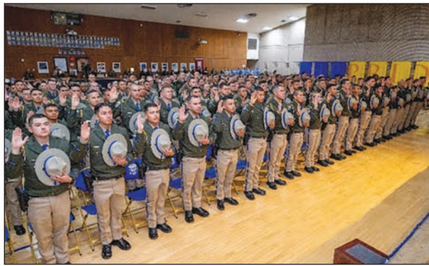
CHP swears in 121 new officers on Nov. 15 at the CHP Academy in West Sacramento.

SACRAMENTO, CA (MPG) - The California Highway Patrol (CHP) proudly announces a major achievement in its ongoing recruitment efforts as it officially swears in 121 new officers, bringing the Department past its goal of hiring over 1,000 officers. This milestone underscores the CHP’s commitment to enhancing public safety and strengthening its presence within communities across the state. The swearing-in ceremony at the CHP Academy in West Sacramento on Nov. 15 marks the culmination of months of rigorous training for these new officers. Each will report for duty to one of