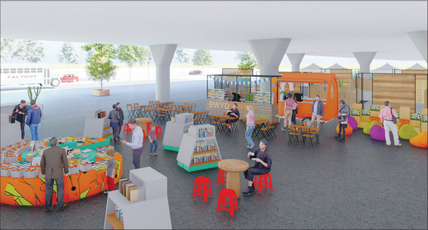
Concept of proposed 3rd Space area under the W/X freeway.