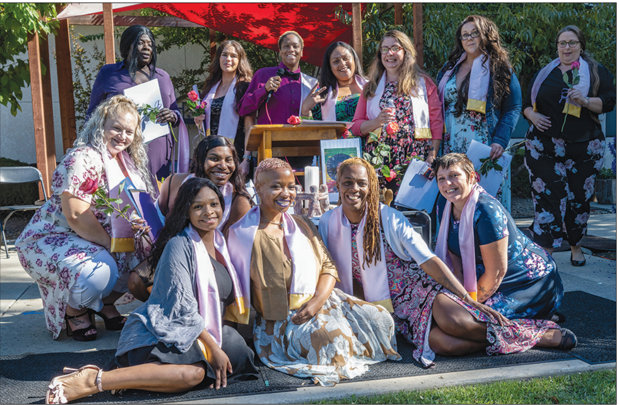
Graduates from Women’s Empowerment’s latest job readiness session gather after their ceremony in September.

employment specialist and volunteer career mentor, and attends a range of classes on job-readiness, empowerment and more. Graduates of the two-month program can enroll in Women’s Empowerment’s paid job training programs in manufacturing, property management, mobility, solar energy, medical assisting and more. Women’s Empowerment also offers its Trellis Gardens transitional workforce housing program for graduates who have secured employment, but still cannot afford market-rate housing for their families. At Trellis Gardens, they can live in cottages for 12 to 18 months as they work to increase income, savings and credit scores and prepare to move into permanent housing. “Supporting the development of a dynamic workforce is an investment in today and our future,” said Ashley Bocek, community affairs manager, U.S. Bank. “We’re proud to work with organizations like Women’s Empowerment to help people succeed in their careers,